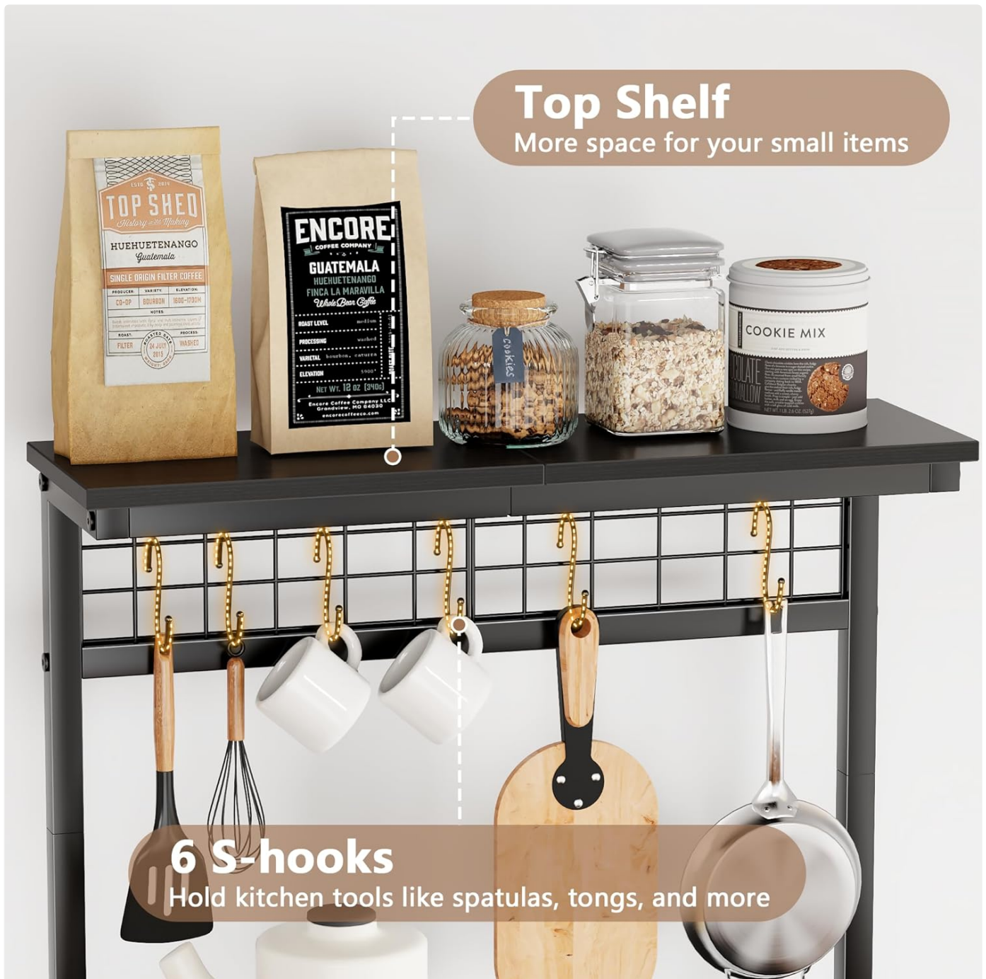
Image 5.1: The top shelf provides space for small items, while the pegboard with S-hooks offers convenient hanging storage for kitchen utensils and mugs.