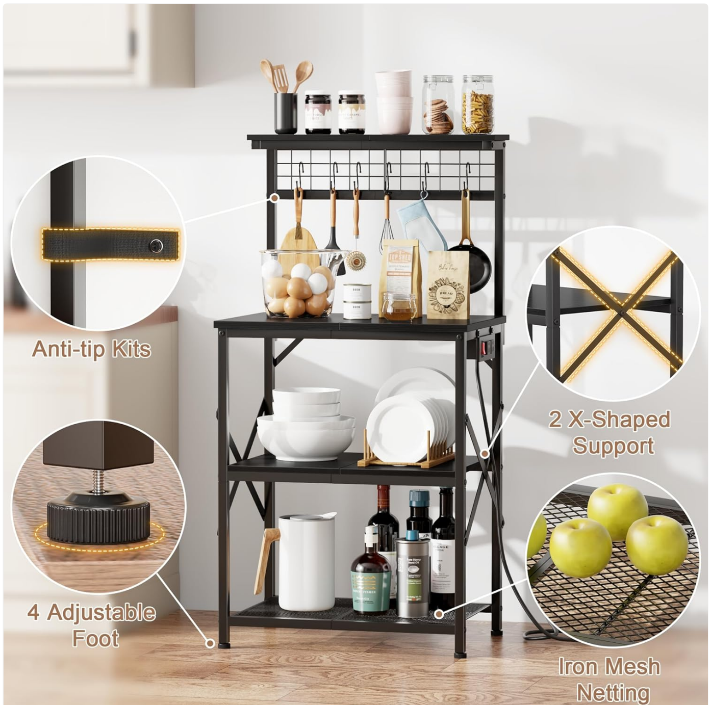
Image 2.1: Key safety and stability features, including the anti-tip kit for wall attachment, X-shaped supports for structural integrity, adjustable feet for leveling, and iron mesh netting on lower shelves.