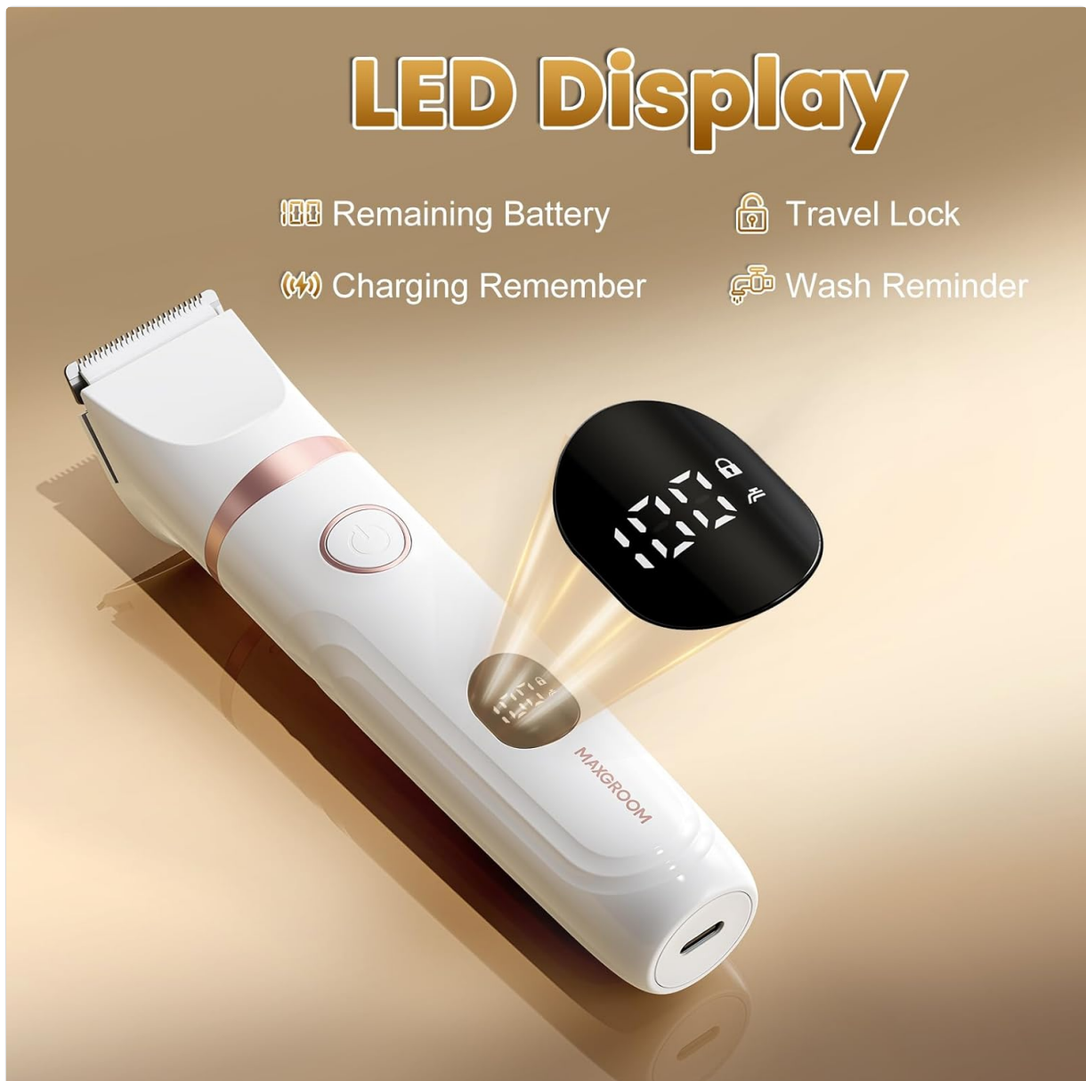
Figure 2: LED Display and Main Unit