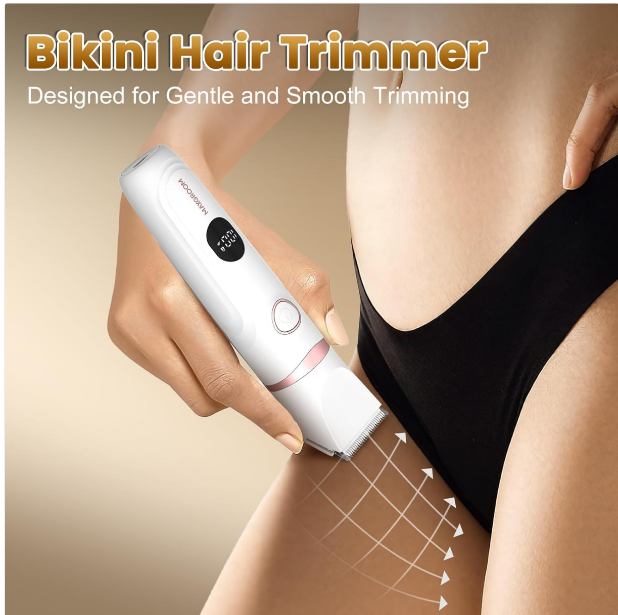
Figure 5: Bikini Trimmer Head in Use

trimmer head first. Attach the desired guide comb (3/6 mm or 9/12 mm) for specific hair lengths.