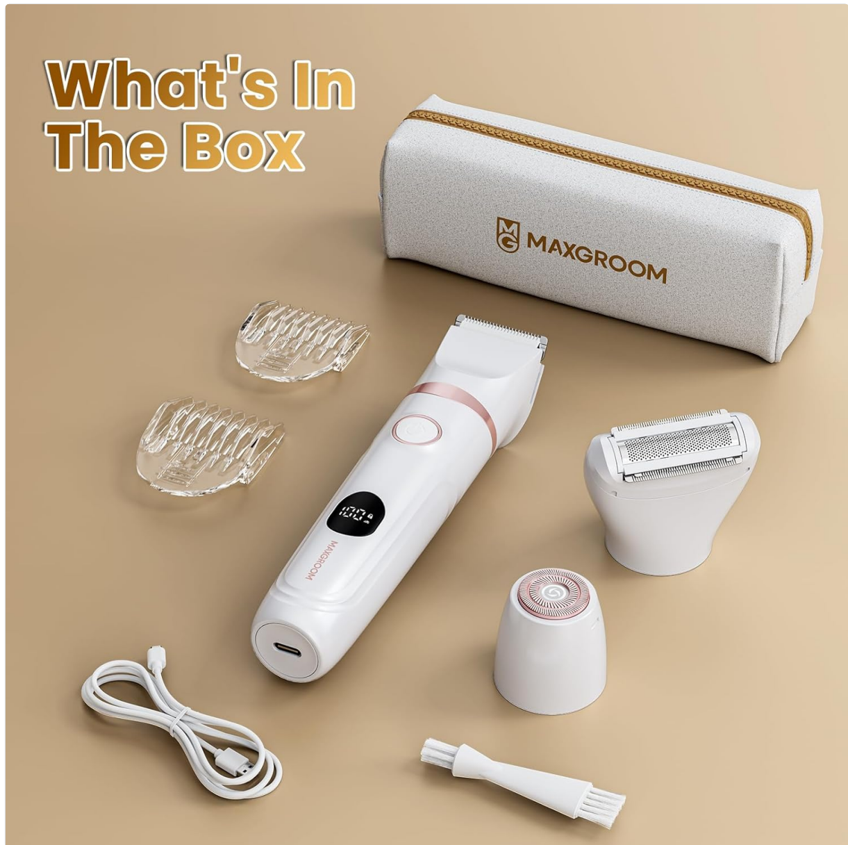
Figure 1: Included Components