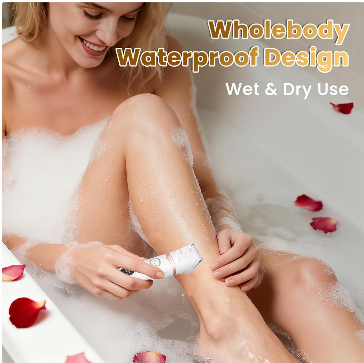
Figure 4: Wet and Dry Use