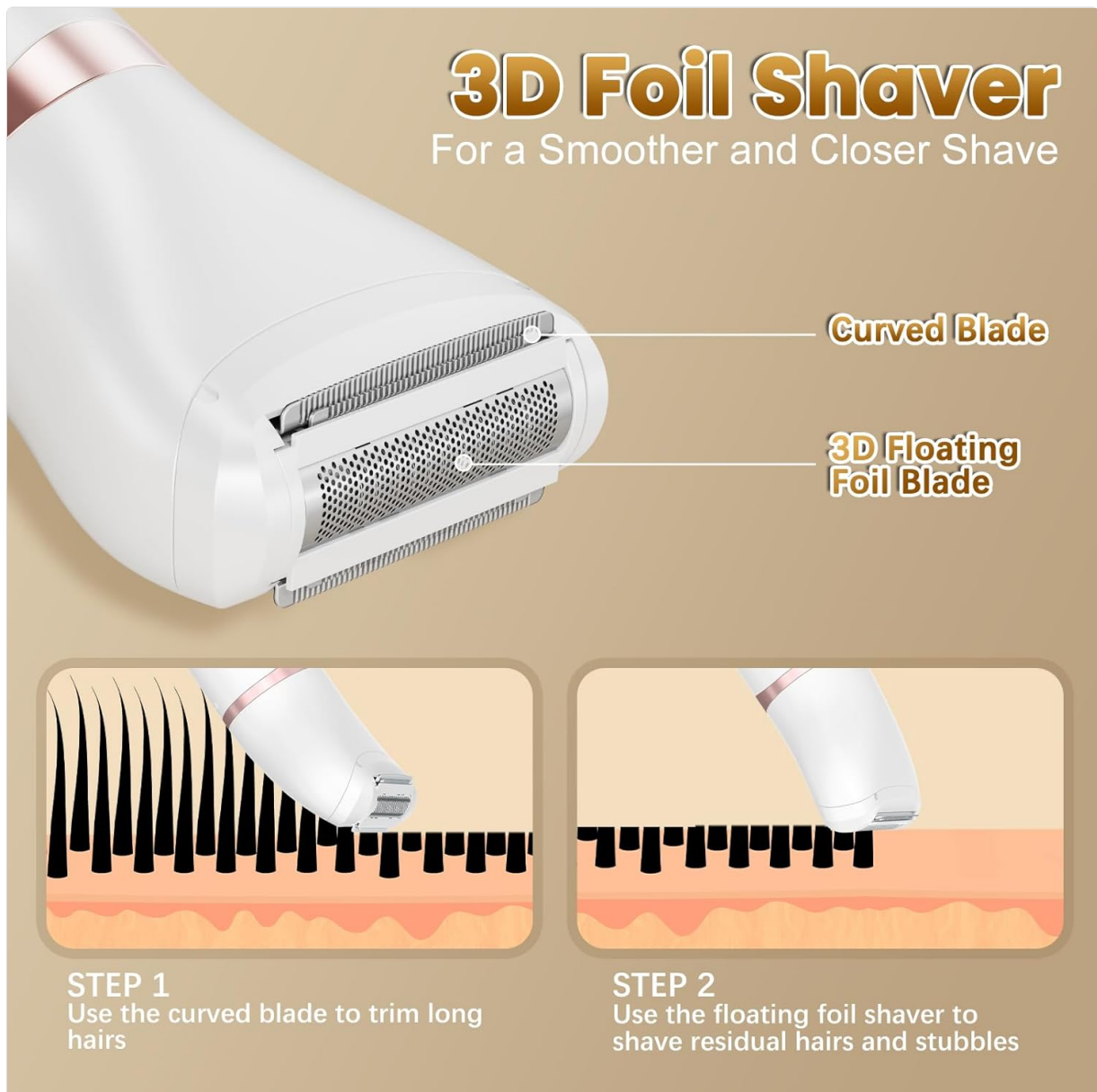
Figure 3: 3D Foil Shaver Head Components

curved blade and 3D floating foil blade.