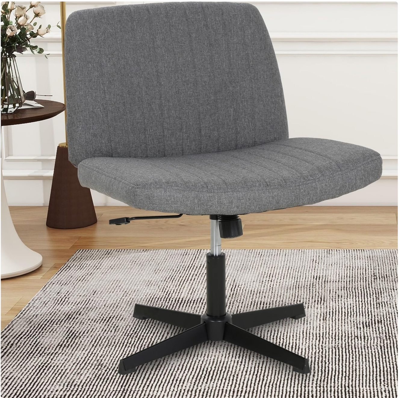
Image: A fully assembled FDW Criss Cross Chair in a home office setting, ready for use.