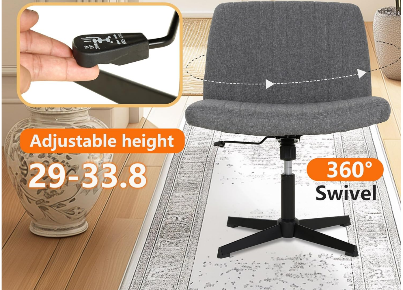
Image: Detail showing the adjustable height lever and indicating the 360-degree swivel capability of the chair.