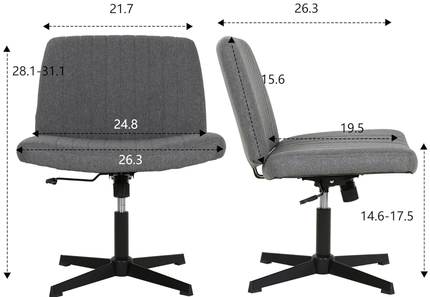
Image: Technical drawing illustrating the detailed dimensions of the FDW Criss Cross Chair in inches.