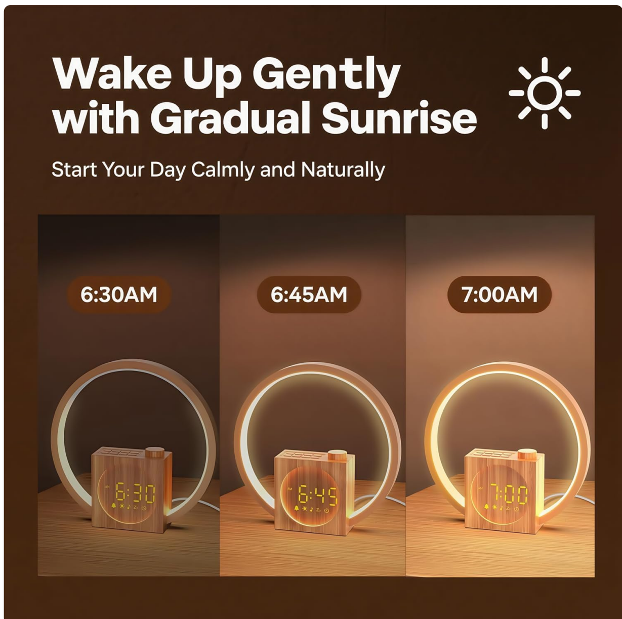
Figure 4.1: Visual representation of the gradual sunrise simulation feature, showing the light intensifying over time from 6:30 AM to 7:00 AM to gently wake the user.