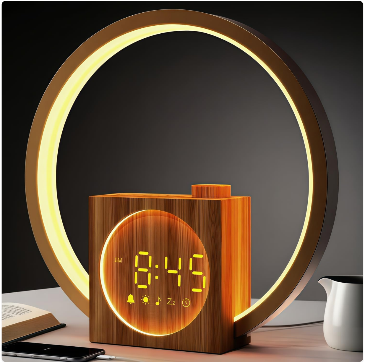
Figure 2.1: Front view of the Tuerthy Sunrise Alarm Clock, showcasing its unique circular light design, wood grain base, and digital time display.