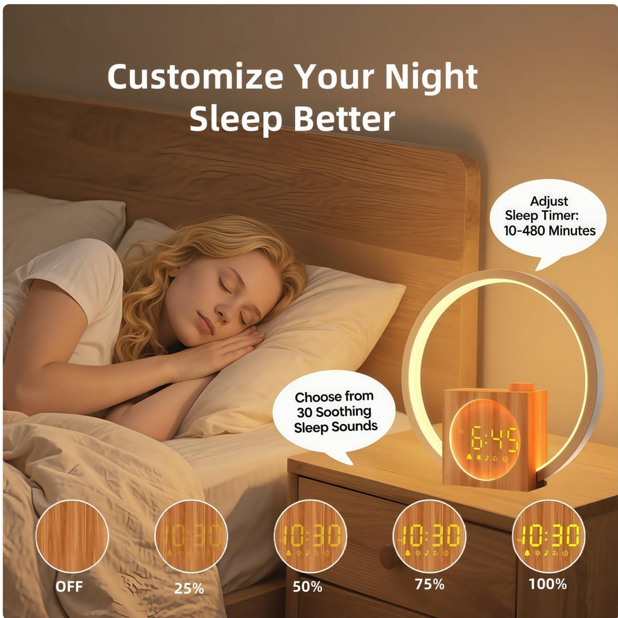
Figure 4.4: An image illustrating the sleep aid function, where the alarm clock provides soothing sounds and a customizable sleep timer (10-480 minutes) to help users fall asleep.