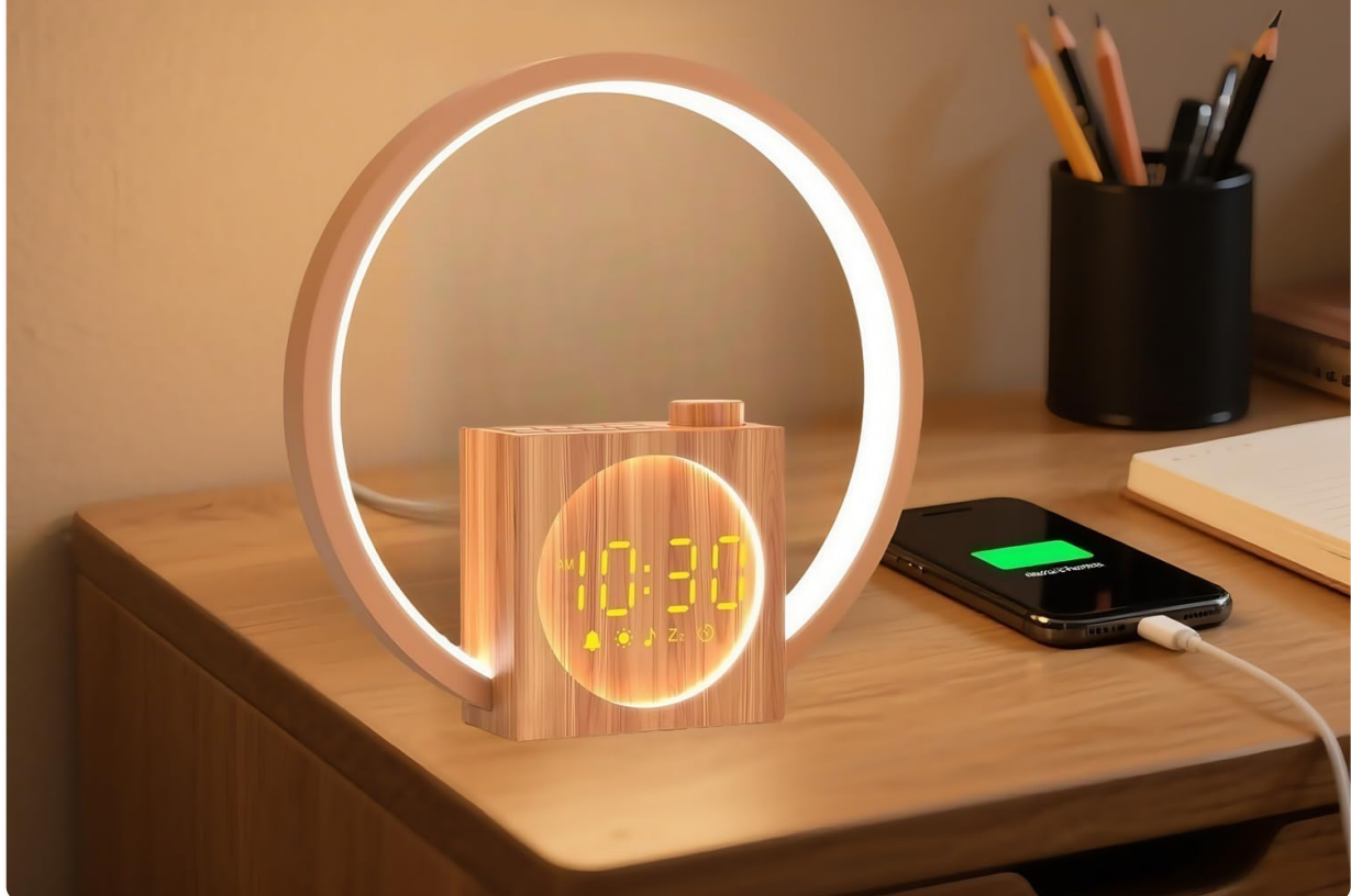
Figure 2.2: An illustration highlighting the core functionalities of the Tuerthy Sunrise Alarm Clock: alarm, natural white noise, sunrise simulation, sleep assistance, and USB charging capability.