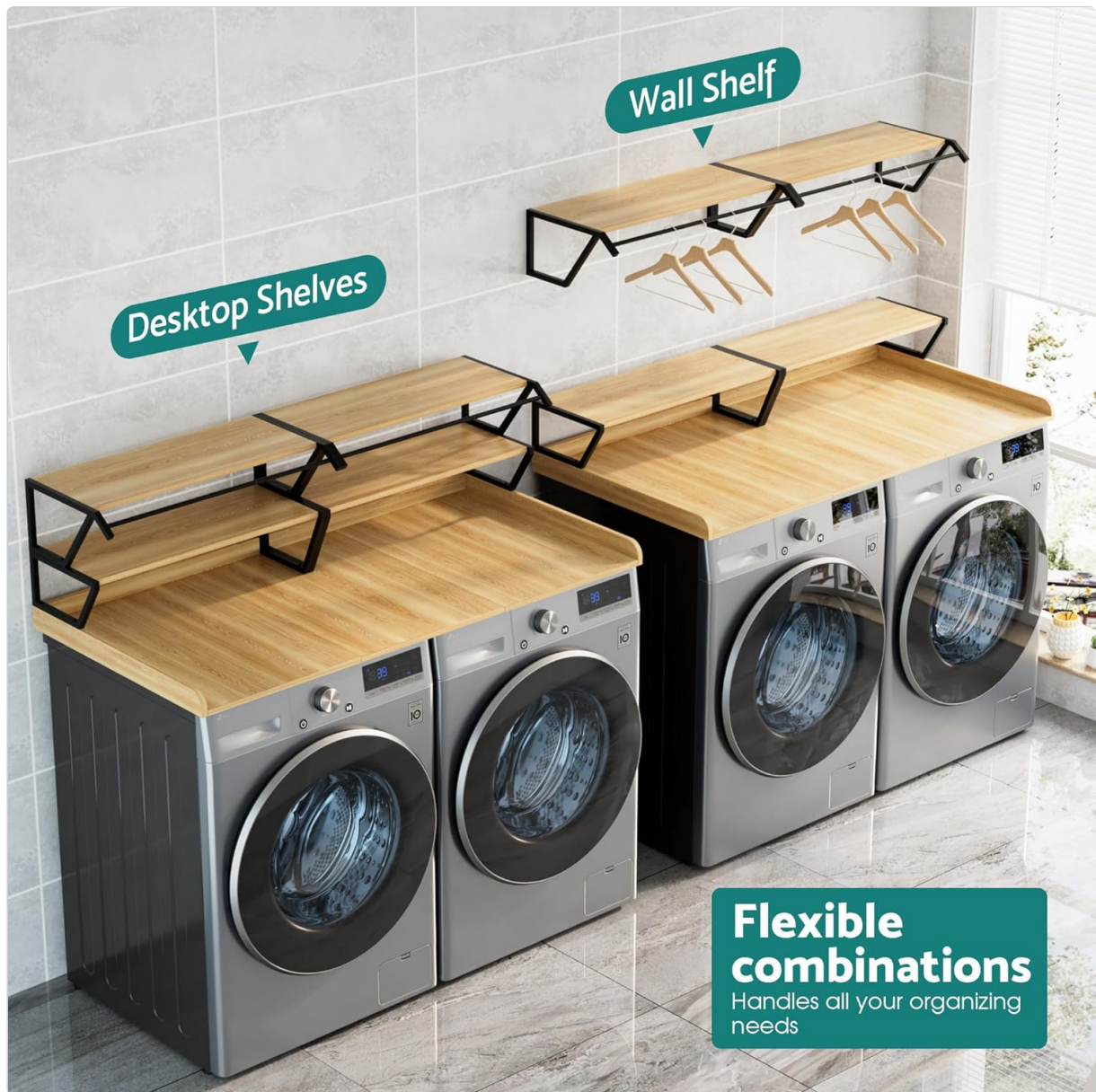
Figure 4: Flexible combinations for desktop and wall shelf installation.