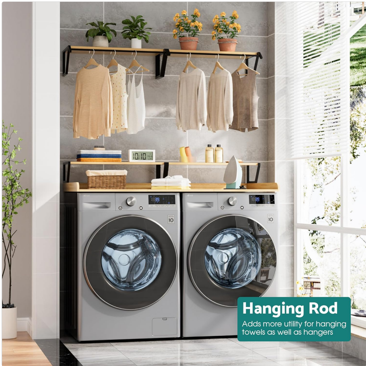
Figure 1: Overview of the Kikihouse Washer Dryer Countertop with Hanging Rod and Wall Shelf.

The countertop fits over most standard washers and dryers, offering a convenient surface for folding laundry and organizing supplies. The included wall shelf and hanging rod provide versatile storage options, allowing you to customize your laundry space.