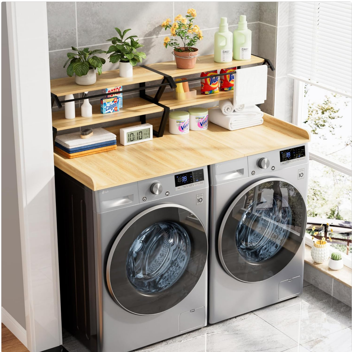
Figure 5: Example of an organized laundry space using the countertop and wall shelf.