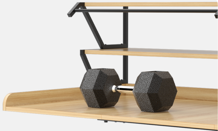
Figure 7: Rounded edge design for safety and protection.

Washing machine countertops can withstand weights up to 260 LB (118KG)