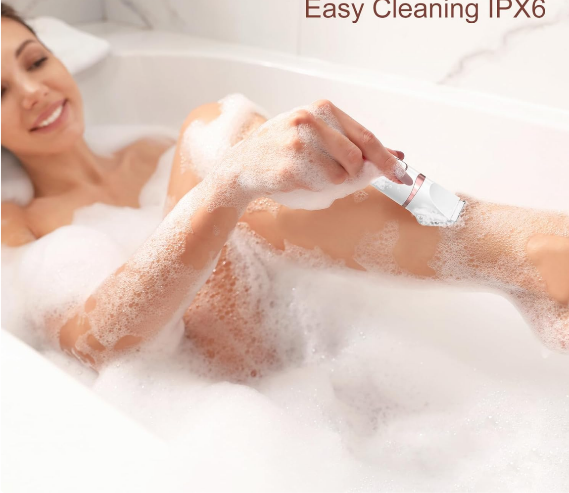
Image: A woman using the MAXGROOM electric shaver in a bubble bath, highlighting its waterproof design for convenient wet use.