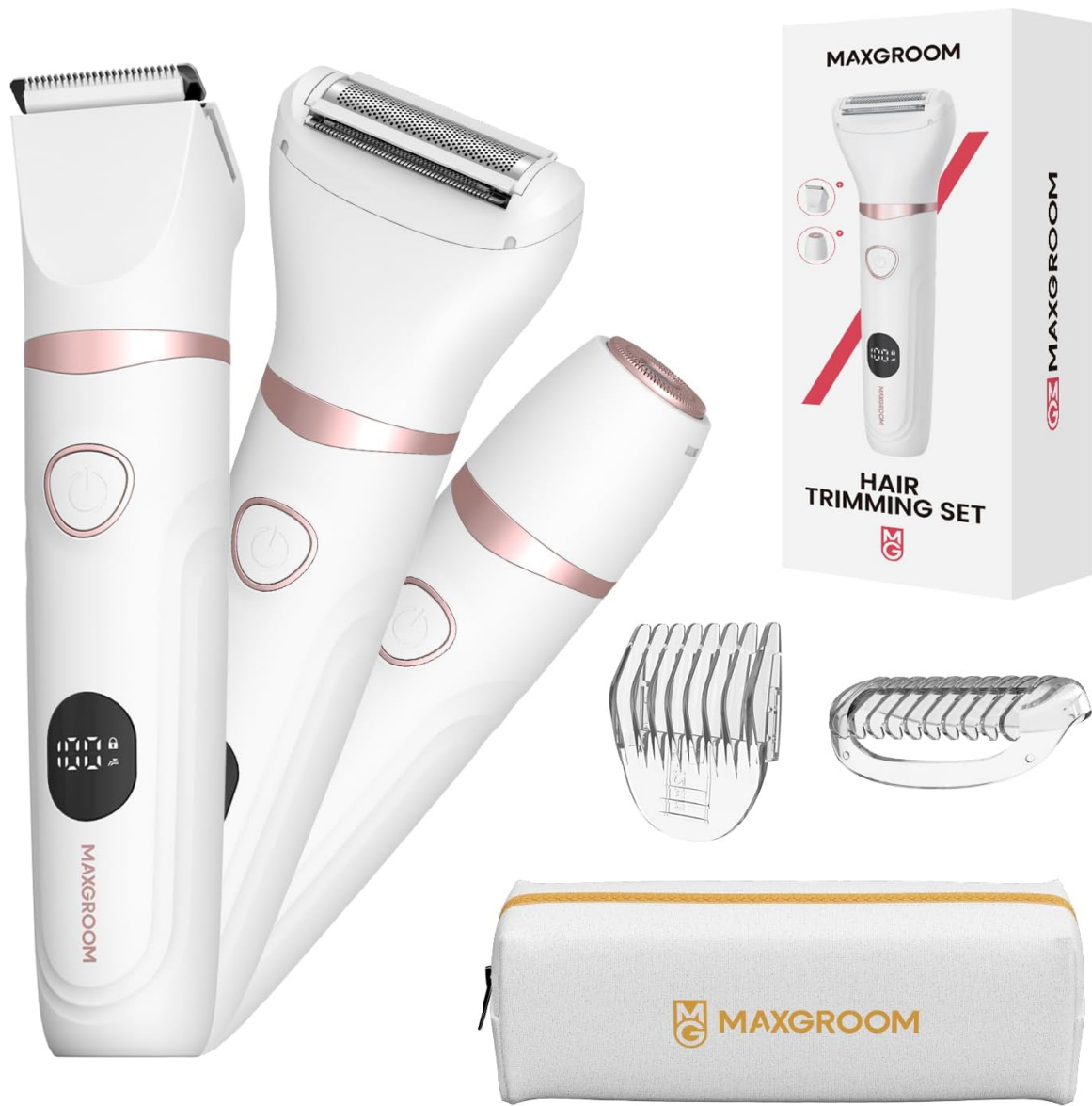
Image: MAXGROOM 3-in-1 Electric Shaver with all attachments and travel pouch, illustrating the complete grooming kit.