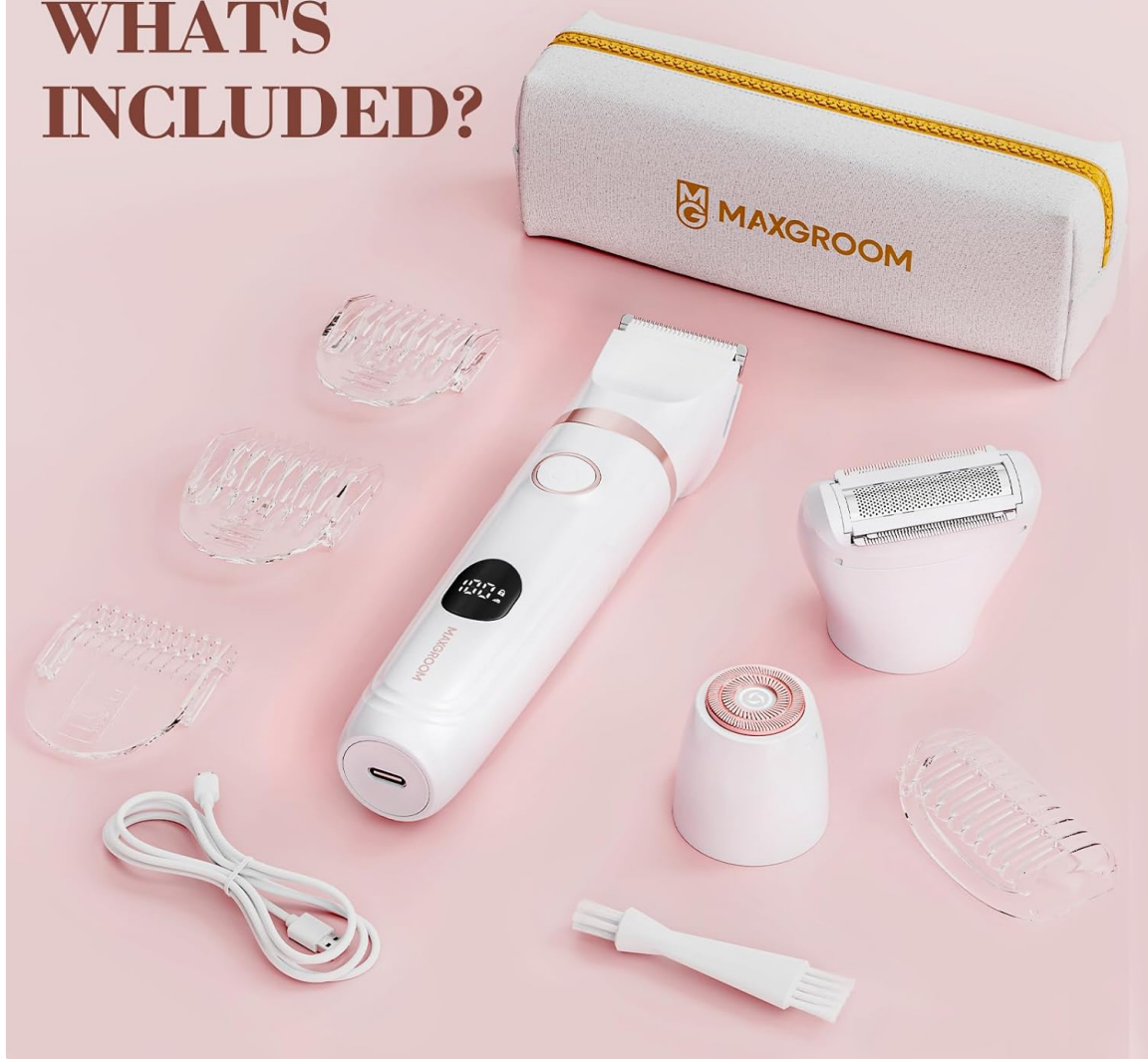
Image: All MAXGROOM trimmer components laid out, showing the main body, three interchangeable heads, guide combs, cleaning brush, USB-C cable, and travel pouch.