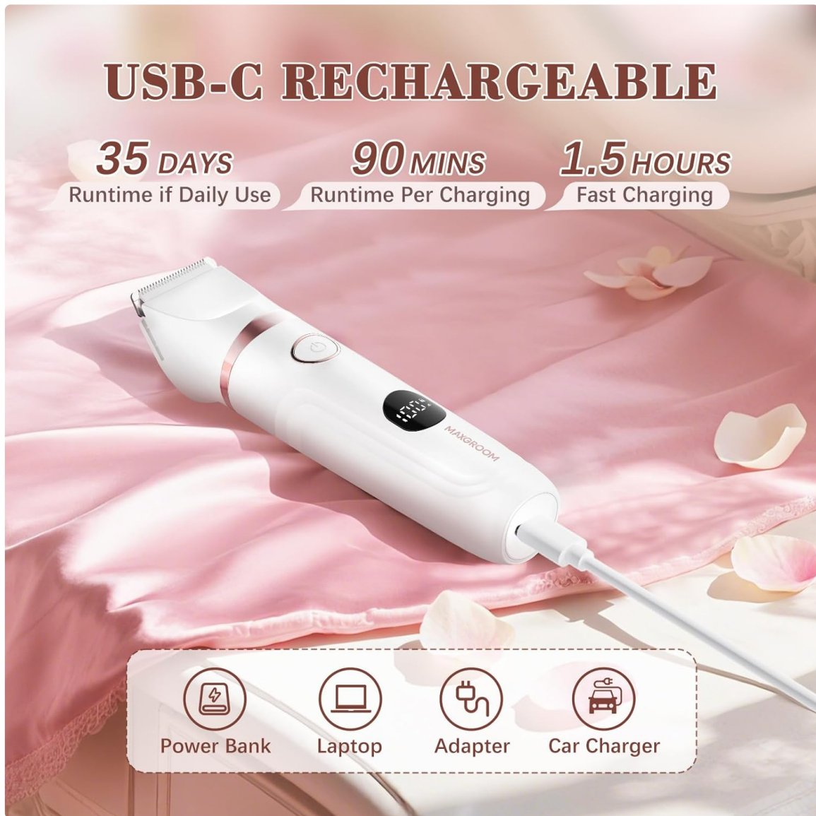
Image: The MAXGROOM trimmer connected to a USB-C charging cable, illustrating its rechargeable nature.

will show the battery level during charging. A full charge takes approximately 1.5 hours and provides up to 90 minutes of cordless runtime.