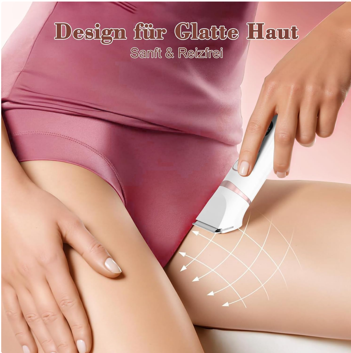
Image: A woman using the MAXGROOM bikini trimmer on her bikini line, demonstrating its targeted use.