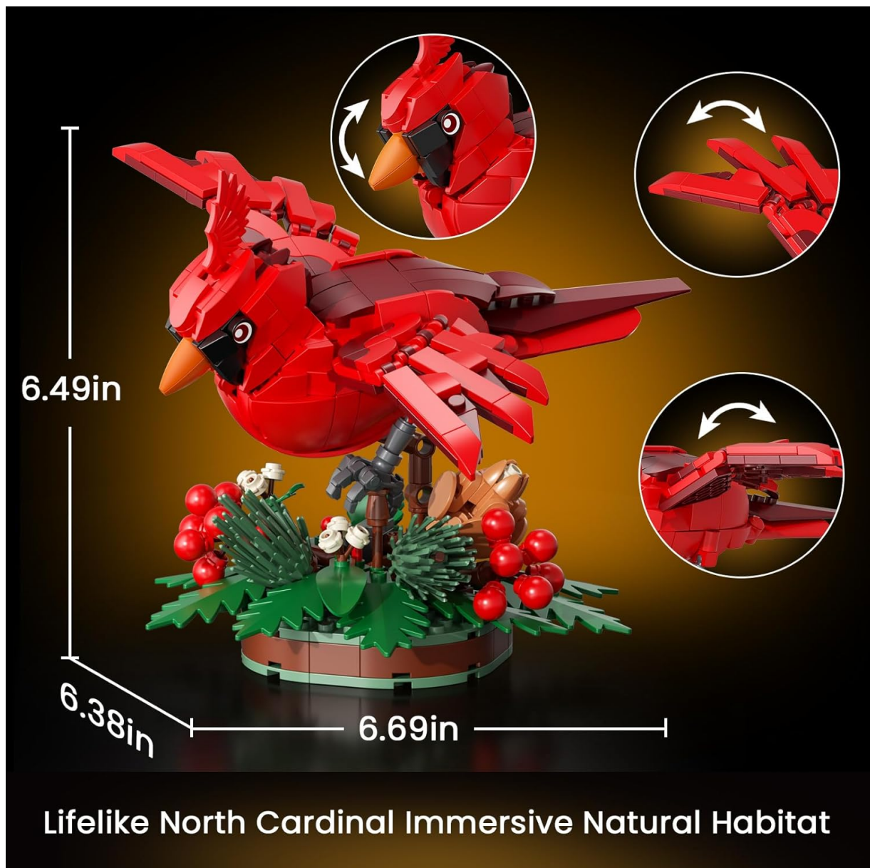
Image description: A close-up of the assembled holly plant base, featuring detailed green leaves, clusters of red berries, and small white flower elements.