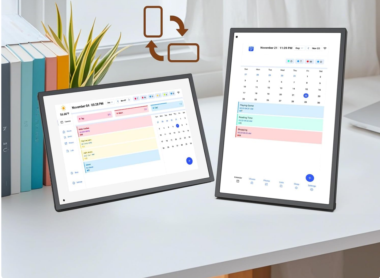
Image: The digital calendar displayed in both horizontal and vertical orientations, illustrating its auto-rotation capability for flexible placement on a tabletop.