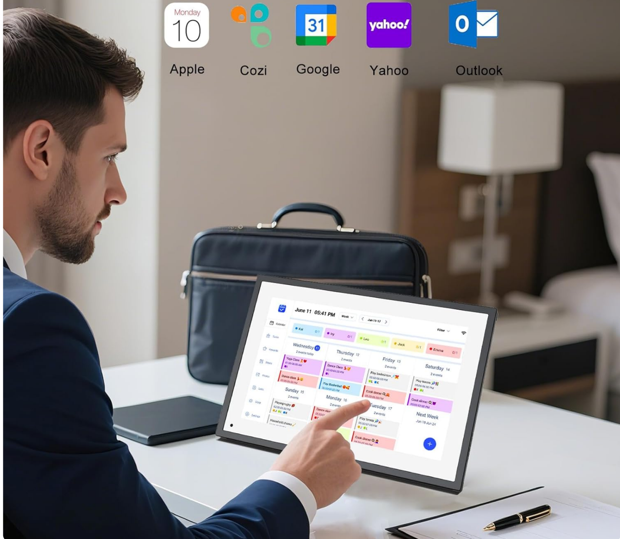
Image: The digital calendar screen displaying logos of various calendar services (Apple, Cozi, Google, Yahoo, Outlook), indicating its compatibility for seamless event synchronization.

The device is compatible with Google Calendar, iCloud Calendar, Outlook Calendar, Cozi, and Yahoo. Ensure your external calendar has the public sharing option enabled for proper synchronization.