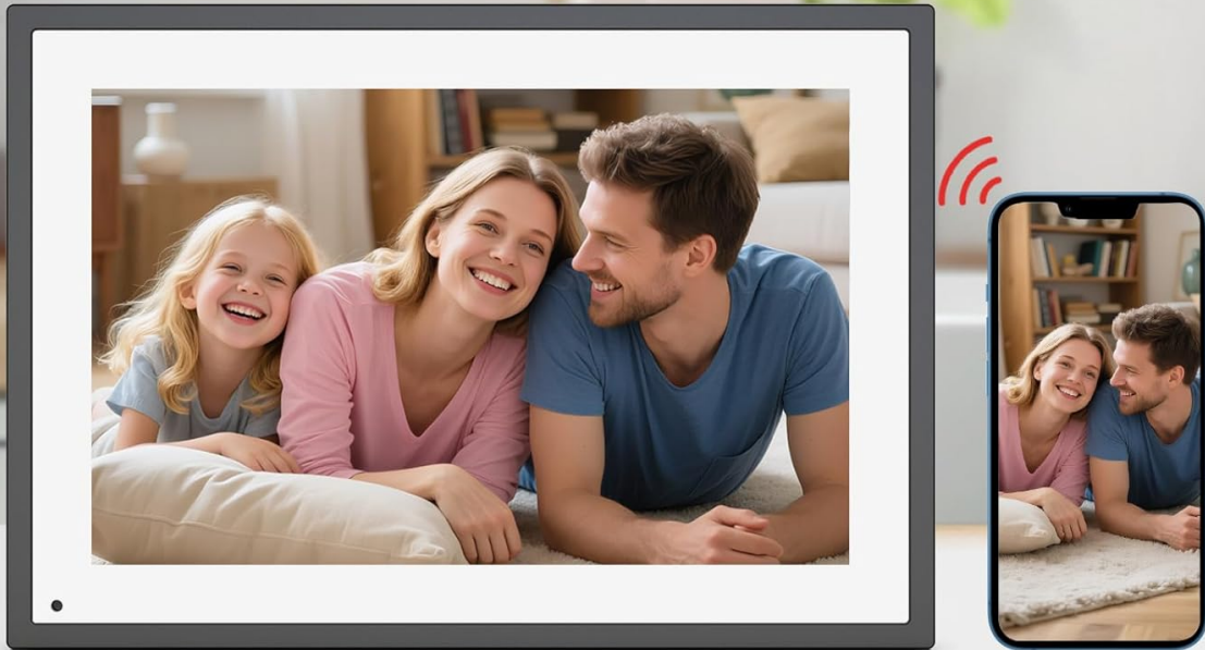
Image: The digital calendar functioning as a photo frame, displaying a family photo. A smartphone illustrates the process of sharing photos to the frame wirelessly.