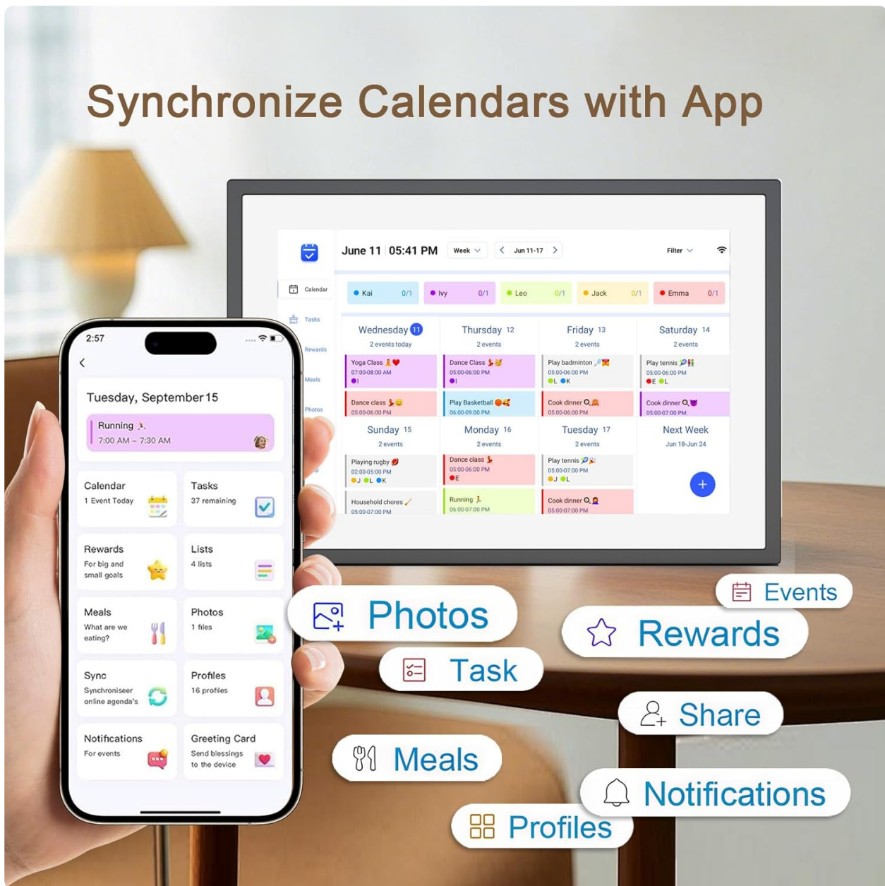
Image: The companion app interface, illustrating various features like calendar, tasks, rewards, meals, photos, and lists, all accessible from your smartphone.

Your browser does not support the video tag.