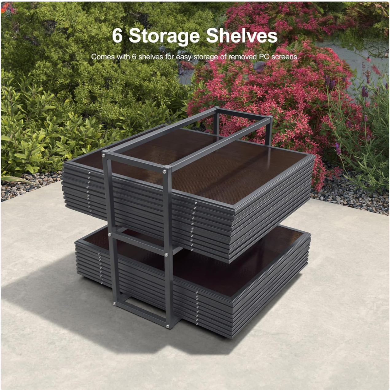
Figure 4.2: Dedicated storage shelves for removable PC screens.

Comes with 6 shelves for easy storage of removed PC screens.