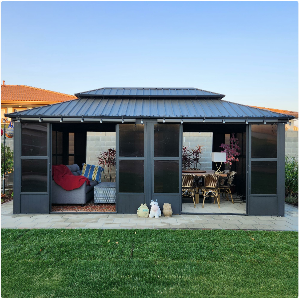
Figure 2.1: The PURPLE LEAF 12' x 20' Solarium Permanent Hardtop Gazebo.