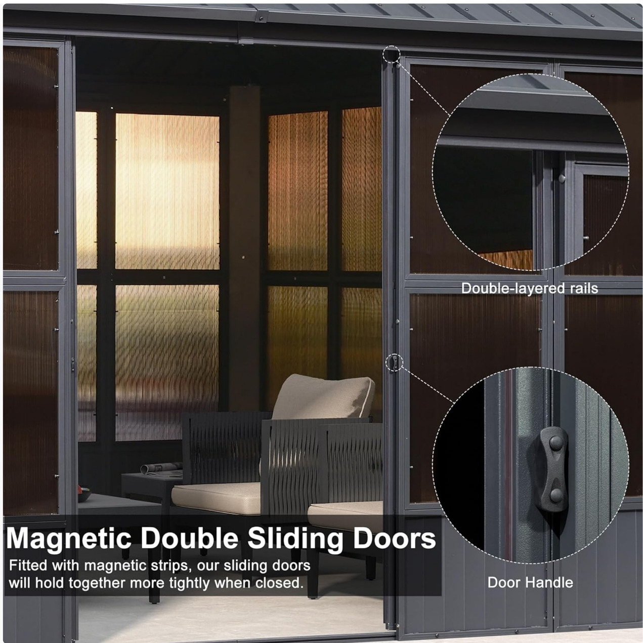
Figure 2.2: Magnetic Double Sliding Doors for easy access.