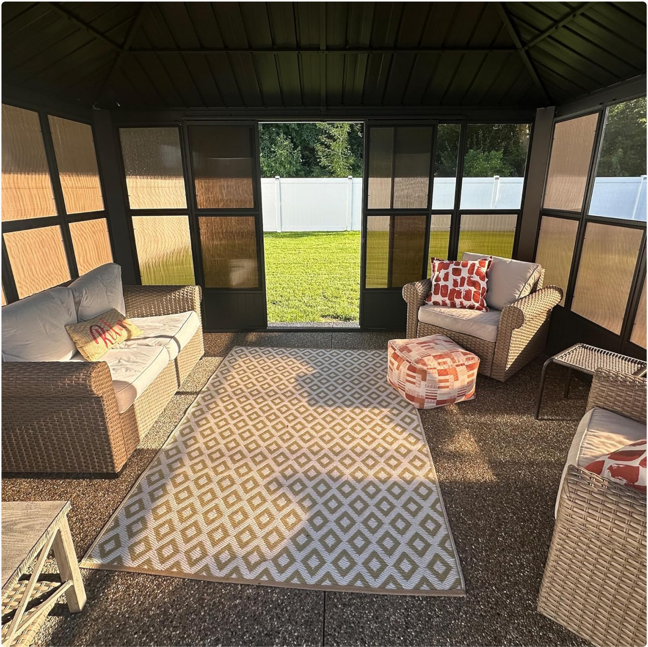
Figure 4.1: Interior view showing the sliding doors open.