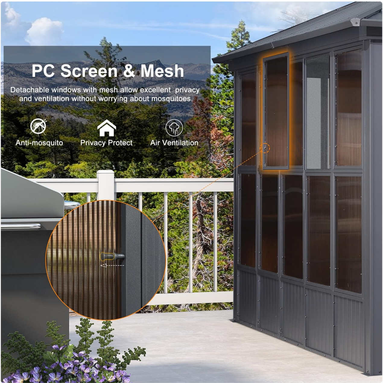
Figure 2.3: PC Screen and Mesh for privacy and air circulation.