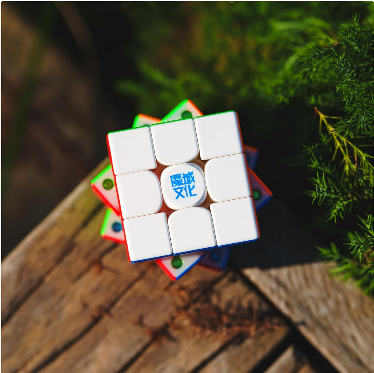
Image: The Moyo Weilong V11 2025 3x3 Speed Cube, showcasing its vibrant colors and matte finish.