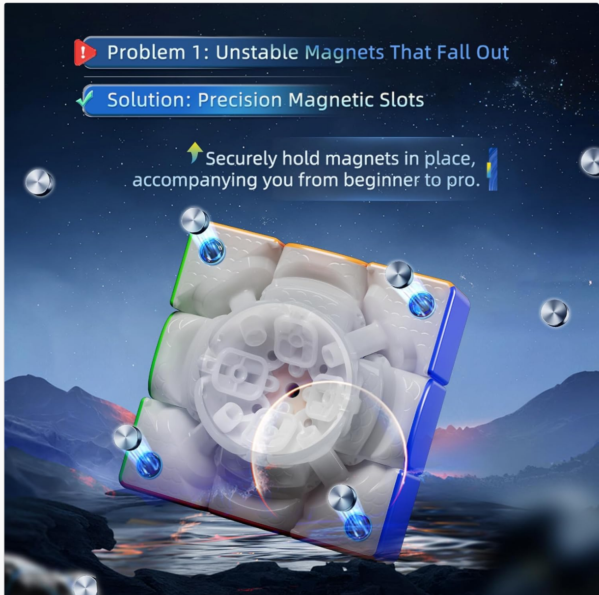
Image: An internal view highlighting the precision magnetic slots designed to prevent magnets from dislodging.

Equipped with 48 magnets, this version of the Weilong V11 utilizes upgraded crystal magnetic capsules. These capsules securely hold the magnets in place, enhancing stability and providing a consistent magnetic feel during solves.