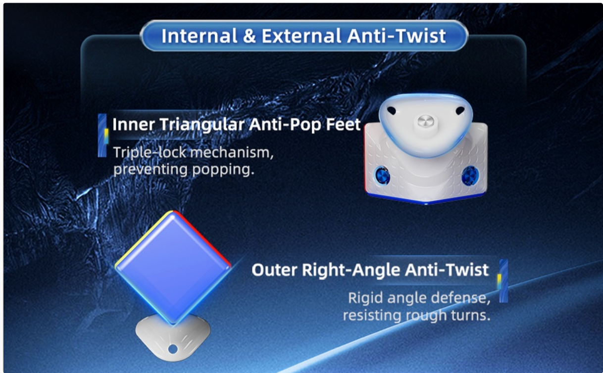
Image: Detailed view of the internal and external anti-twist components, including inner triangular anti-pop feet and outer right-angle anti-twist design.