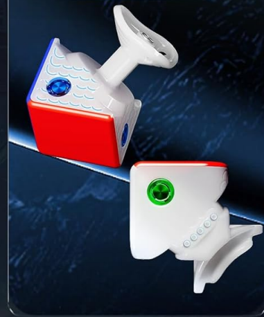
Image: Visual representation of the cube's seamless structure, internal and external anti-twist mechanisms, and dual anti-stick design.