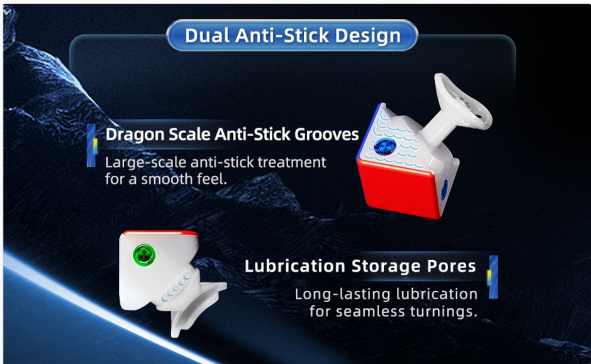
Image: Illustration of the dual anti-stick design, highlighting the dragon scale anti-stick grooves and lubrication storage pores for enhanced smoothness.

The cube incorporates Dragon Scale Anti-Stick Grooves for a large-scale anti-stick treatment, ensuring a smooth feel. Additionally, lubrication storage pores are integrated for long-lasting lubrication and seamless turning.