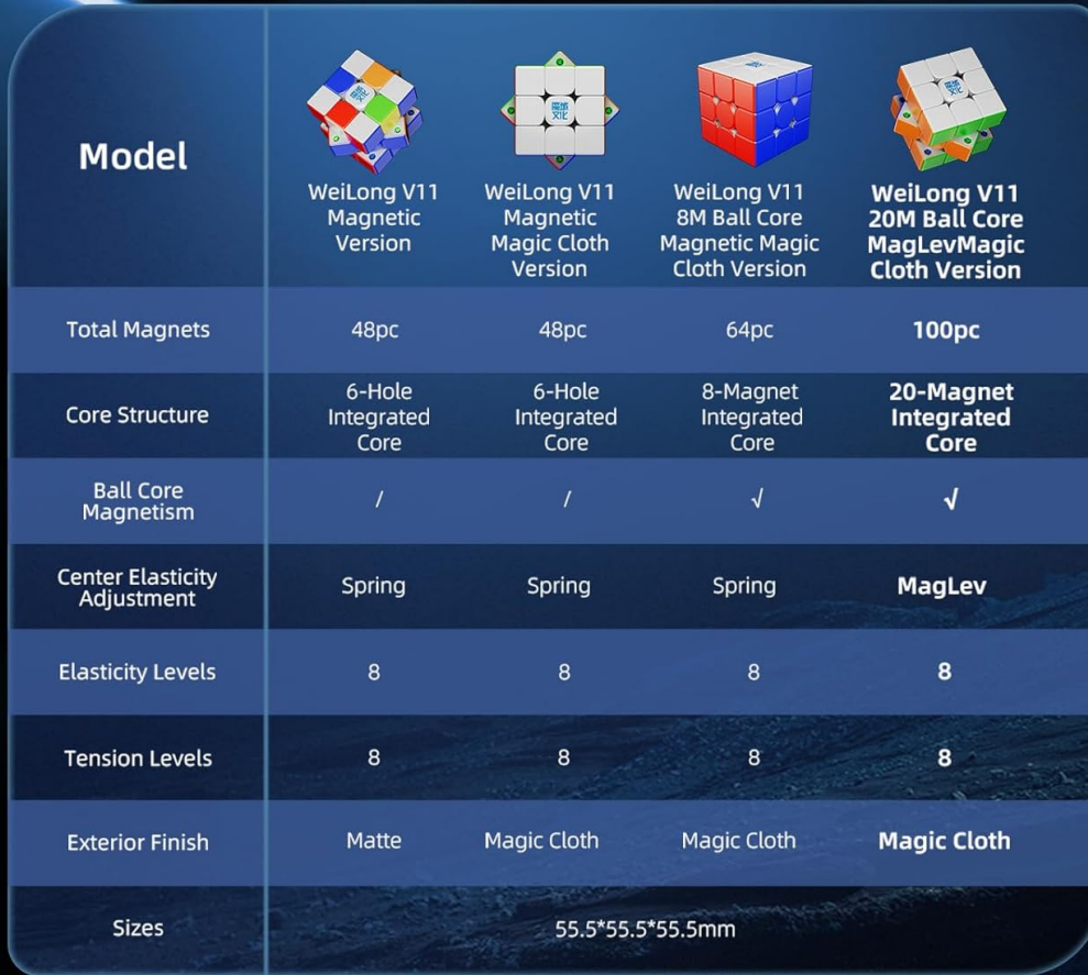
Image: A table comparing specifications across different Moyu Weilong V11 models, including magnet count, core structure, and adjustment types.