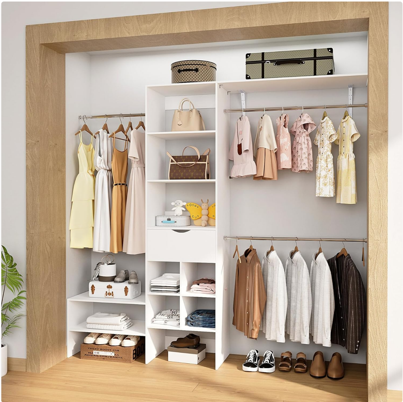
Image 1.1: The Sannwsg 8ft Closet System with Drawers, showcasing its storage capabilities with hanging rods, shelves, and drawers.