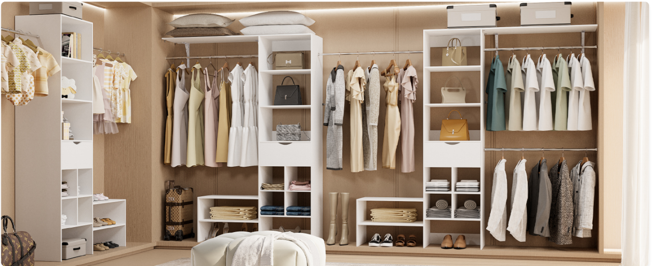
Image 4.1: Various installation options demonstrating the system's adaptability to different closet sizes and layouts.

This customizable system offers over 6 installation options to suit various space requirements, from 3ft to 8ft wide wardrobes. Review the different configurations to choose the best fit for your needs before starting assembly.