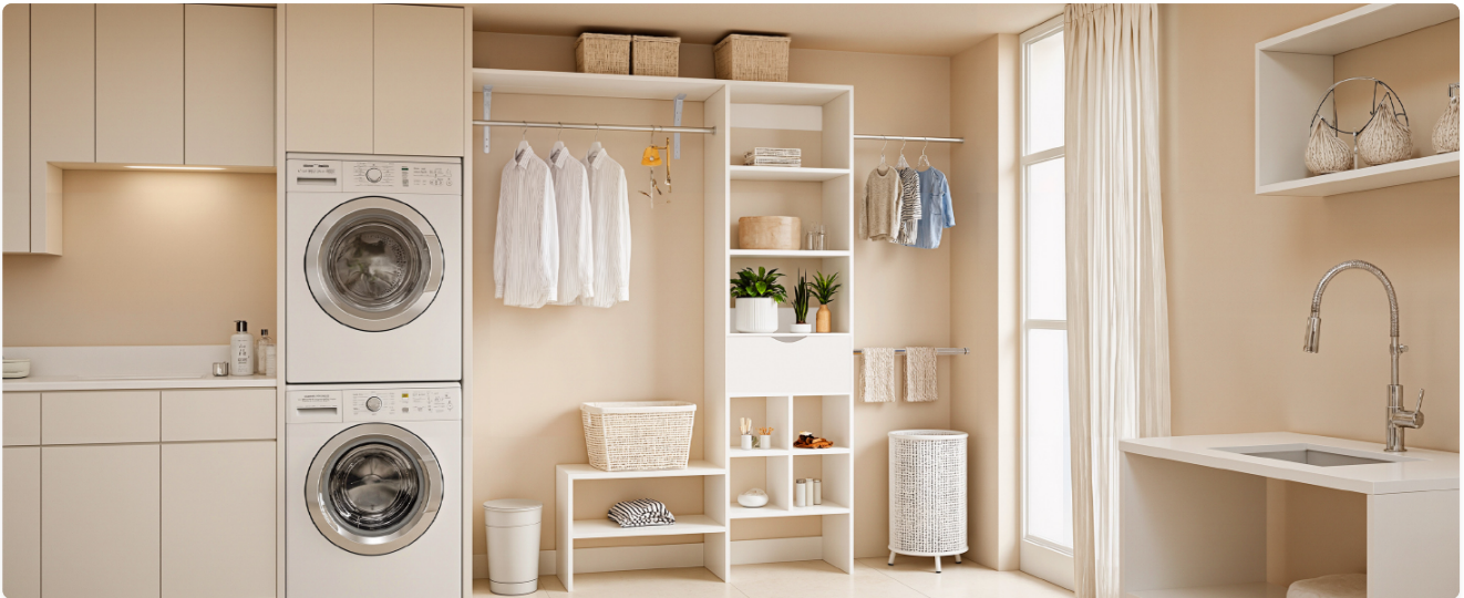
Image 5.1: Detailed view of key features including the large wooden drawer, versatile cube storage, and adjustable shelves.