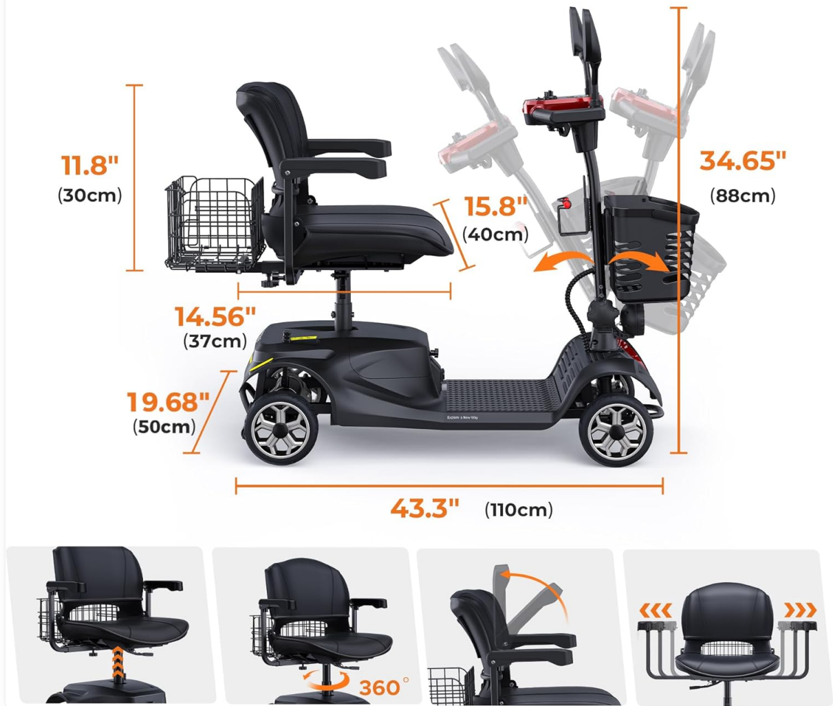
Figure 1: Adjustable seat and dimensions of the ENGWE ease3 mobility scooter.