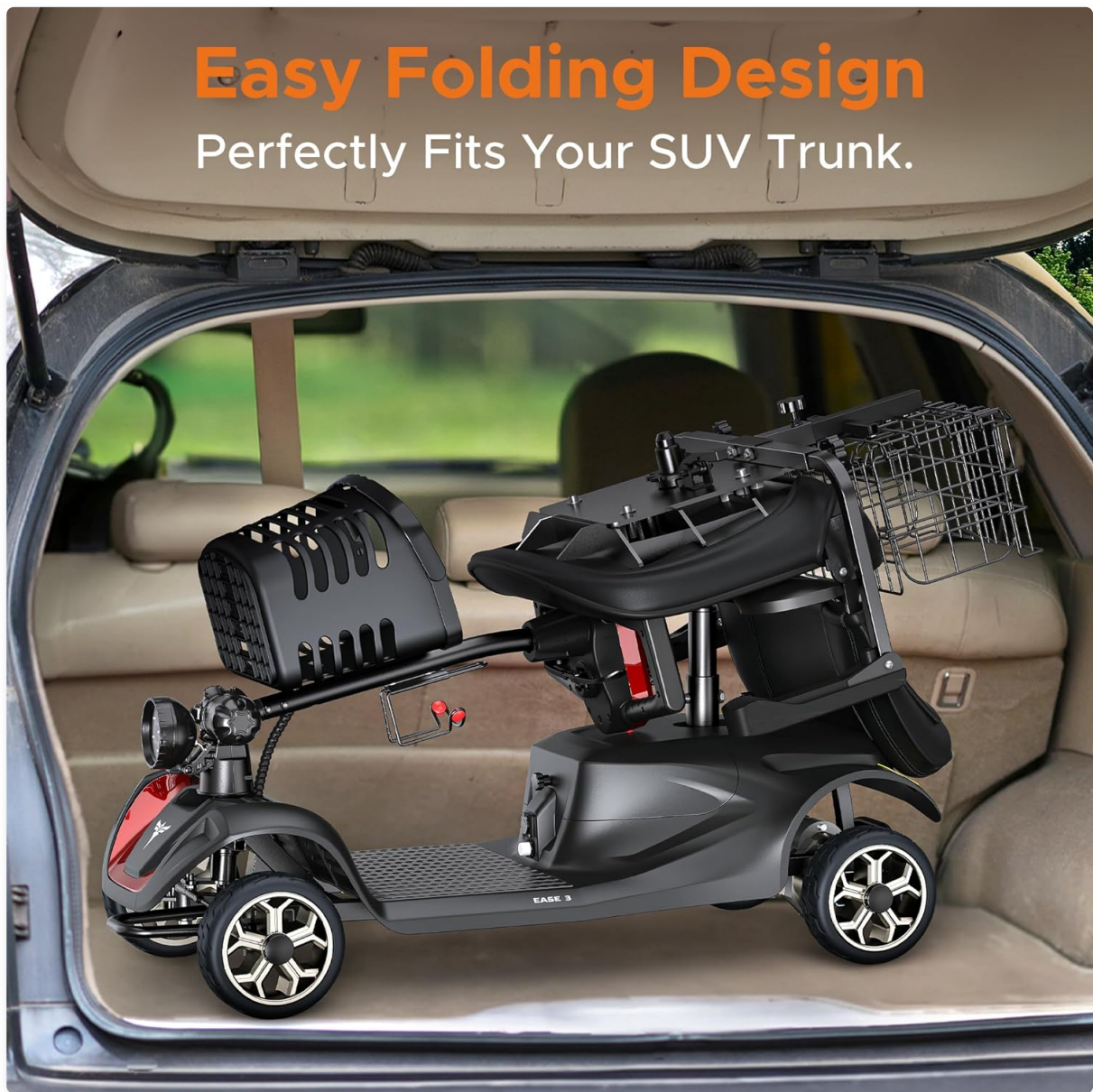
Figure 6: Easy folding design for convenient storage and transport.