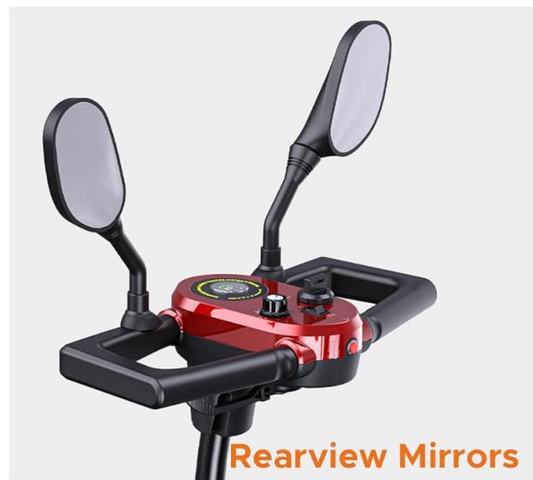
Figure 2: Various accessories for the ENGWE ease3 mobility scooter.