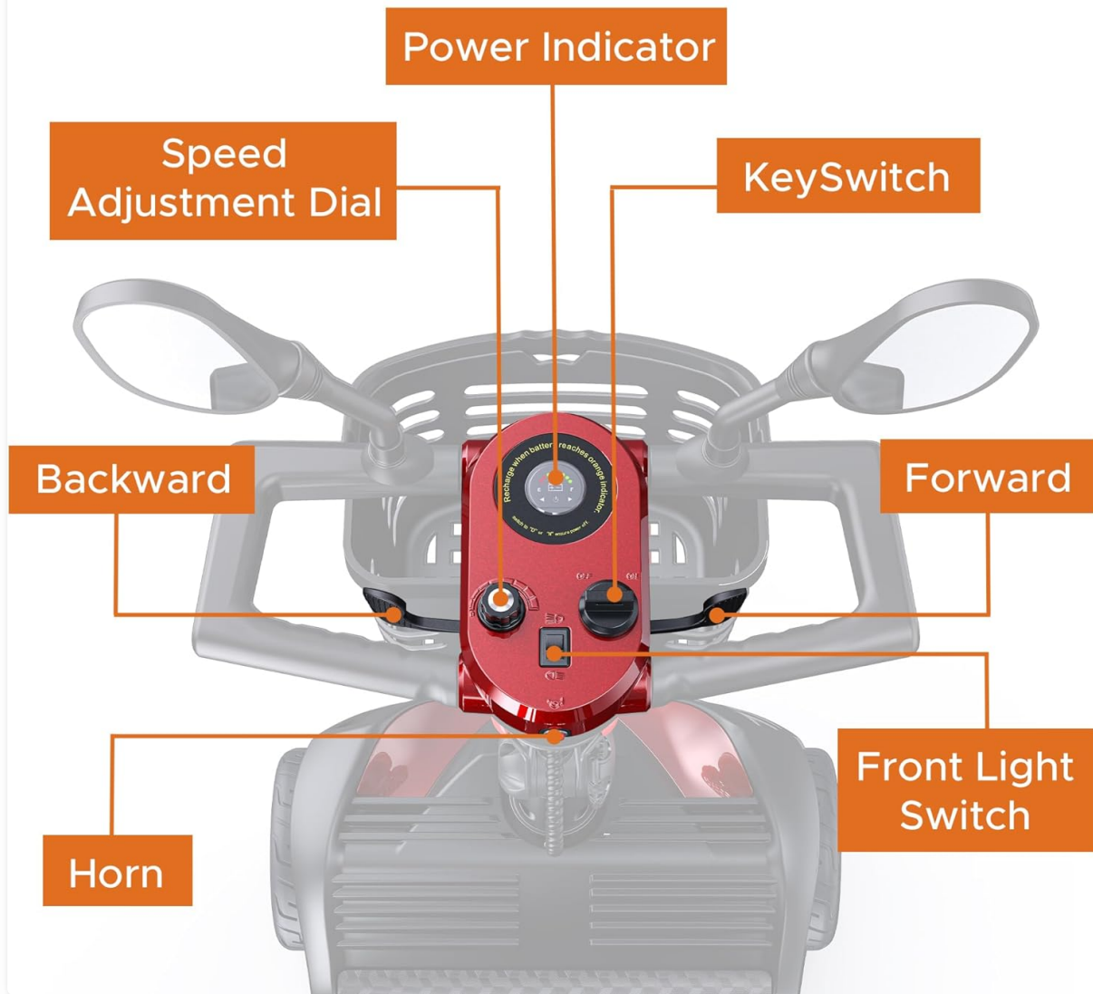
Figure 3: U-shaped easy control panel.