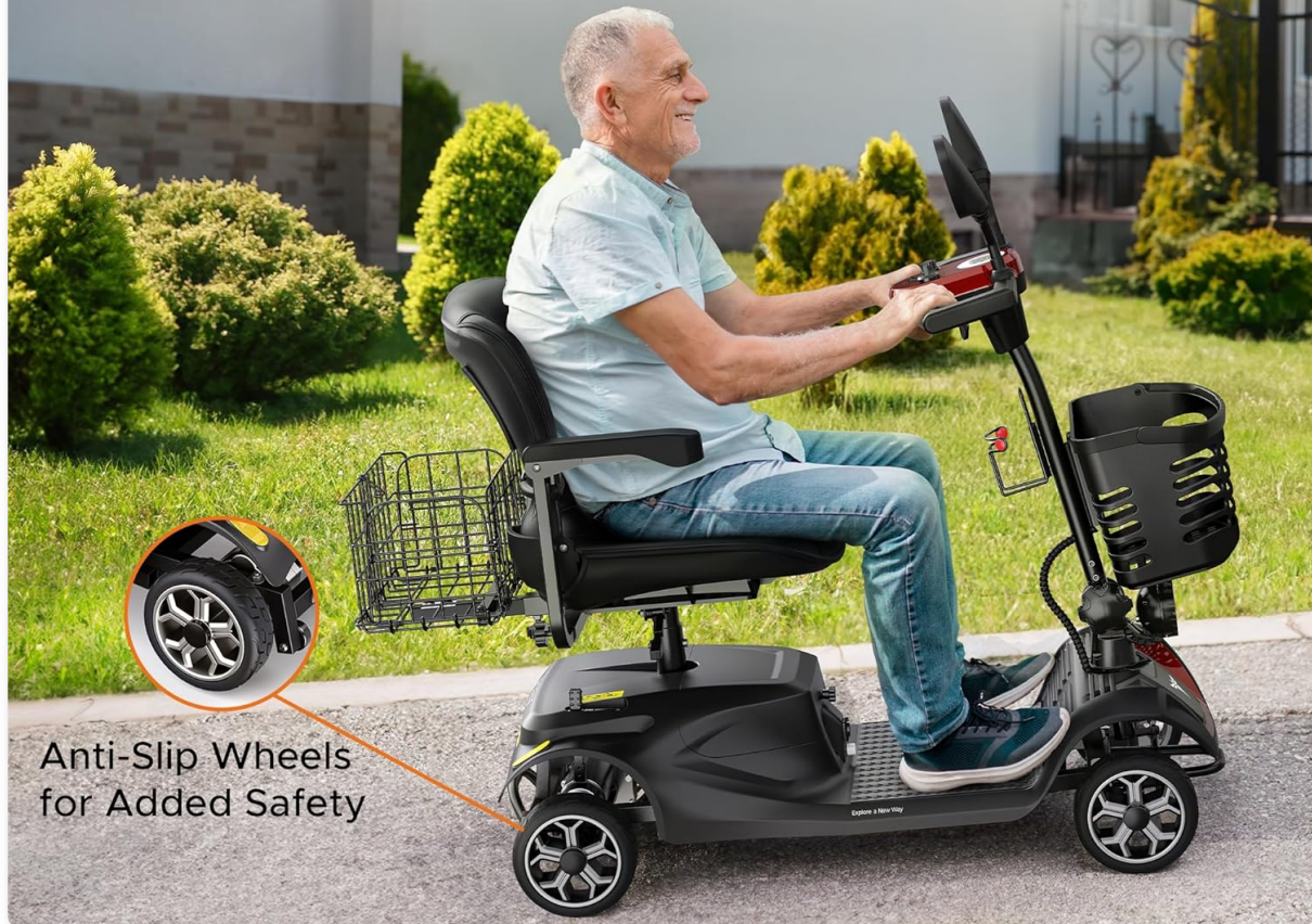
Figure 5: ENGWE ease3 in use, highlighting key features.