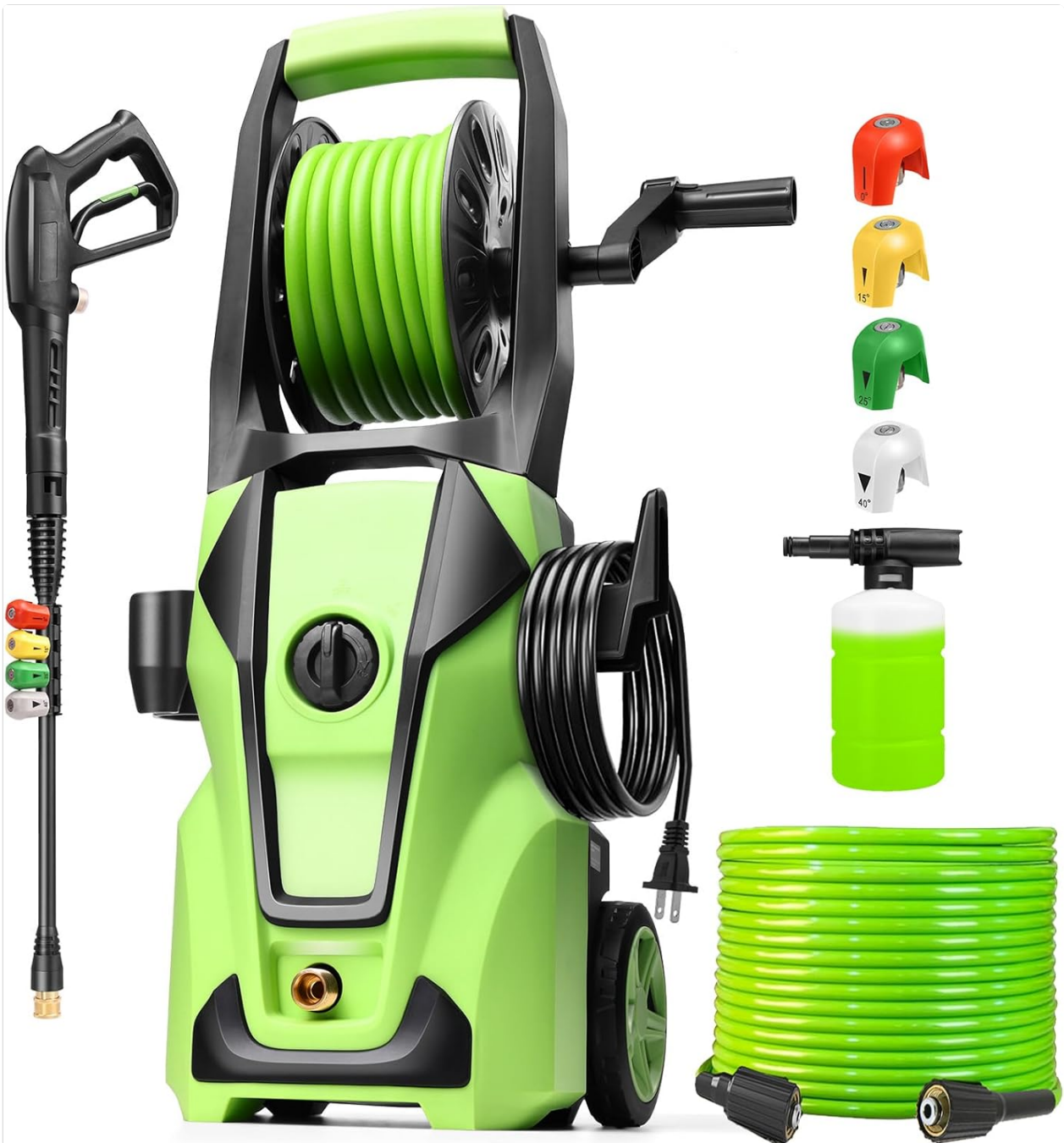
Figure 1: Commowner Electric Pressure Washer CMM4000-2313021 with included accessories, including the main unit, spray gun, hose reel, power cord, various nozzles, and foam cannon.