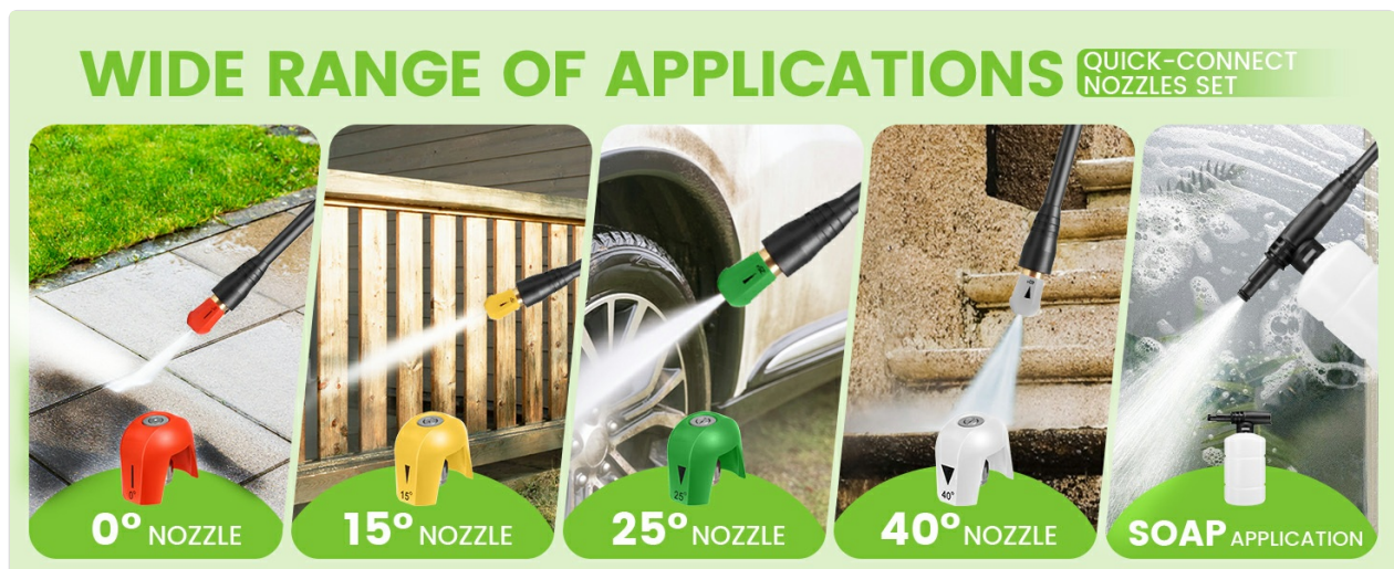
Figure 3: Quick-connect nozzles and their spray patterns for various cleaning applications.