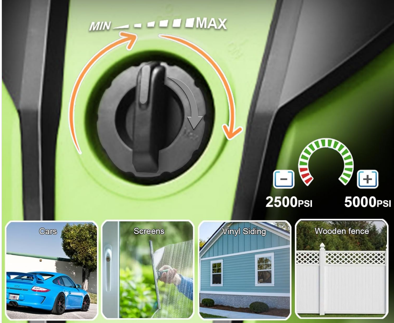
Figure 4: Adjustable pressure dial for customizing cleaning intensity.

Tough on Dirt, Gentle on Surfaces – Even Your Luxury Car!