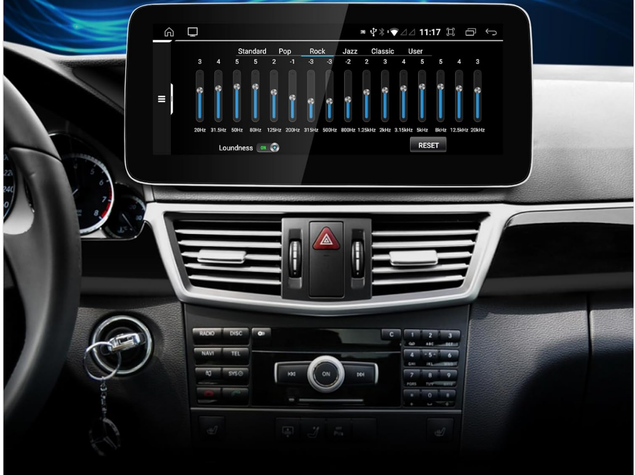
Image: This image shows the DSP interface on the screen, featuring a graphic equalizer that allows users to fine-tune audio frequencies for a personalized sound experience.