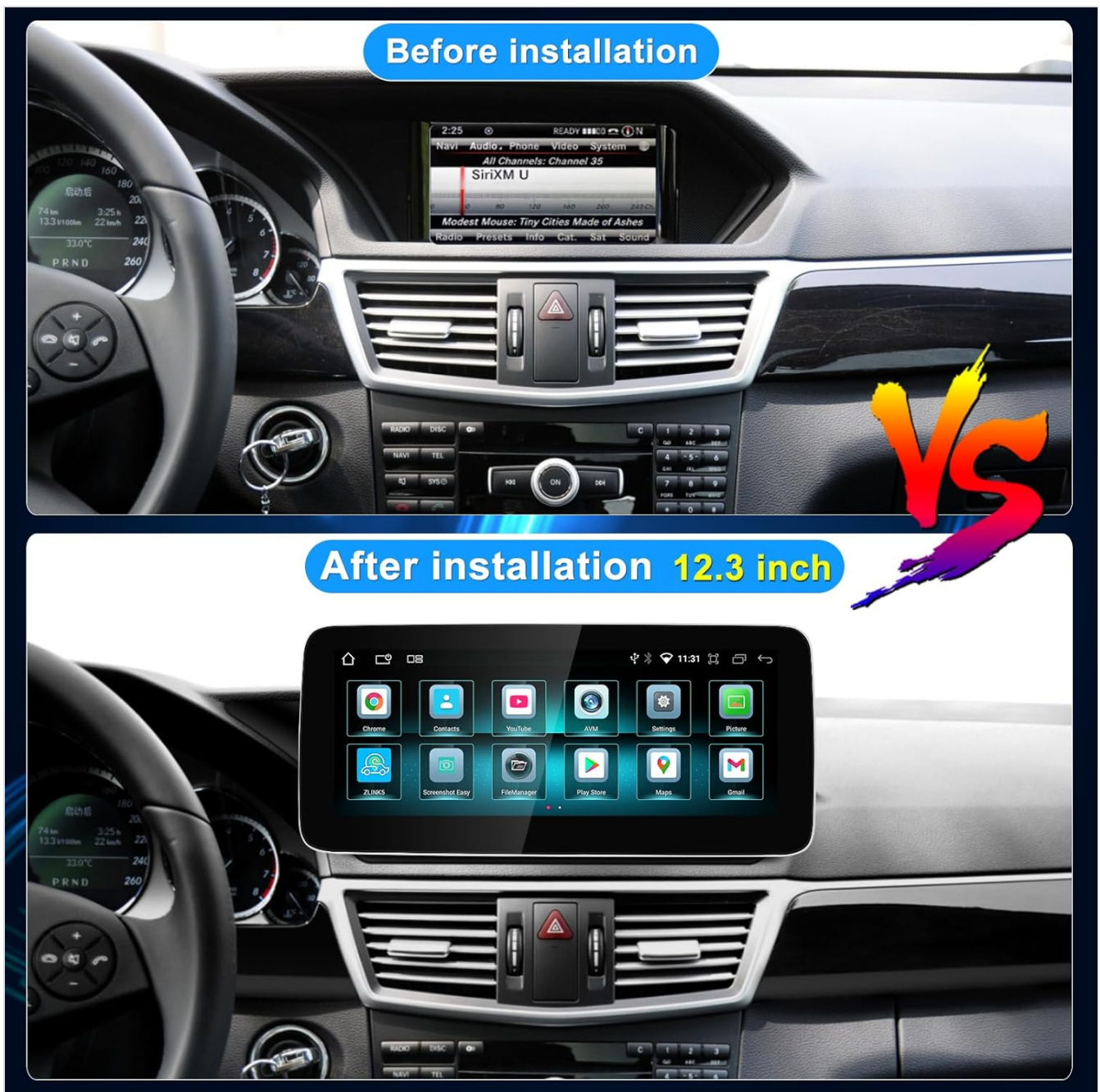
Image: This image provides a visual comparison of the car's dashboard before and after the installation of the 12.3-inch CarPlay screen, demonstrating the size and interface upgrade.

Note: Most installation issues arise from incorrect cable connections or settings. Refer to the dedicated installation instruction document for detailed, step-by-step guidance. Contact customer support if you encounter any difficulties.