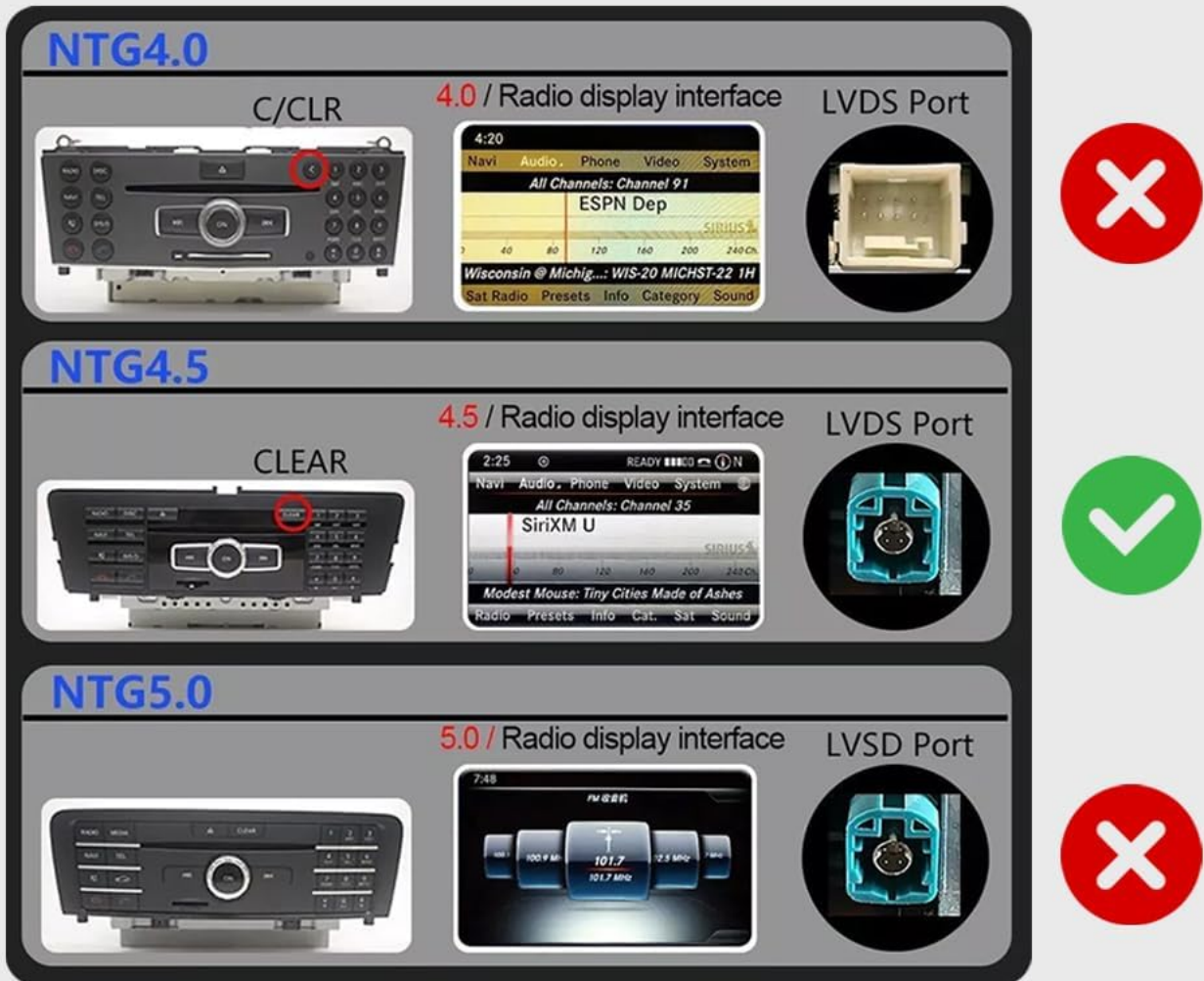
Image: This image illustrates the visual differences between the NTG 4.0, NTG 4.5, and NTG 5.0 systems, highlighting the radio display interface and the LVDS port for each. The NTG 4.5 system is marked with a green checkmark, indicating compatibility.

Please Refer to The Picture To Buy the Correct System.