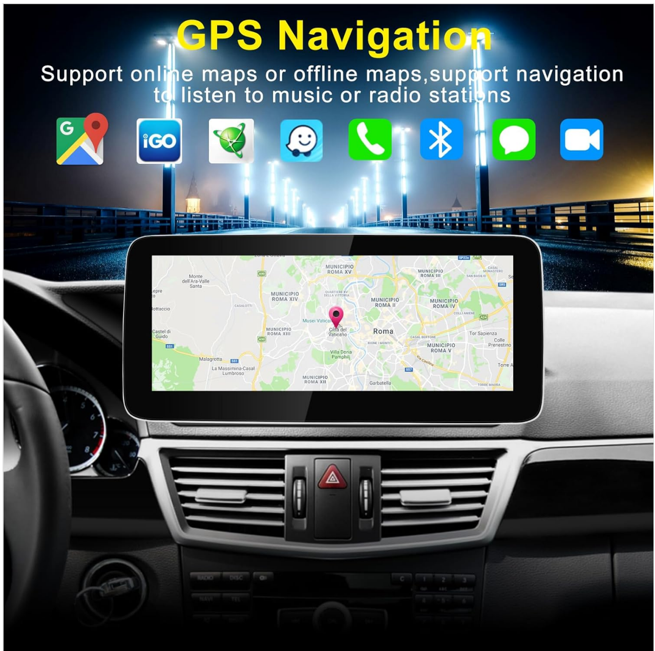
Image: The screen displays a map interface, demonstrating the GPS navigation capability. Icons for popular navigation and communication applications are visible at the top.