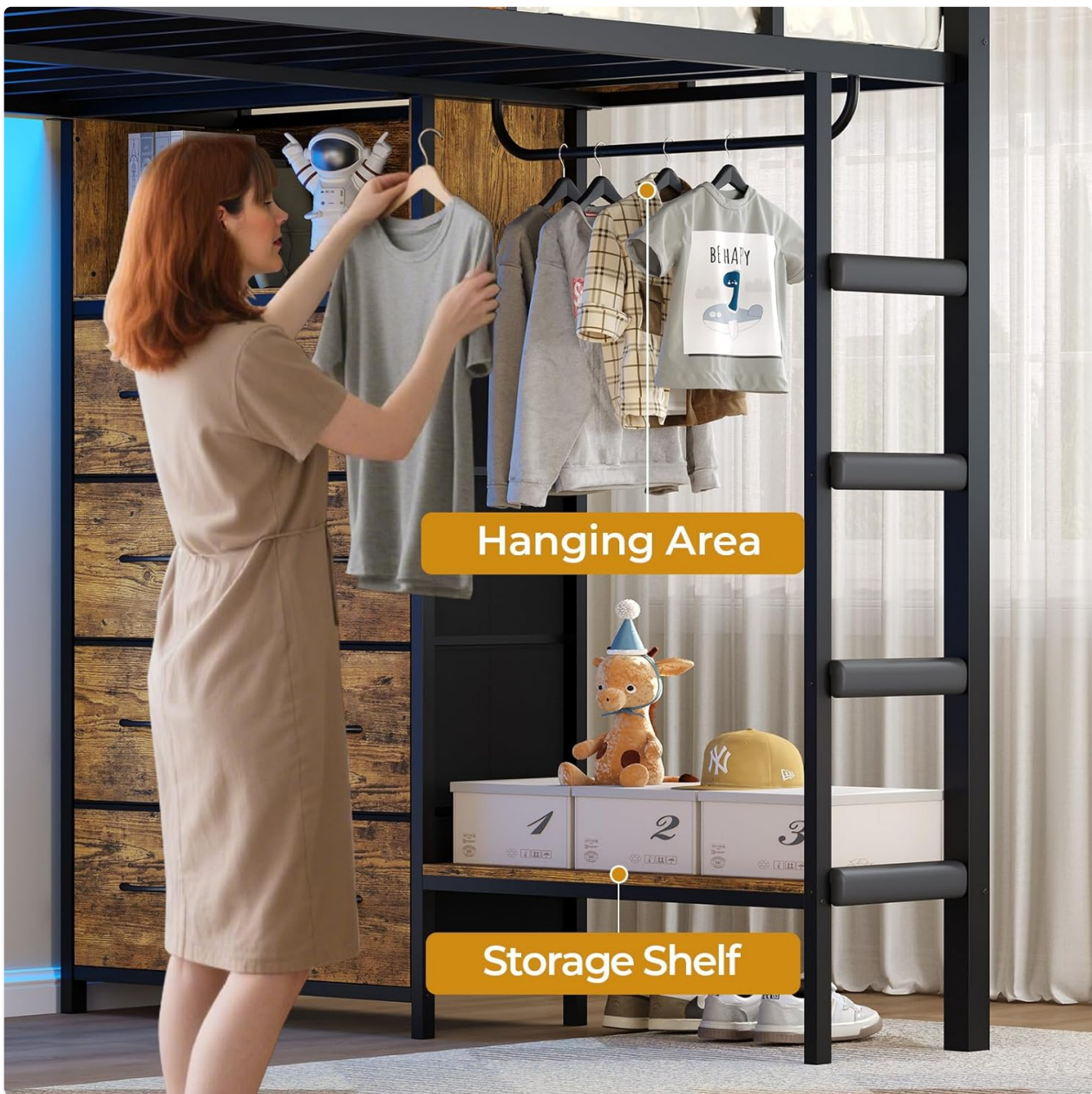
Image 7: The hanging area and open storage shelf, demonstrating their utility.