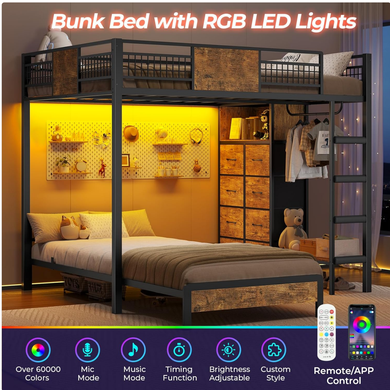
Image 5: The bunk bed illuminated by RGB LED lights, showing remote and app control options.