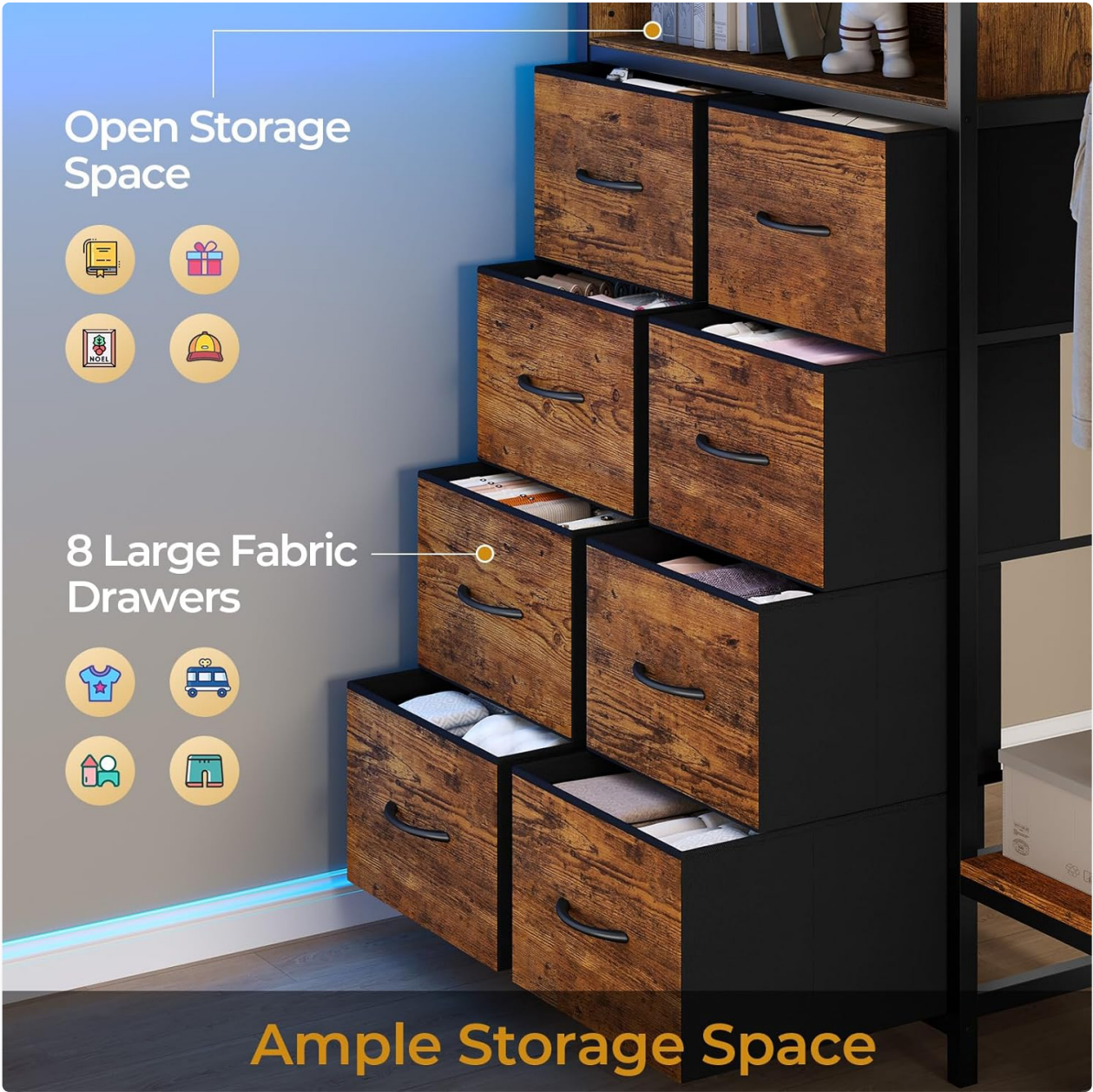
Image 6: Detailed view of the eight large fabric drawers, providing ample storage.