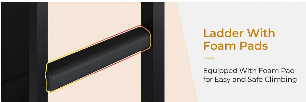
Image 2: Details of the bed's safety features, including the anti-tipping device and foam-padded ladder.