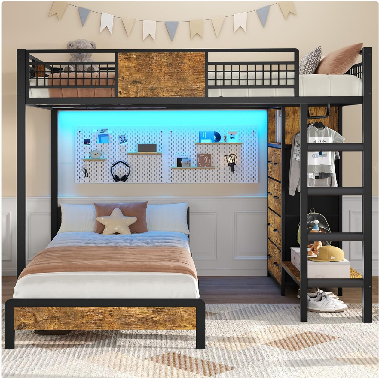
Image 1: The ADORNEVE Full Over Twin Bunk Bed, showcasing its integrated LED lights, storage drawers, and shelves.

Key features include a robust metal frame, a 13.4-inch high safety guardrail for the upper bunk, and a ladder with foam pads for comfortable climbing. The bed also incorporates an anti-tipping device for added stability.