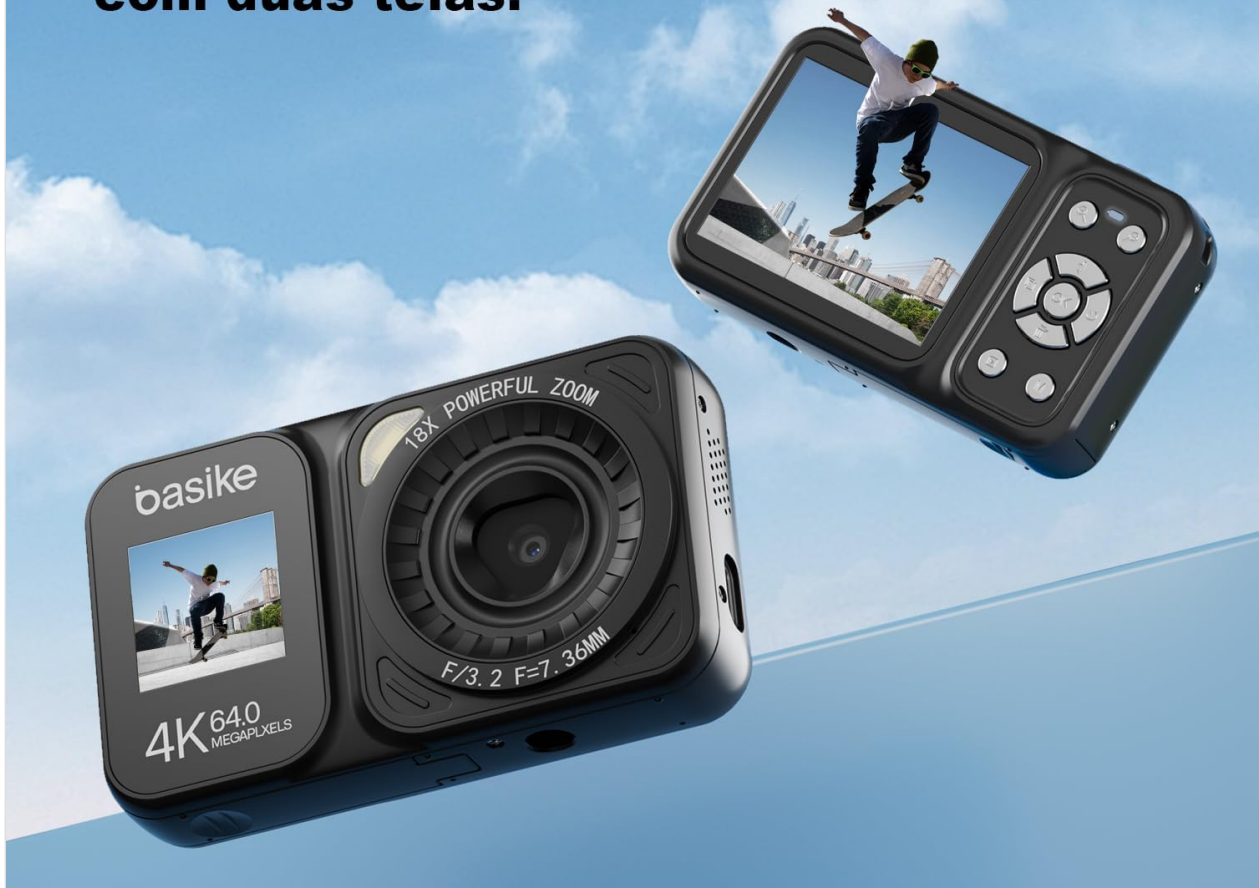
Image 4.2: The camera's dual display in action, facilitating perfect selfies and video recording.

Crie fotos e vídeos impecáveis com duas telas!