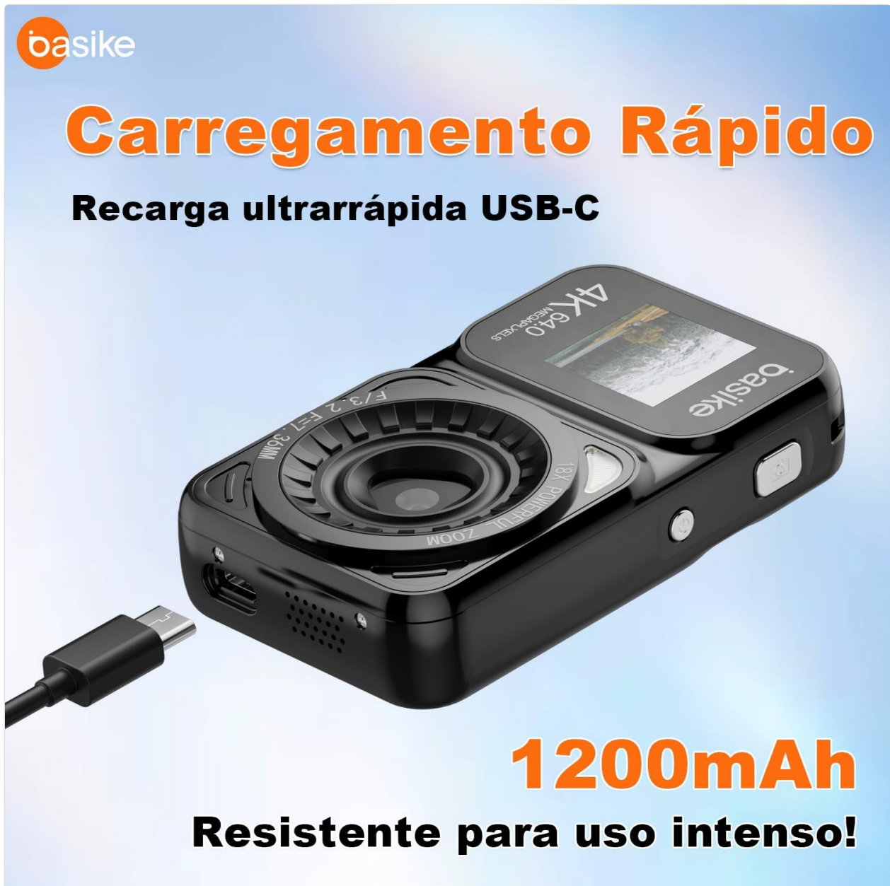
Image 3.1: The camera connected to a USB-C cable for fast charging.