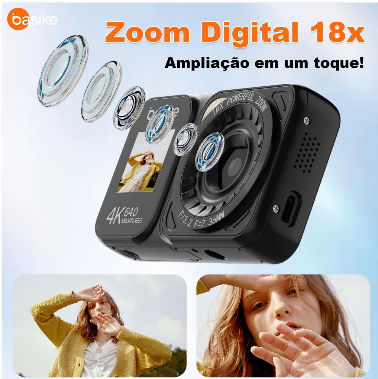
Image 4.1: Illustration of the 18x digital zoom capability, showing how to magnify subjects.