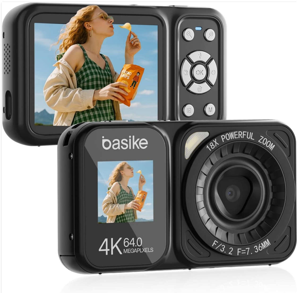
Image 1.1: Front and back view of the Basike Ba-CAM215 Digital Camera, showcasing its compact design and dual screens.