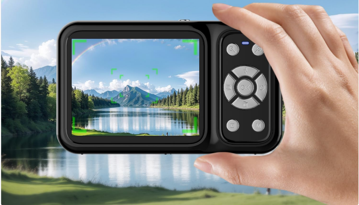
Image 2.1: The camera highlights its 64 Megapixel capability for exceptional photo quality.