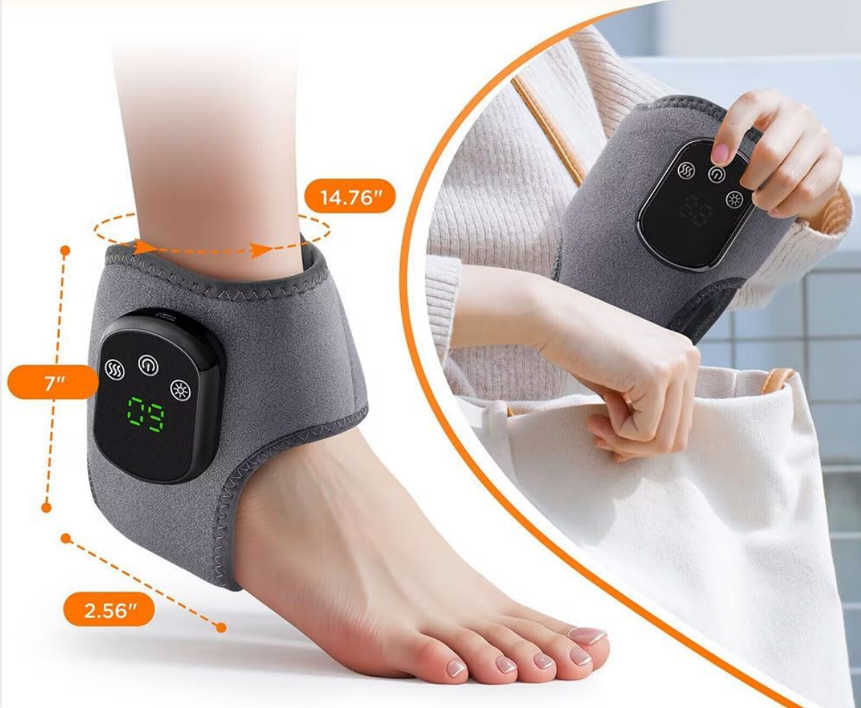
Figure 4: Portable Design and Dimensions. This image illustrates the compact size of the massager, showing it worn on an ankle with key dimensions (height, ankle circumference, foot width) and a person easily carrying it, highlighting its portability for outdoor, office, or travel use.