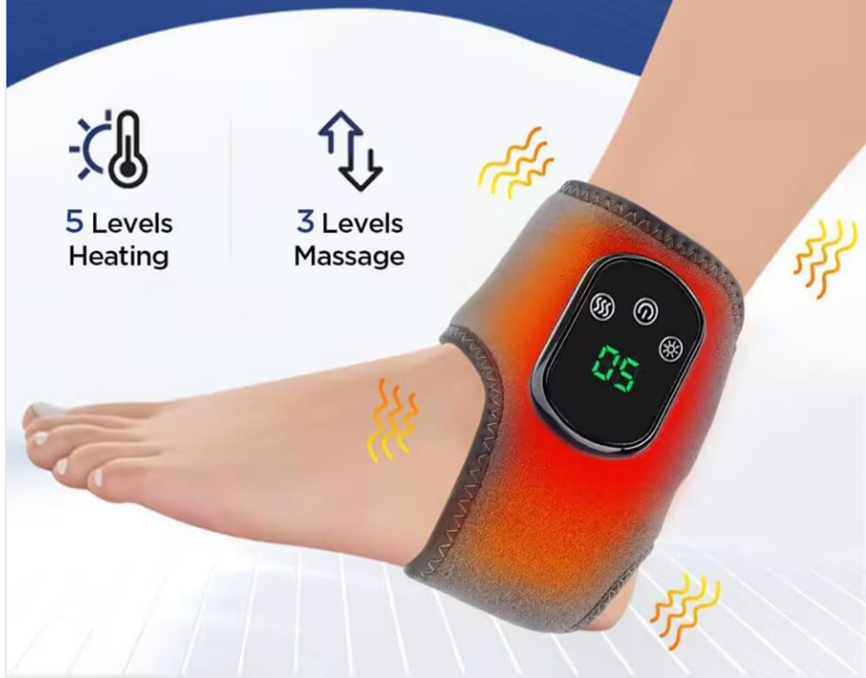
Figure 8: Multi-Gear Adjustment. This graphic illustrates the product's capability for multi-gear adjustment, featuring icons representing 5 levels of heating and 3 levels of massage, promising a relaxing experience from shallow to deep.

Experience a relaxing state from shallow to deep