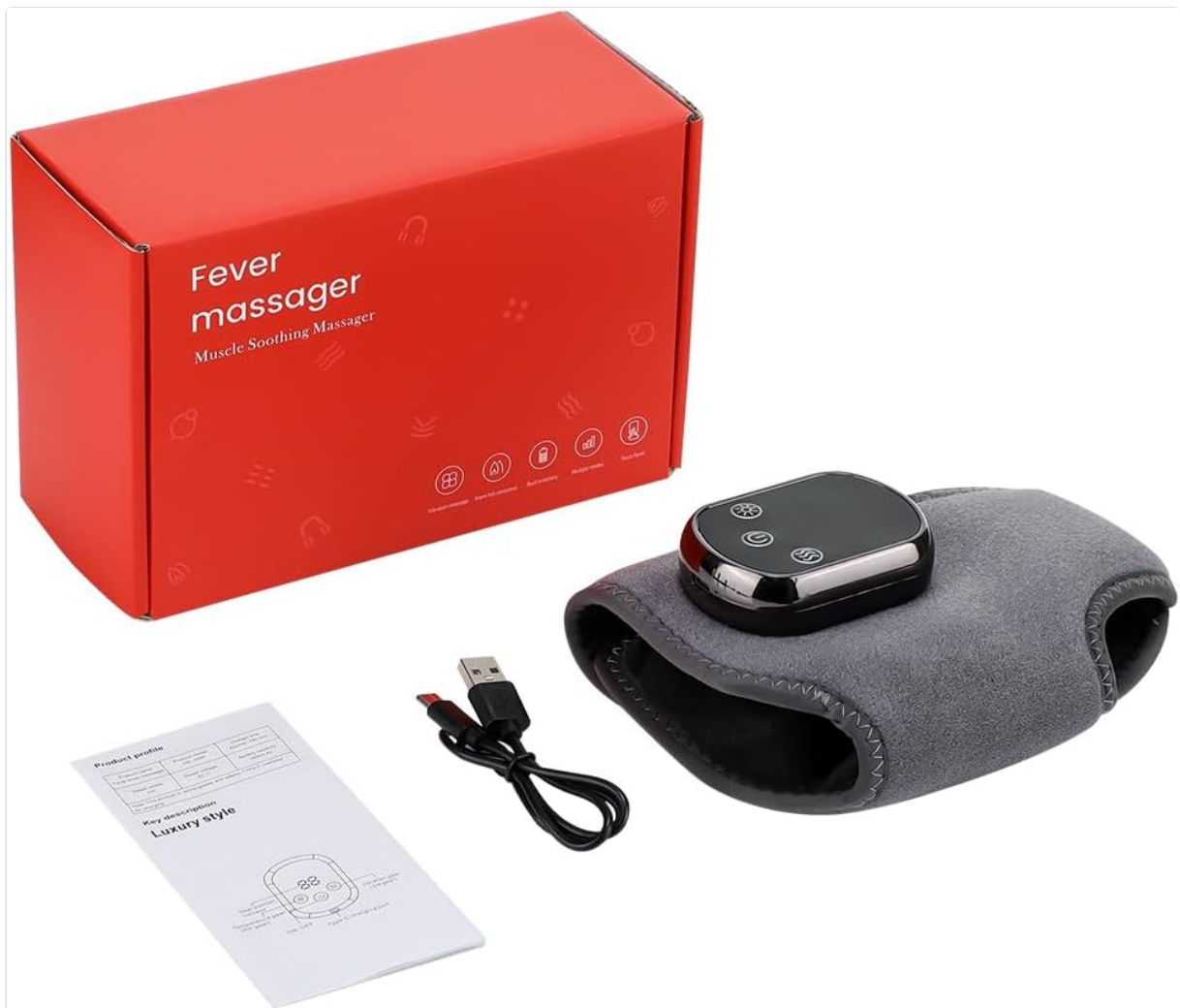
Figure 1: Package Contents. The image displays the ankle massager, its user manual, and a Type-C charging cable, alongside the product's red packaging box.