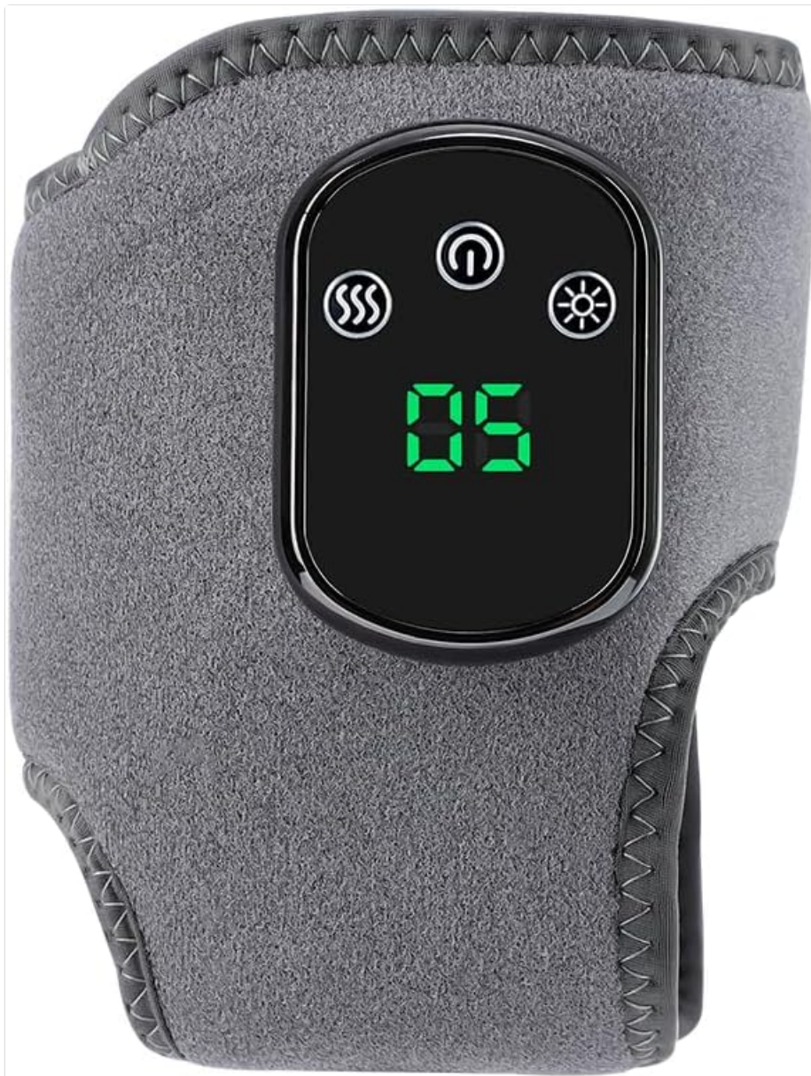
Figure 5: Ankle Massager Control Panel. A clear view of the device's control panel, showing the digital display and buttons for power, heat, and vibration settings.