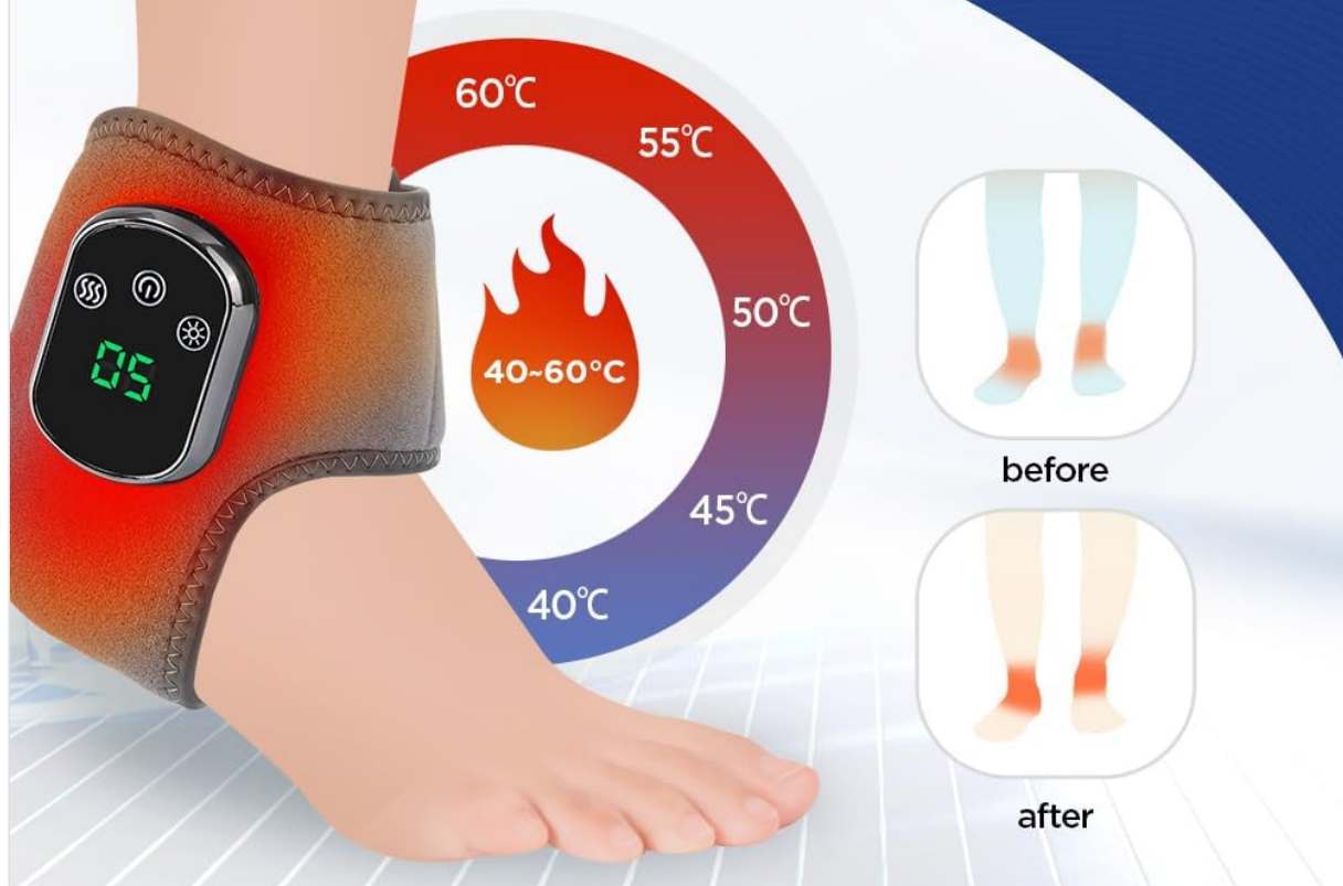
Figure 7: Heat Therapy Settings. This graphic illustrates the five adjustable temperature settings (40°C, 45°C, 50°C, 55°C, 60°C) for infrared hot compress therapy, designed to relieve various ankle pains.