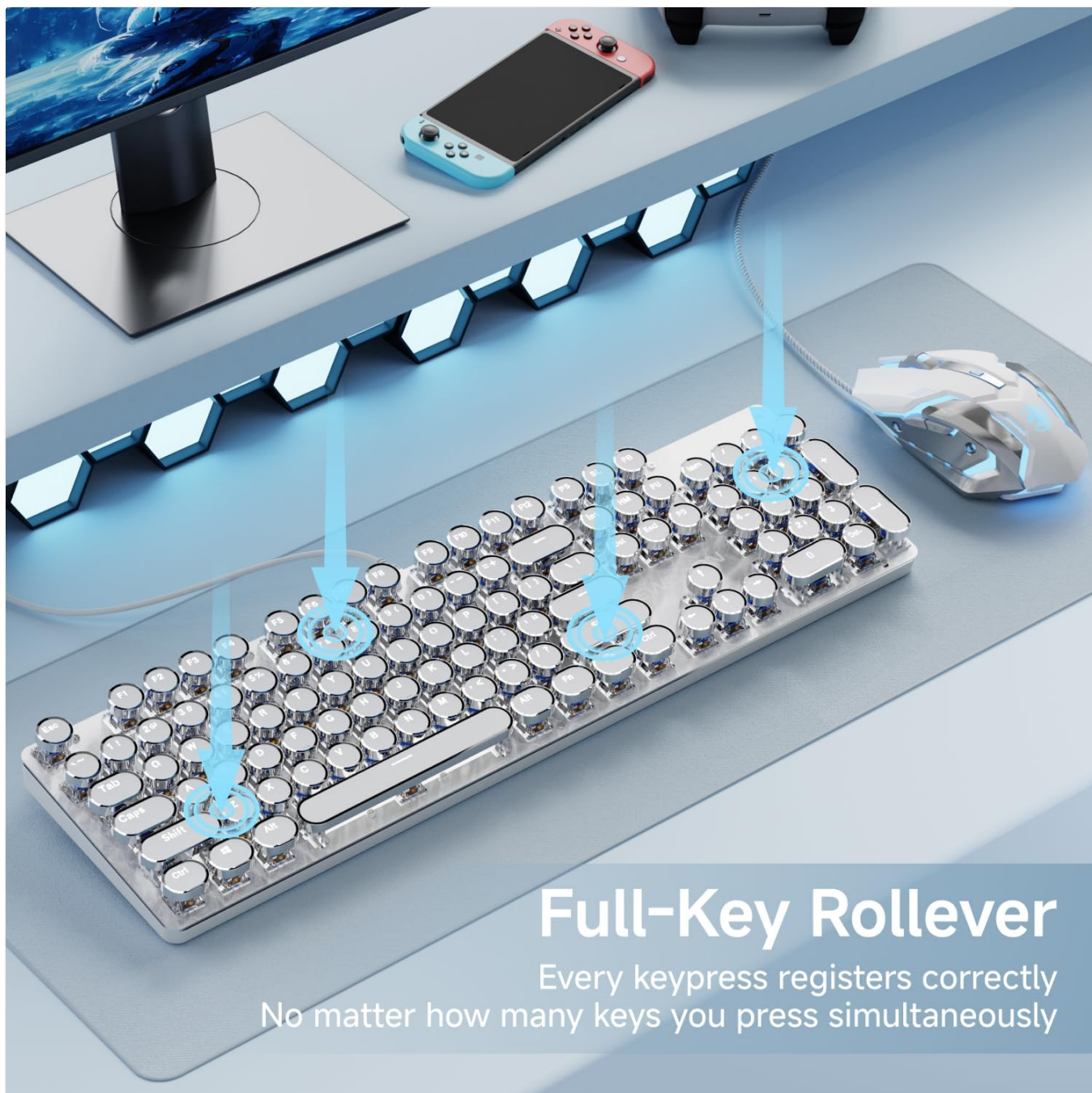
Image: Visual representation of the full-key rollover capability, showing multiple keypresses being registered simultaneously on the keyboard.

rapid, simultaneous presses. This is particularly beneficial for gaming and fast typing.