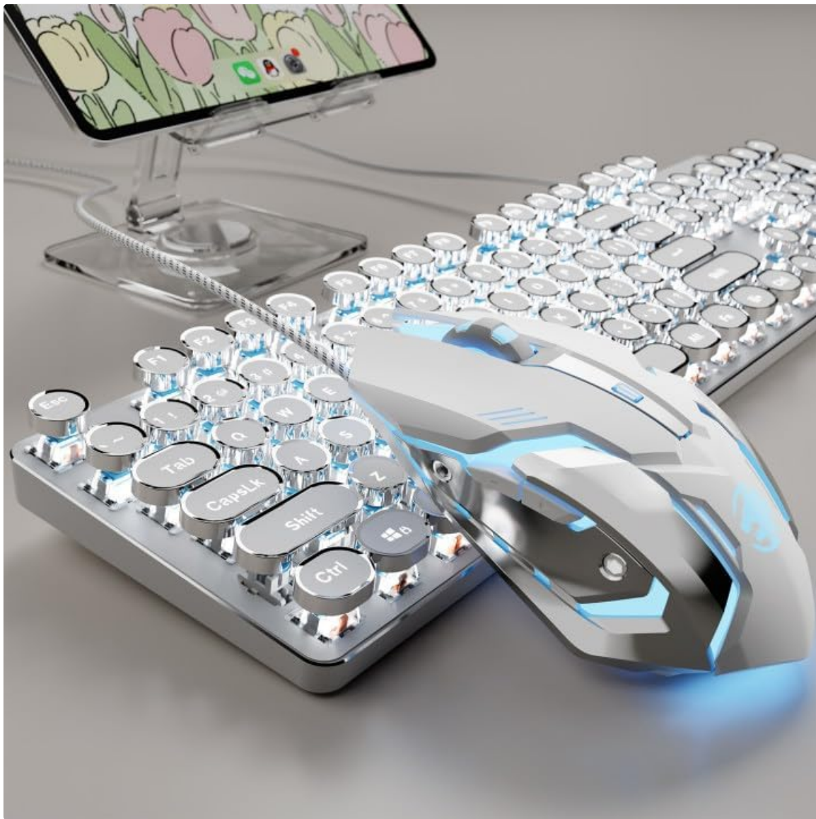
Image: The EWEADN TK100 wired mechanical keyboard and mouse combo, showcasing its white backlit keys and ergonomic design.