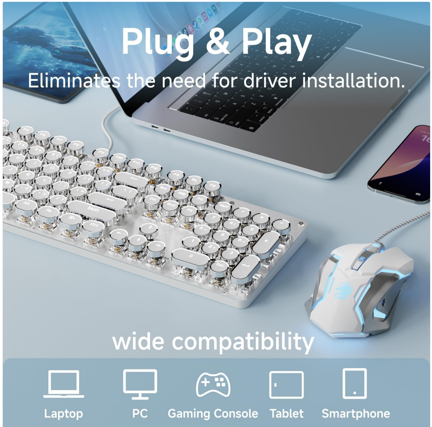
Image: Illustration of the simple plug-and-play setup, showing the keyboard and mouse connected to a laptop, highlighting wide compatibility with various devices.