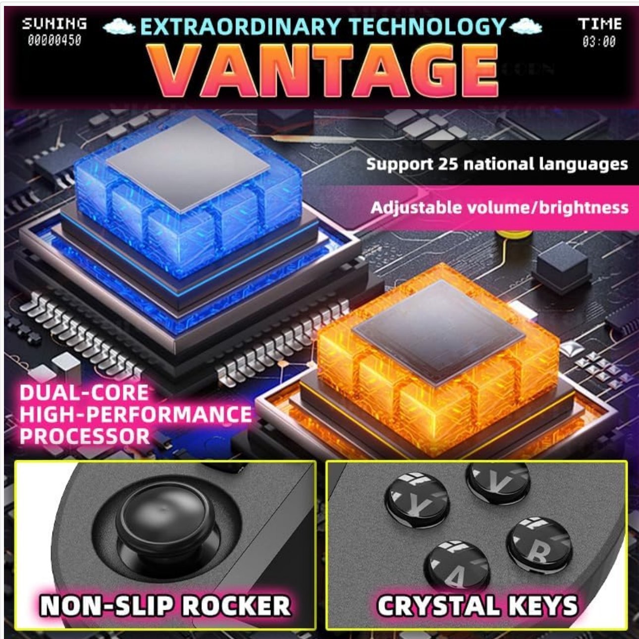
Image: Close-up of the console highlighting the dual-core high-performance processor, non-slip rocker, and crystal keys.