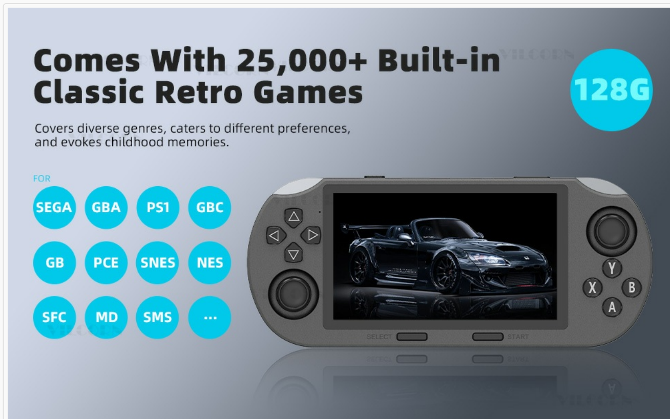
Image: Console displaying a menu with various retro game console logos, indicating a large library of built-in games.

The console comes pre-loaded with over 25,000 games across various emulators. Select an emulator from the main menu, then browse the game list. Select a game and press the 'A' button to start playing.