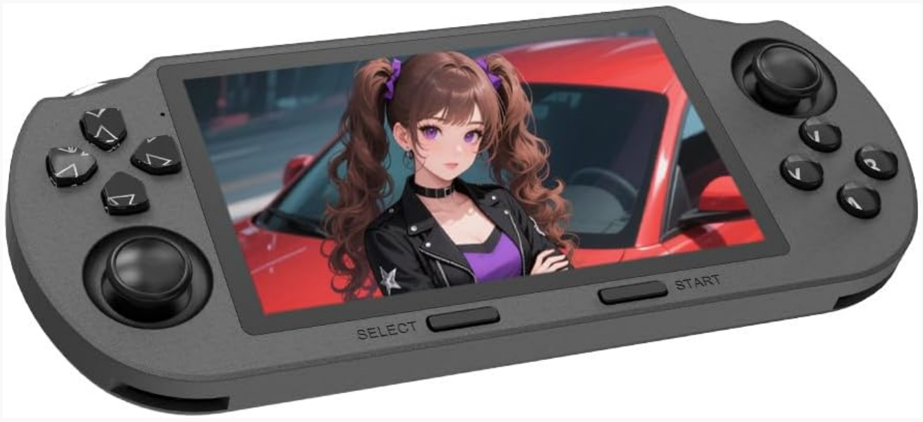
Image: Front view of the VILCORN SF3000 Retro Handheld Game Console, displaying a game on its screen.