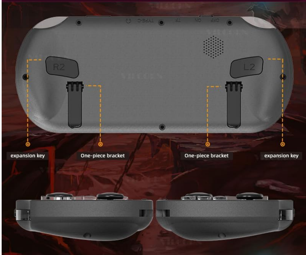
Image: Detailed diagram of the back and top buttons and ports on the VILCORN SF3000, showing L/R buttons, expansion keys, TF socket, DC/OTG port, headphone jack, and one-piece brackets.