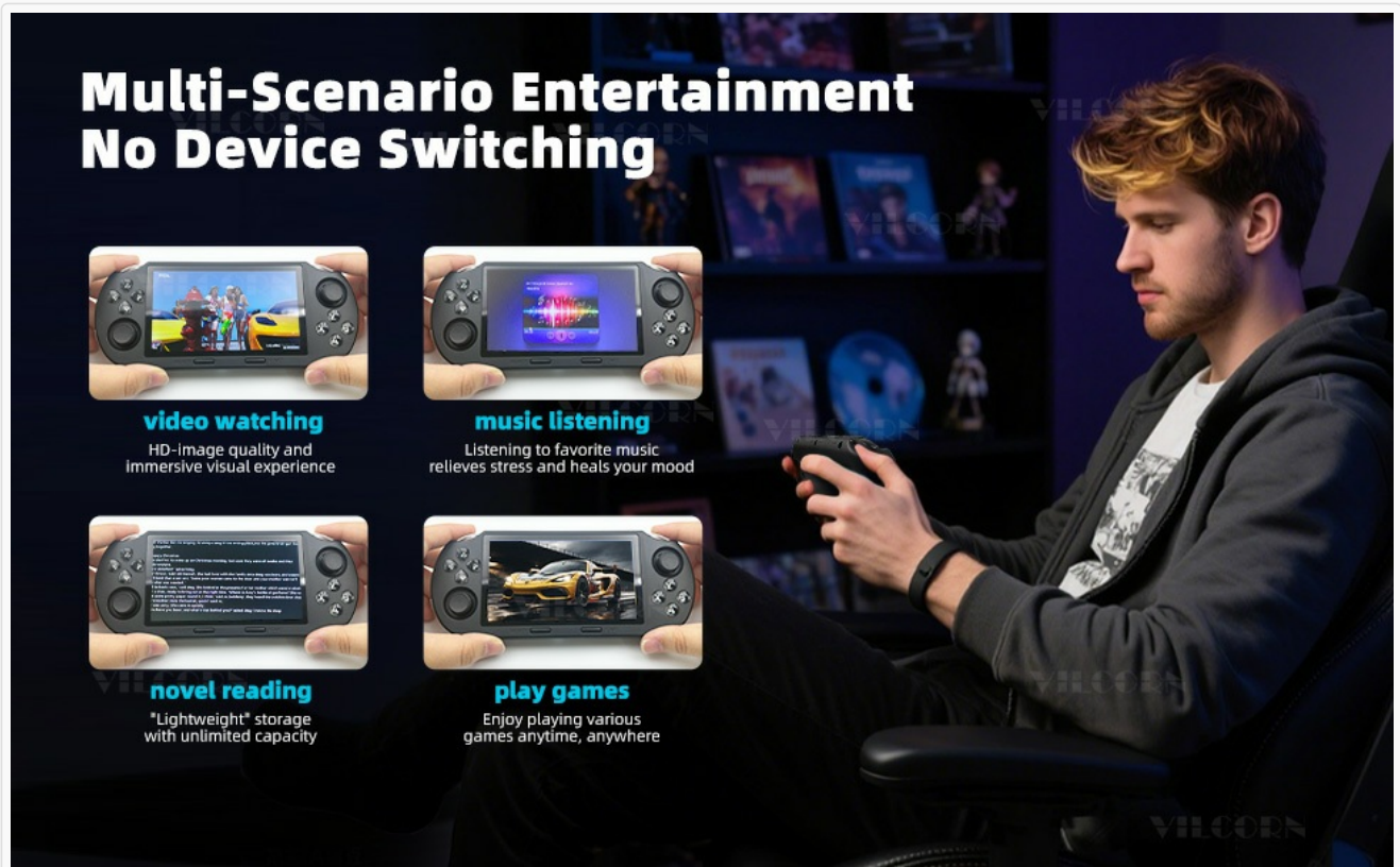
Image: A person using the console for various activities like video watching, music listening, novel reading, and playing games, illustrating its multi-scenario entertainment capabilities.