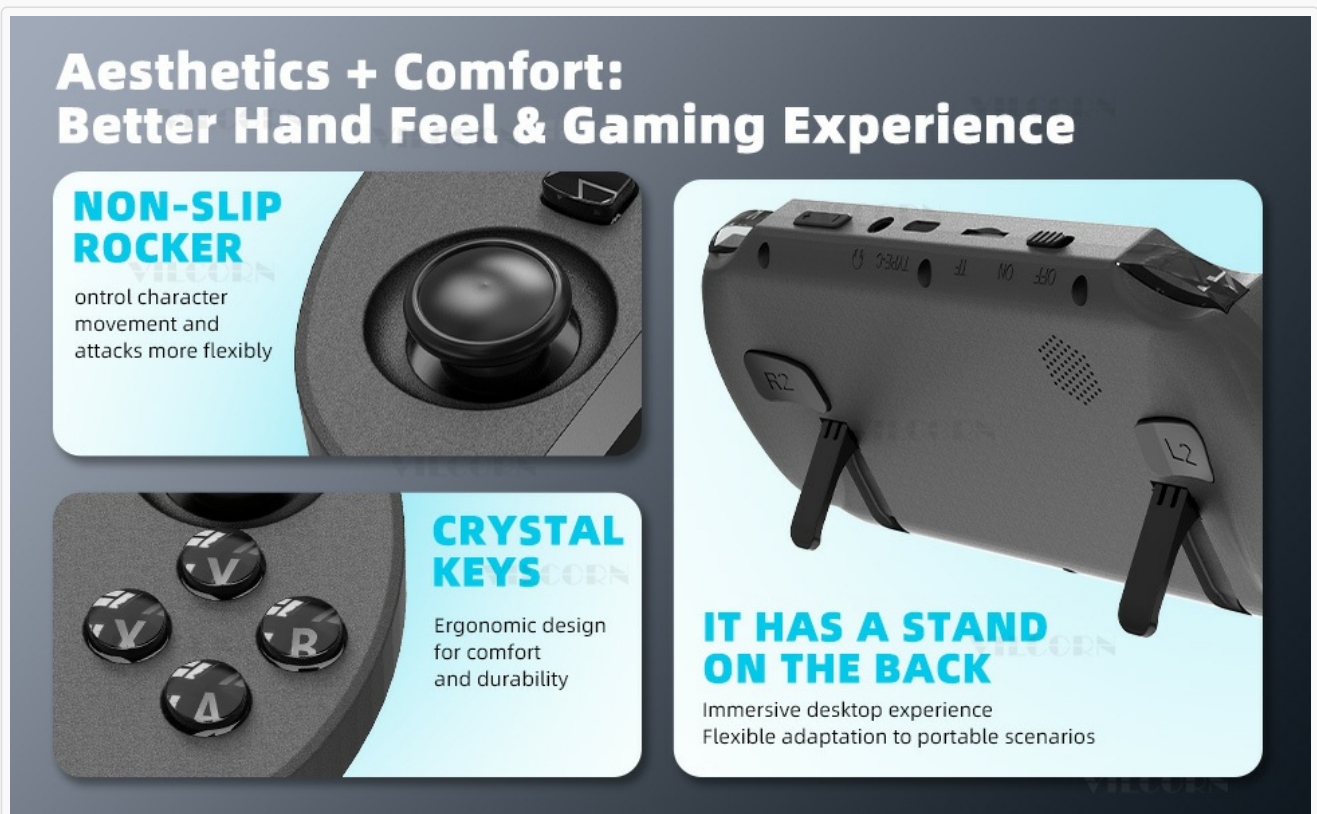
Image: Close-up of the console highlighting its non-slip rocker, crystal keys, and integrated stand for improved ergonomics and gaming experience.

Image: A person using the console for various activities like video watching, music listening, novel reading, and playing games, illustrating its multi-scenario entertainment capabilities.