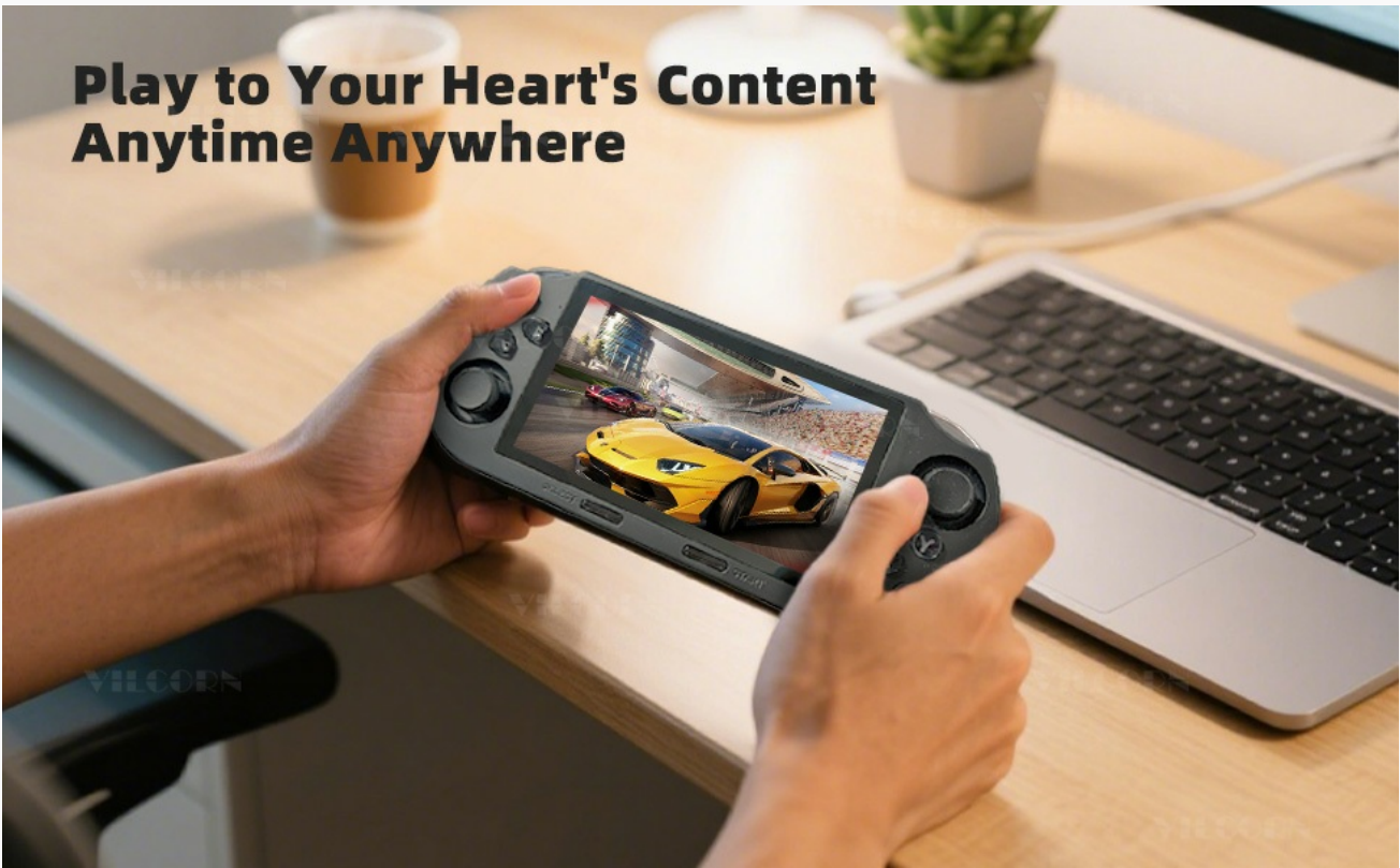
Image: A person playing the console in a casual setting, emphasizing its portability and ability to play anytime, anywhere.