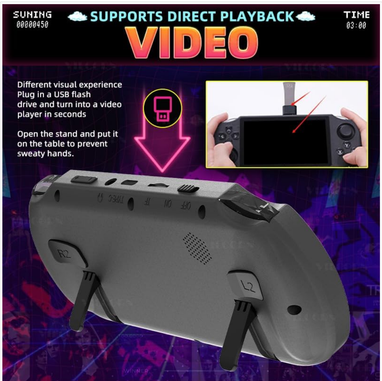
Image: Console demonstrating direct video playback from a USB flash drive and showing its integrated stand for hands-free viewing.