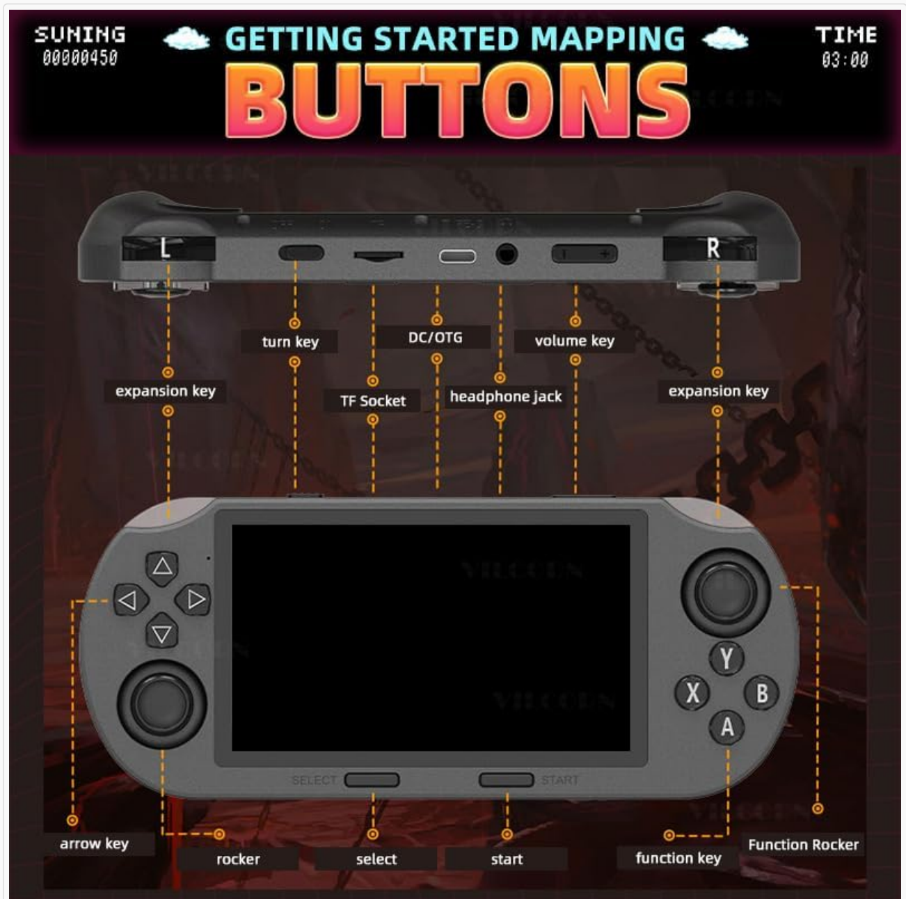
Image: Detailed diagram of the front buttons on the VILCORN SF3000, including arrow keys, rocker, select, start, and function keys.