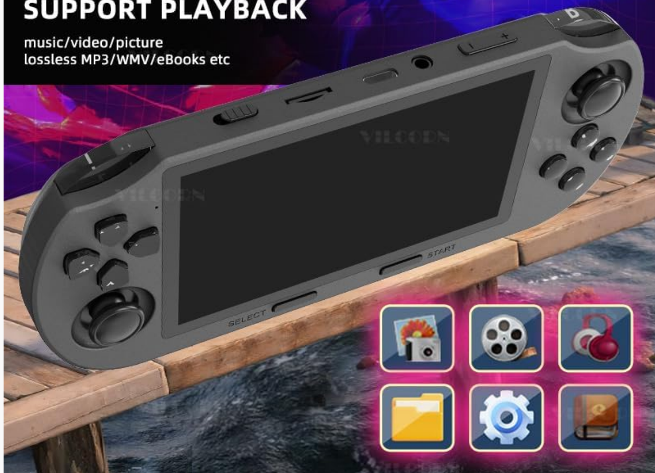
Image: Console showcasing its multi-media functions including music, film, and picture playback, and e-book reading.

music/video/picture lossless MP3/WMV/eBooks etc