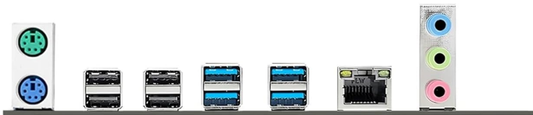
Figure 2.2.3: Rear Input/Output (I/O) panel of the motherboard, showing various ports including USB, Ethernet, and audio jacks.