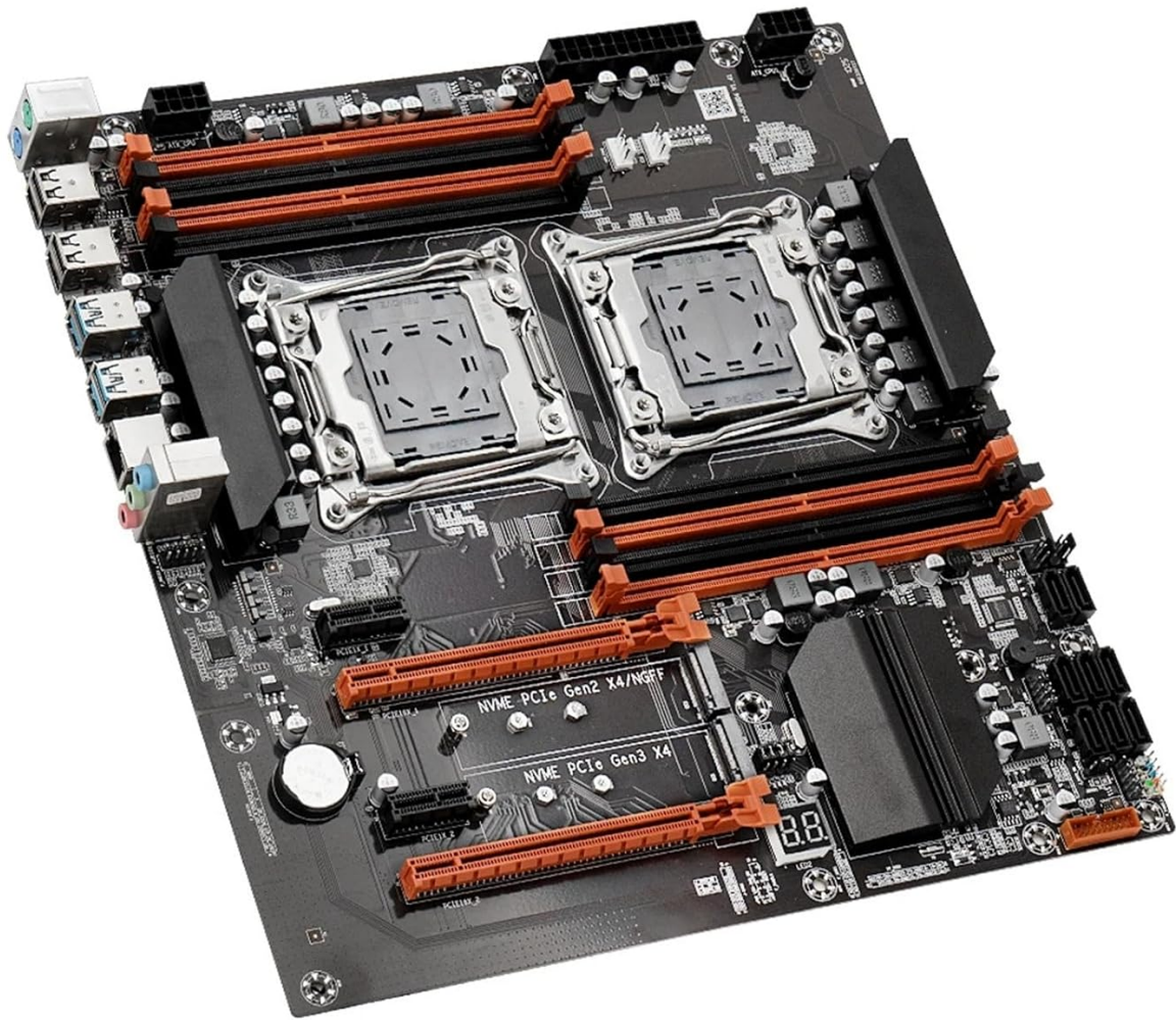
Figure 2.2.1: Top-down view of the X99 Dual CPU Motherboard, showcasing the dual CPU sockets, DDR4 RAM slots, and PCIe expansion slots.