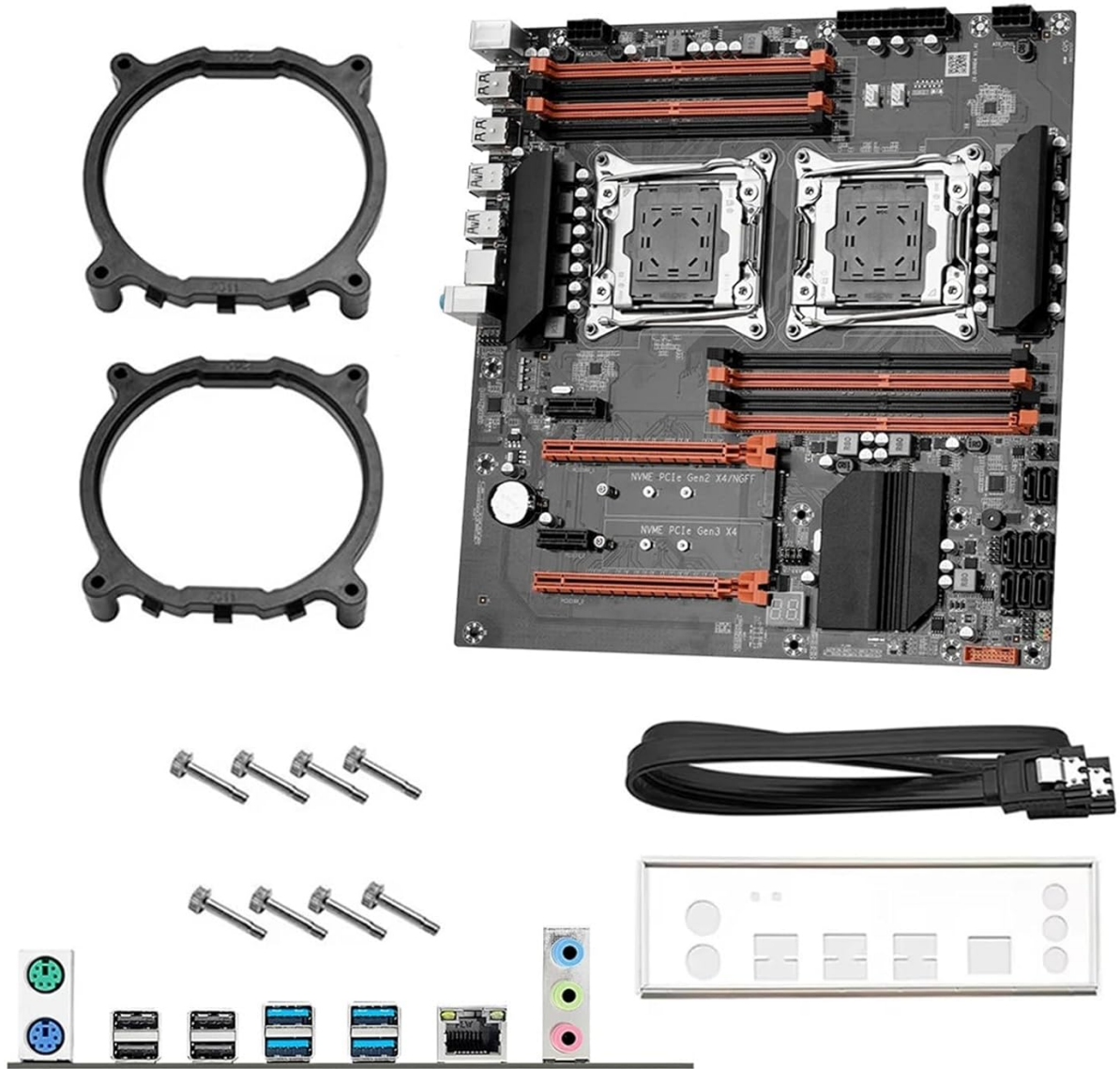
Figure 3.6.1: The motherboard shown with some included accessories, such as CPU cooler mounting brackets and SATA cables, which are essential for a complete setup.