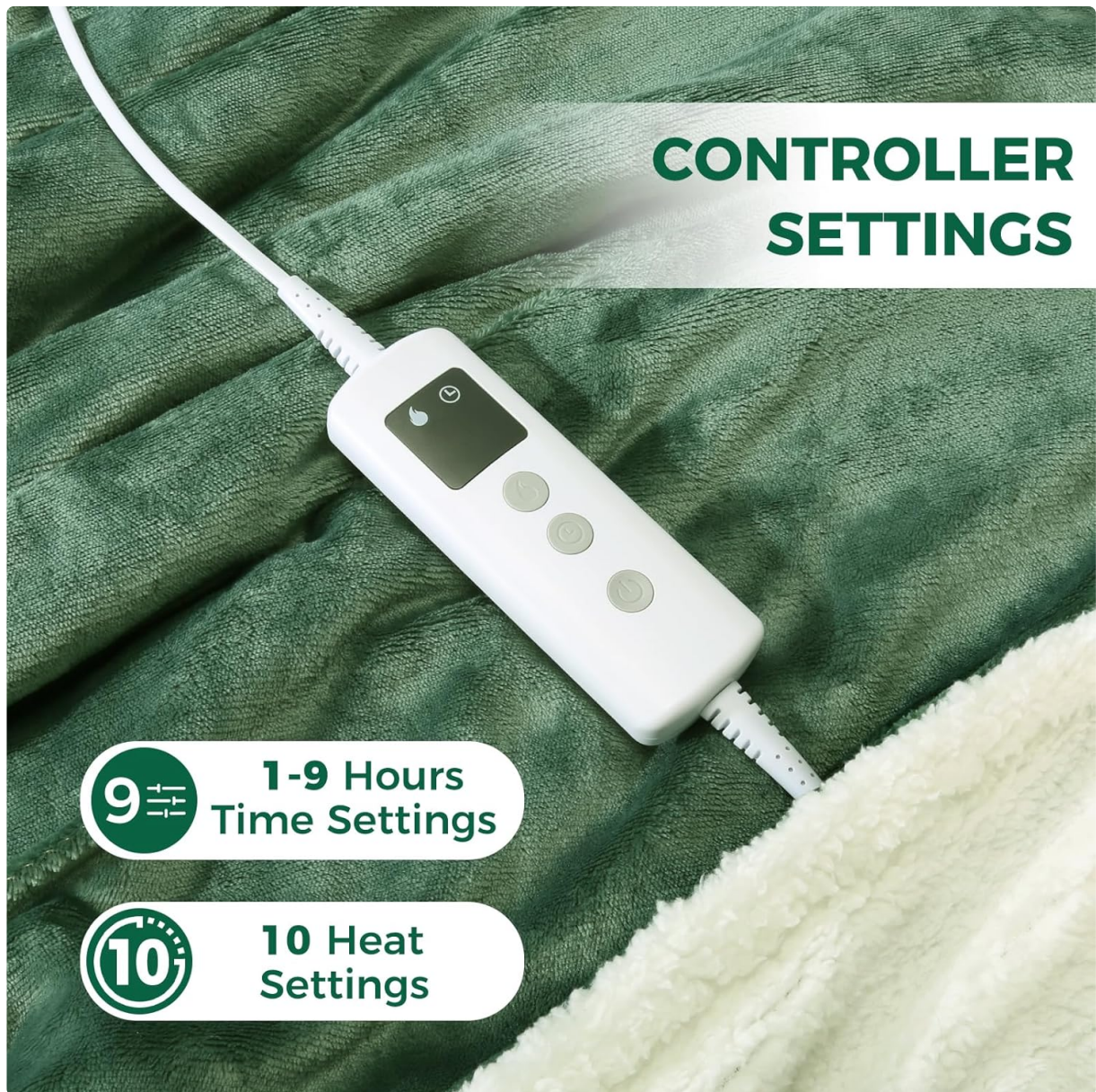
Image: The blanket's controller showing its connection point and control buttons for heat and timer settings.