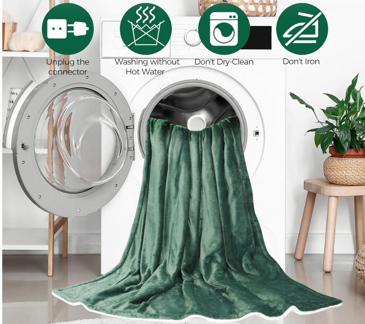
Image: Step-by-step visual guide for machine washing the heated blanket, emphasizing the detachment of the controller and specific care instructions.

Before washing, unplug the power connector