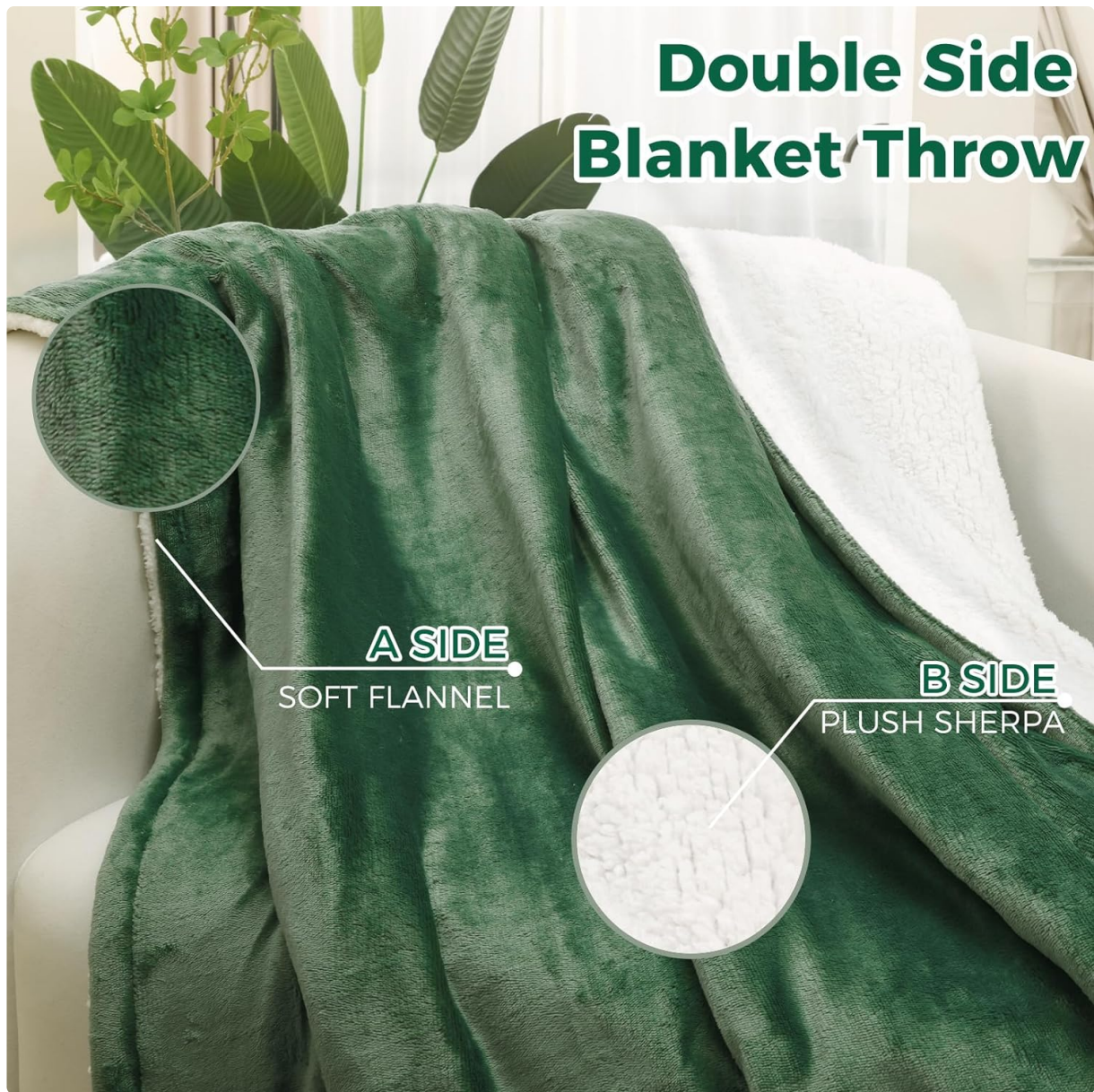
Image: The PROALLER Heated Blanket features a reversible design with soft flannel on one side and plush Sherpa on the other, offering dual textures for comfort.