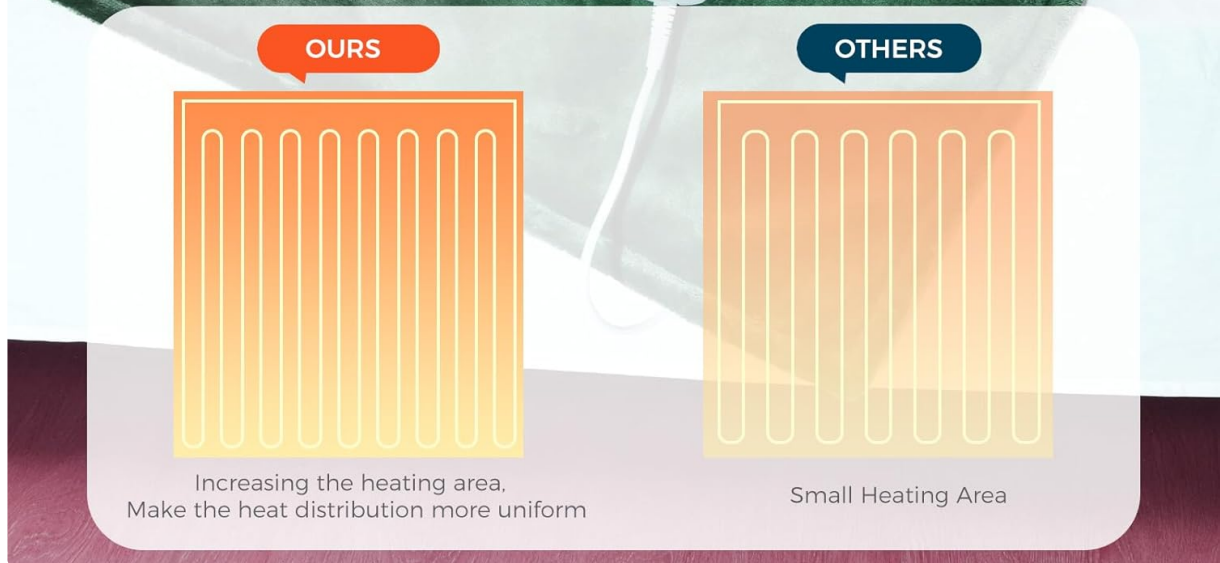
Image: The blanket's internal heating elements are shown, along with the controller displaying 10 heat settings for precise temperature control.

Fast warming with fully adjustable heat control