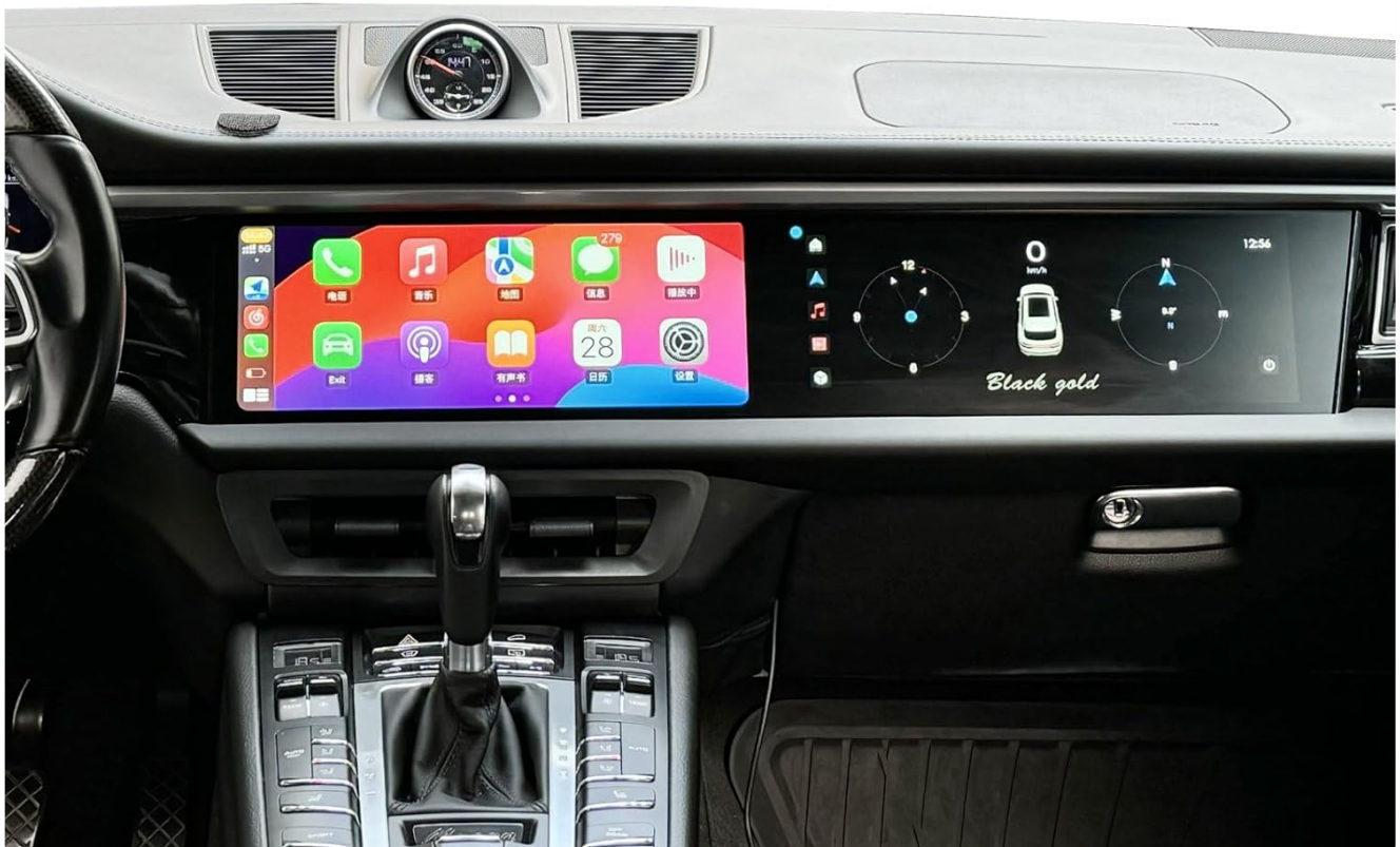
The main application interface of the dual screen radio.