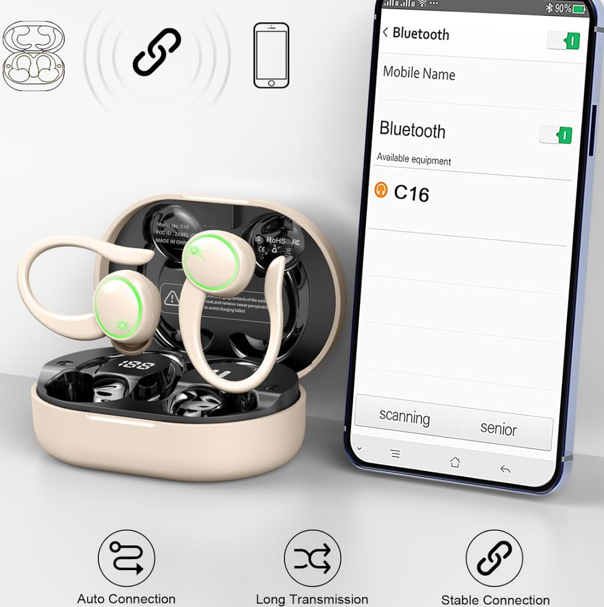
Image: A visual representation of the one-step pairing process, showing the earbuds connecting to a smartphone via Bluetooth, highlighting auto-connection and stable transmission.