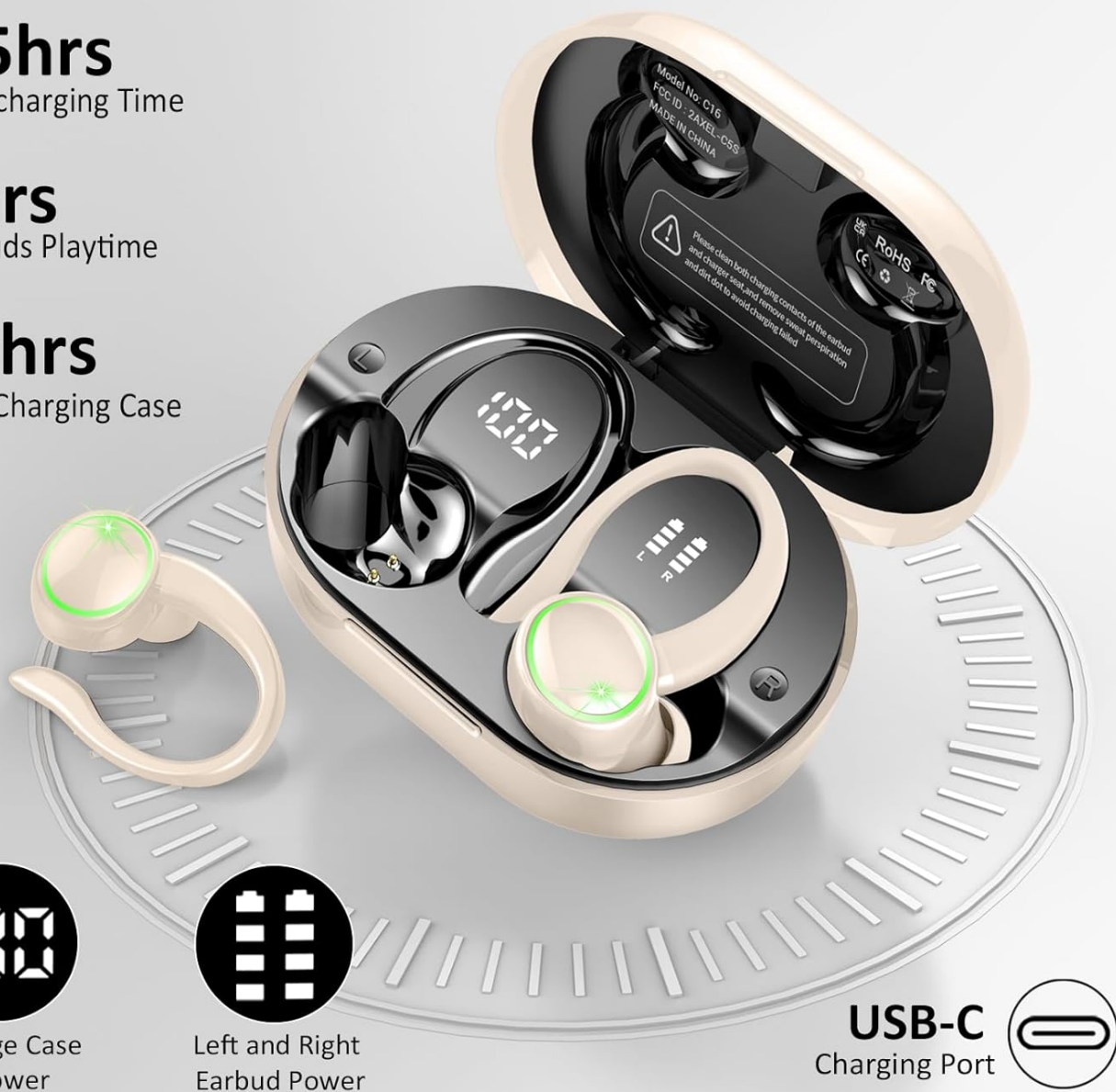
Image: The Matast C16 charging case displaying battery levels for both earbuds and the case, indicating its long battery life and USB-C charging port.