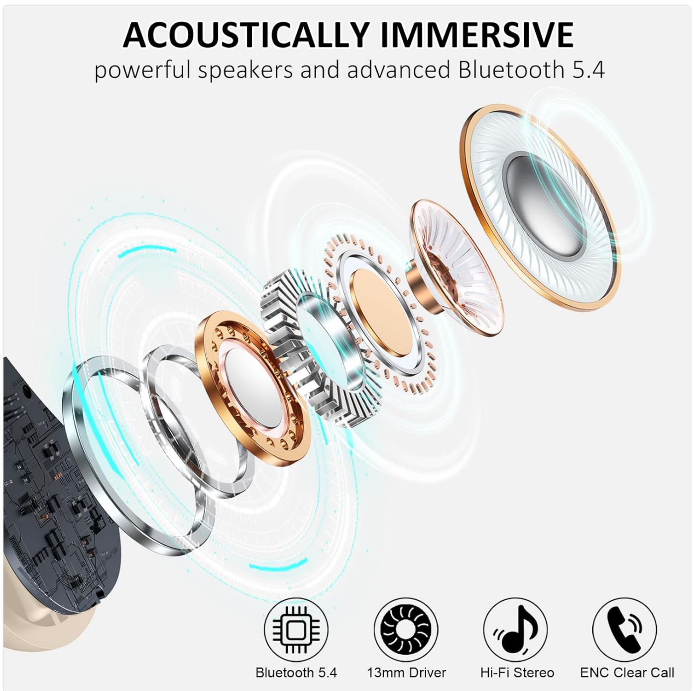
Image: An exploded view of the Matast C16 earbud's internal components, highlighting the Bluetooth 5.4 chip, 13mm driver, Hi-Fi Stereo capabilities, and ENC Clear Call technology.