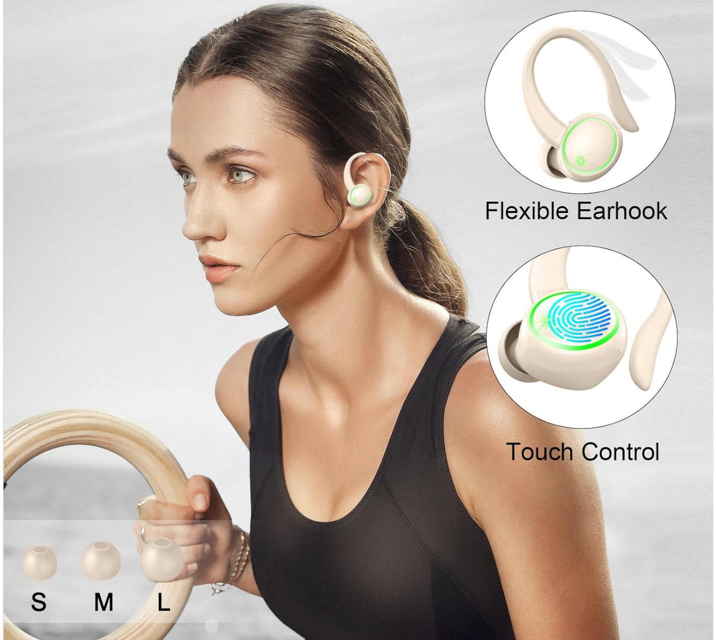
Image: A person wearing the Matast C16 earbuds, demonstrating the ergonomic 45° ear hook design and the availability of S, M, L ear tip sizes for a comfortable and secure fit during sports.