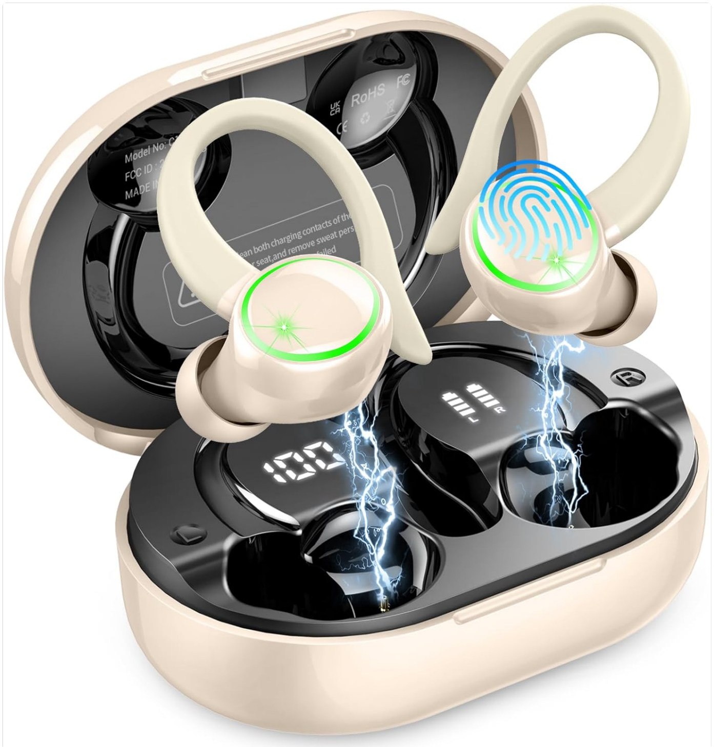
Image: Matast C16 Wireless Earbuds and their charging case, showcasing the product's design and components.