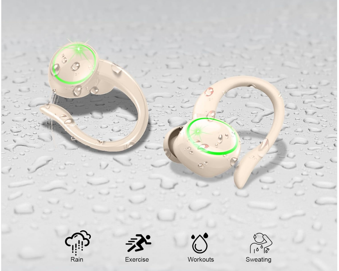
Image: The Matast C16 earbuds shown with water droplets, illustrating their IP7 waterproof and sweatproof capabilities, suitable for exercise and outdoor activities.

Superior protection in rain/sweating/exercise/workouts