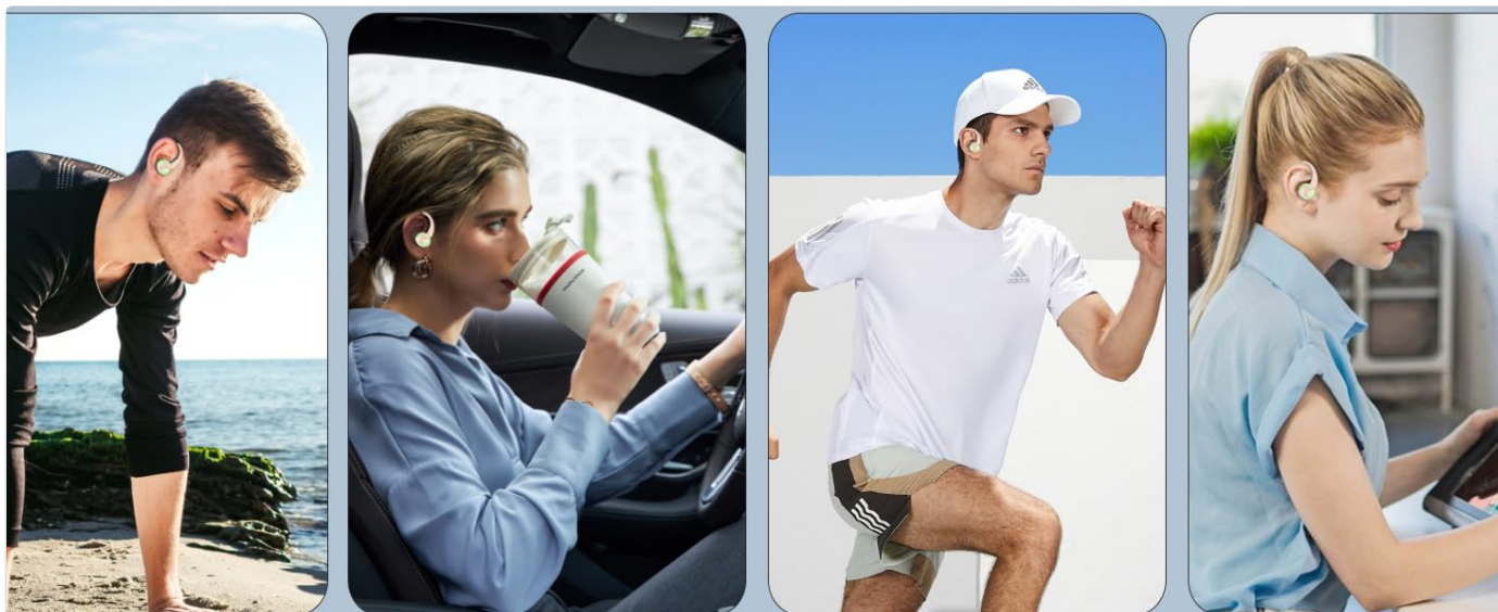
Image: Instructions for wearing the earbuds securely.