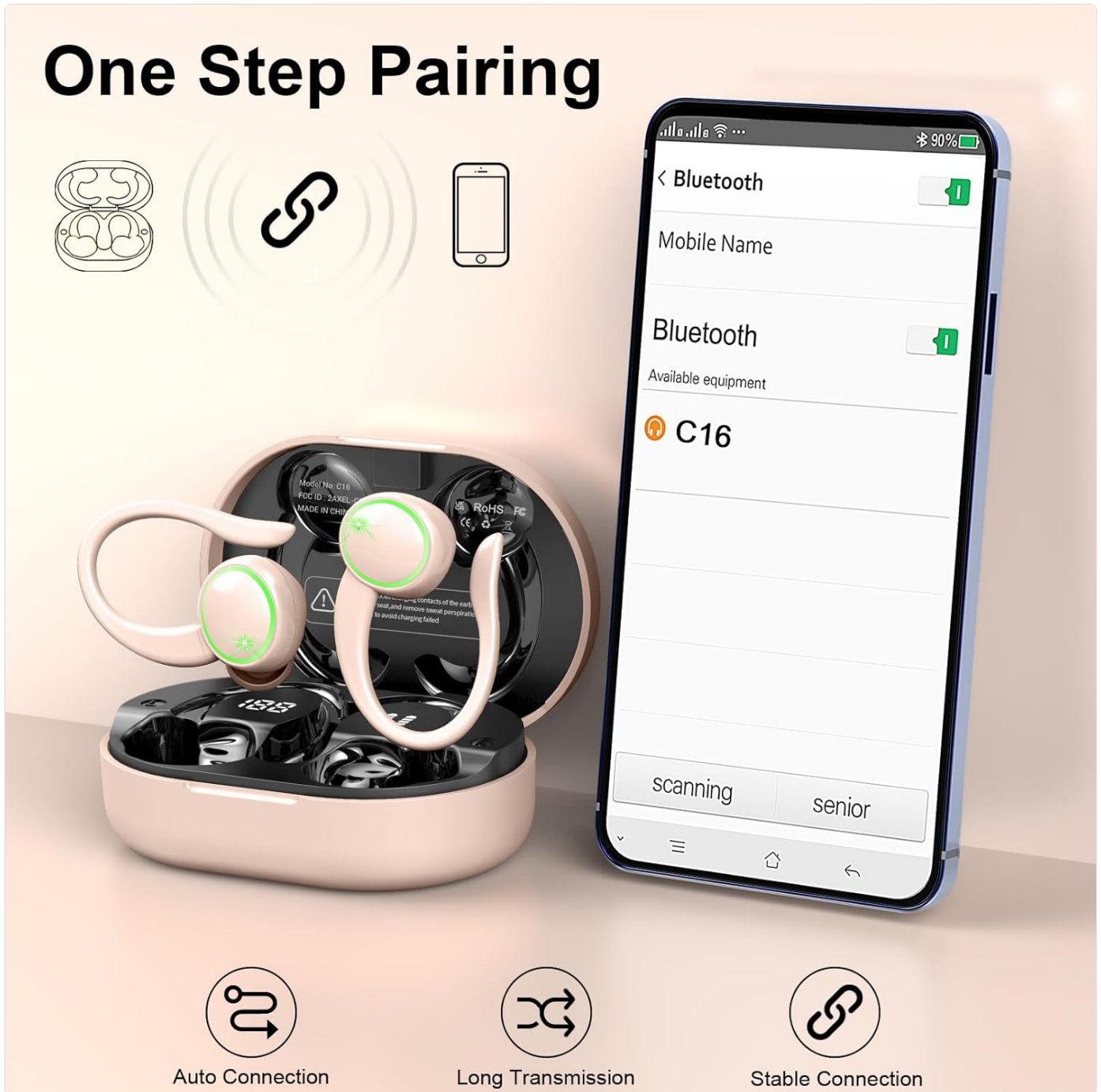
Image: One-step pairing process for Matast C16 Wireless Earbuds.

connect. The other earbud can remain in the case or be used later.