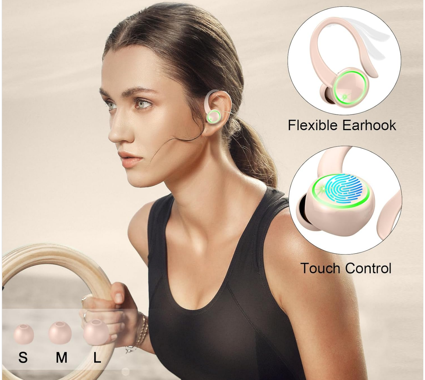
Image: Matast C16 earbuds demonstrating IP7 waterproof capabilities.