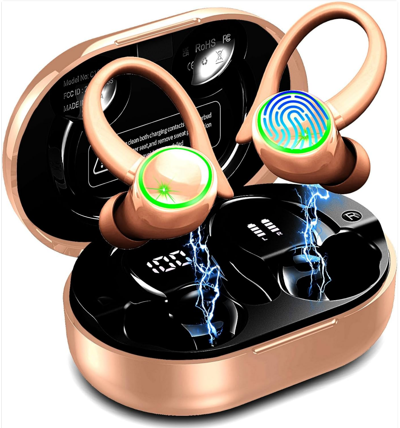
Image: Matast C16 Wireless Earbuds and charging case.