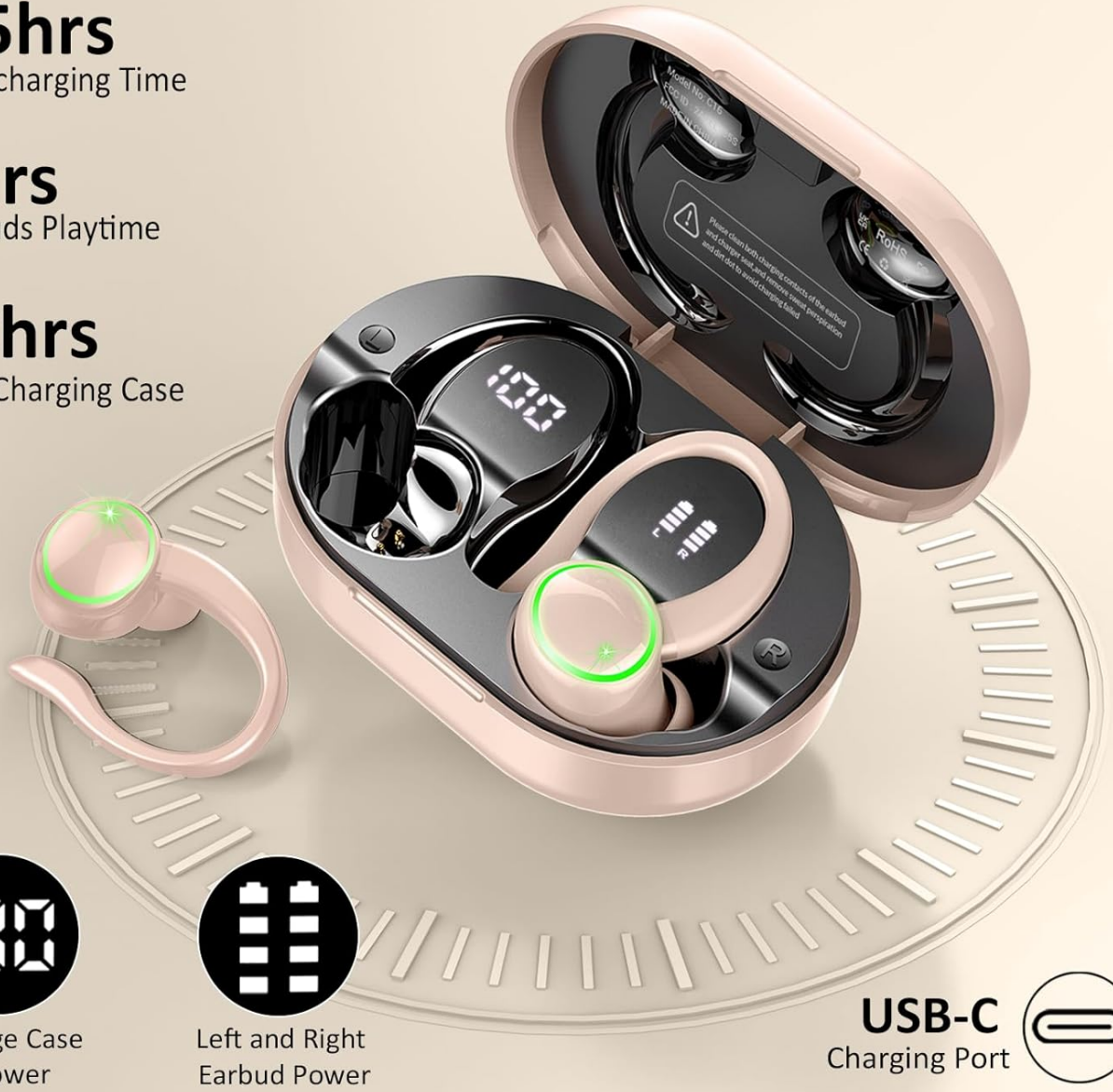
Image: Charging case displaying battery levels and USB-C charging port.