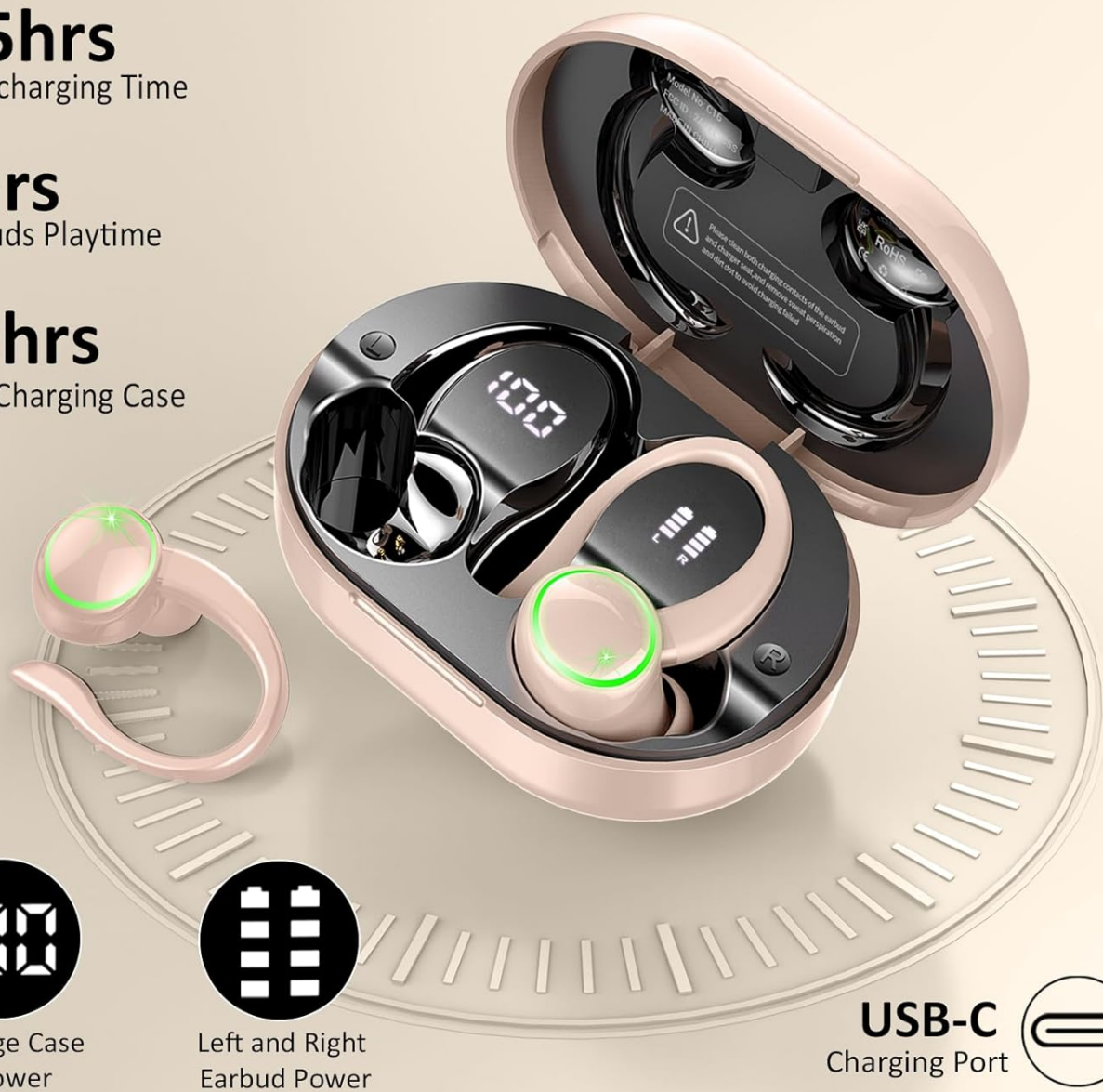
Image: Matast C16 Charging Case with digital display.