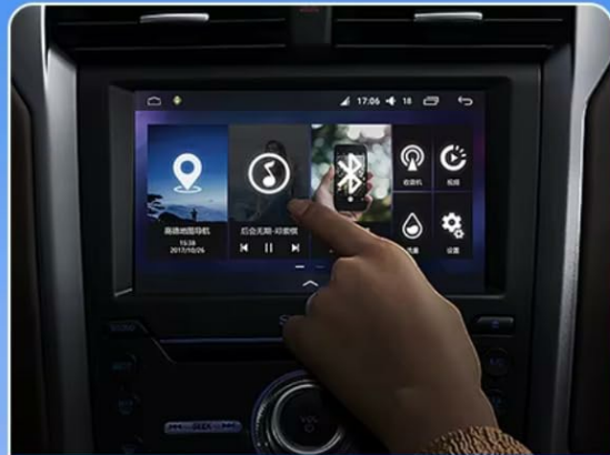
Touch Screen Control

Image: Four panels showing different car control methods: steering wheel control, knob control, voice control, and touch screen control, all compatible with the adapter.