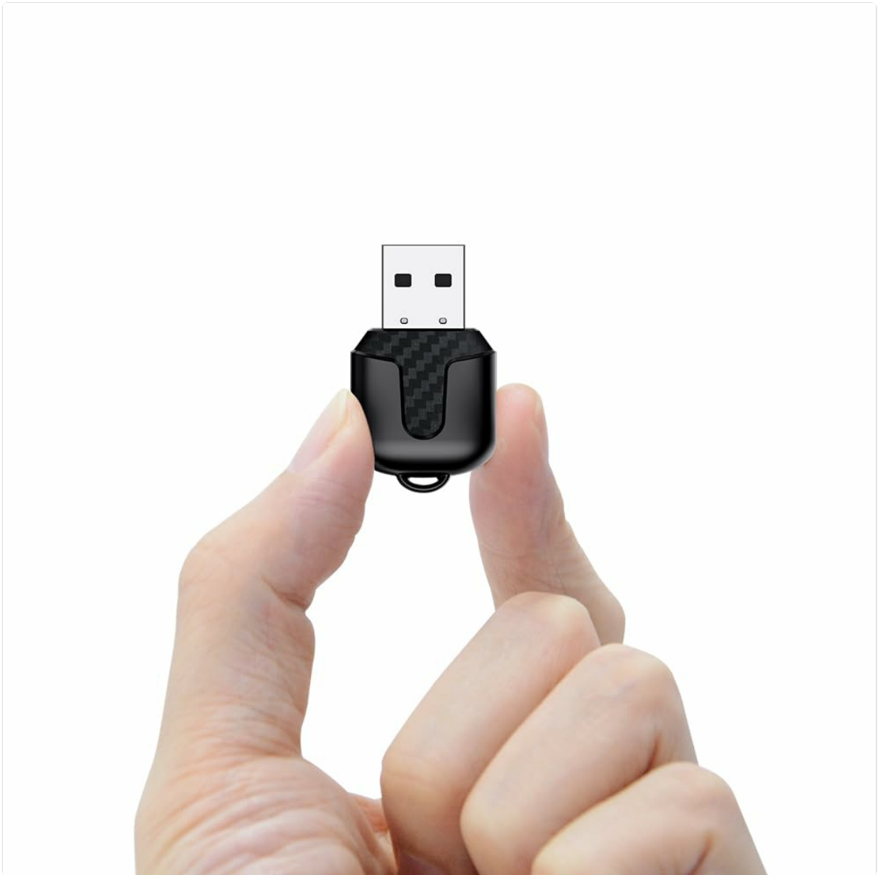
Image: EKIY EC16 Wireless CarPlay & Android Auto Adapter, shown in a compact size.