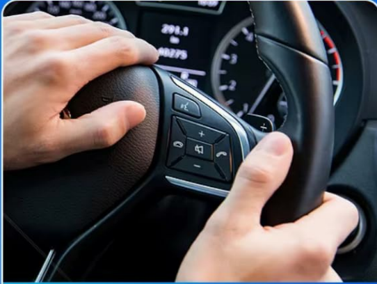
Steering Wheel Control