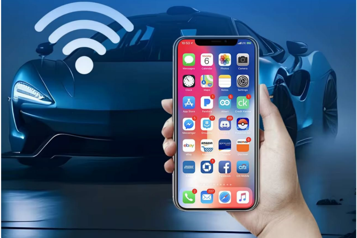
Image: A smartphone displaying connection icons, with a car's silhouette in the background, illustrating the automatic connection feature of the adapter.

After connecting the box for the first time, the subsequent car can be automatically connected, intelligent and convenient