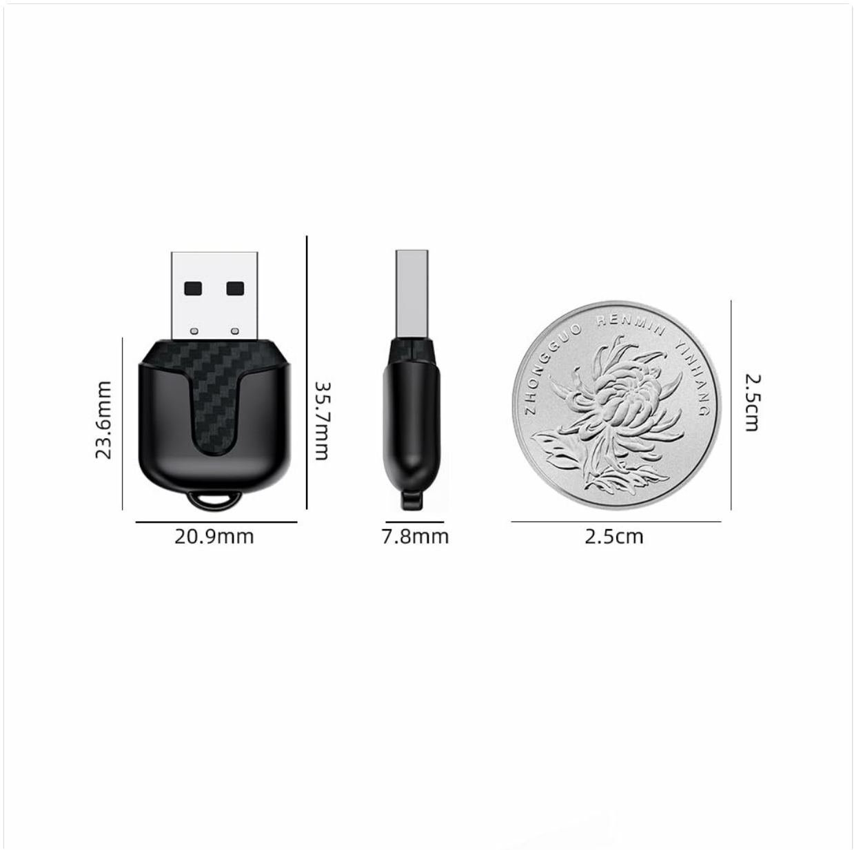
Image: Detailed dimensions of the EKIY EC16 adapter, shown next to a coin for scale.