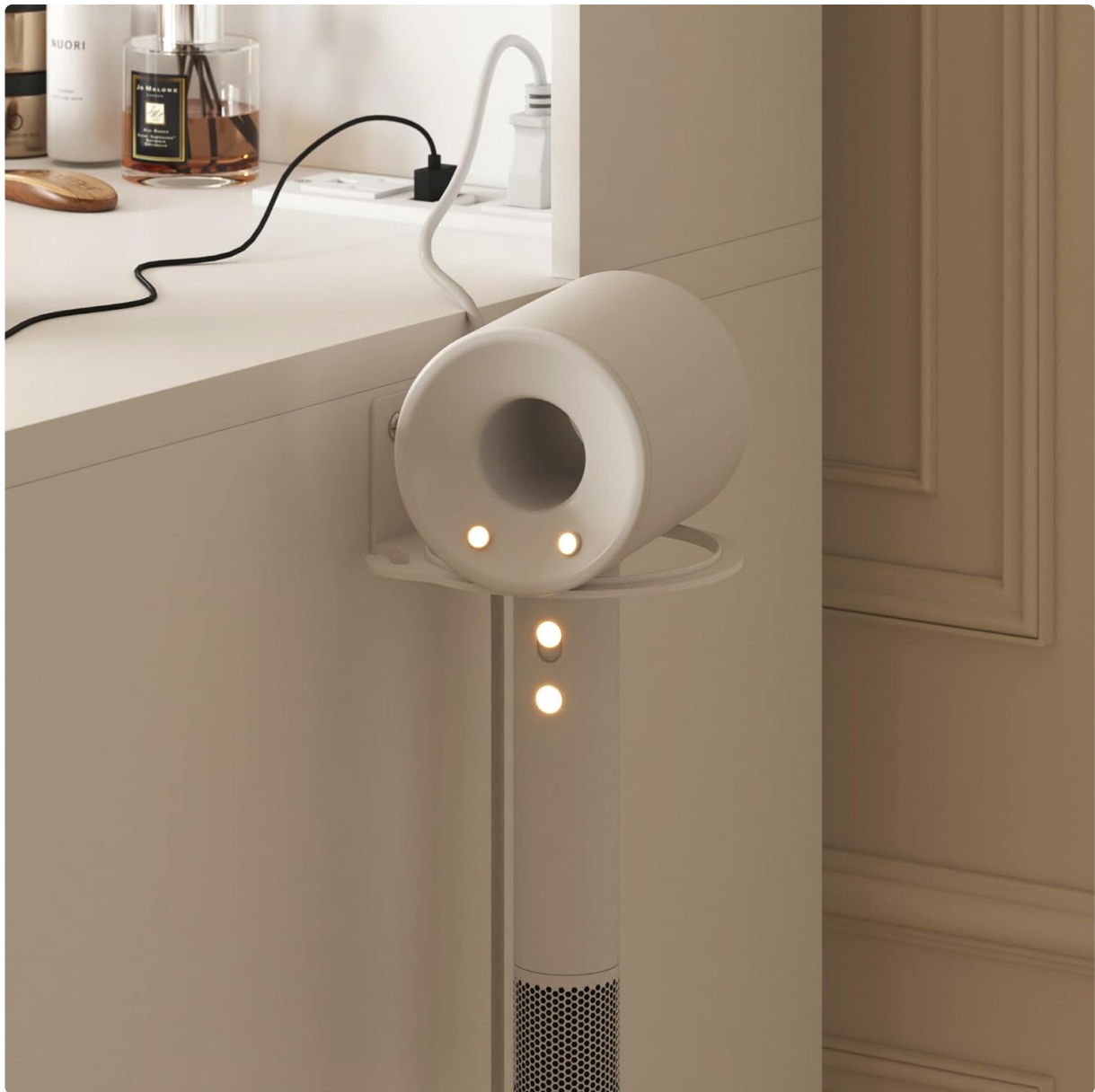
Figure 5.3: The dedicated hair dryer holder, positioned on the side of the vanity desk for easy access and organization.