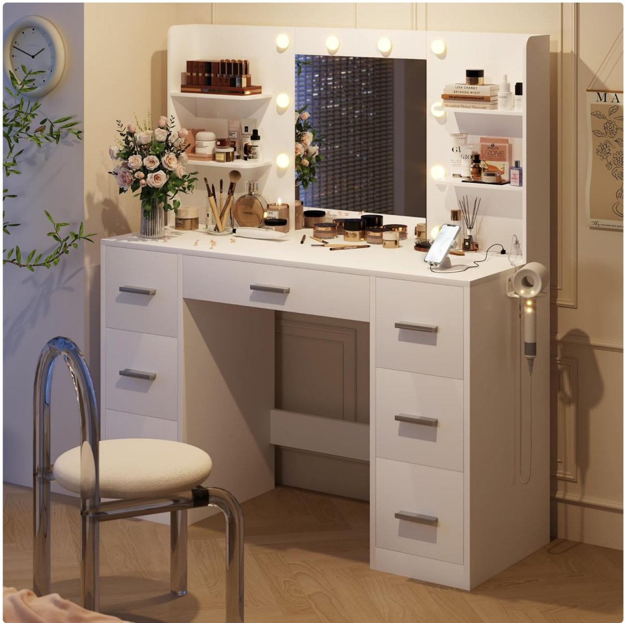
Figure 2.1: The YESHOMY Vanity Desk in Clear White, showcasing its mirror, lights, and overall design.