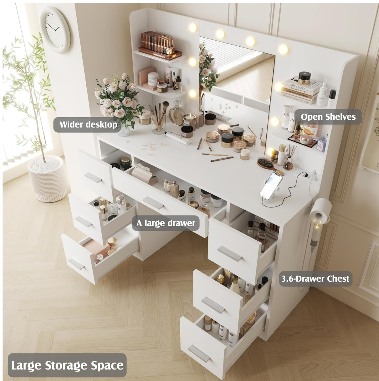
Figure 2.2: An aerial view of the vanity desk with multiple drawers and shelves open, illustrating the extensive storage space available for cosmetics and accessories.