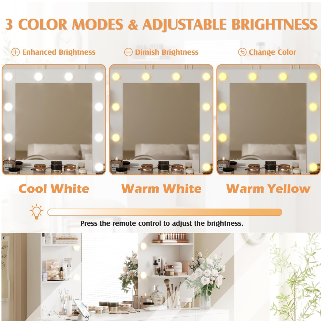
Figure 5.1: Illustration of the three available color modes for the mirror lights: Cool White, Warm White, and Warm Yellow, along with brightness adjustment controls.