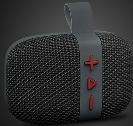
Image: Contents of the product packaging.