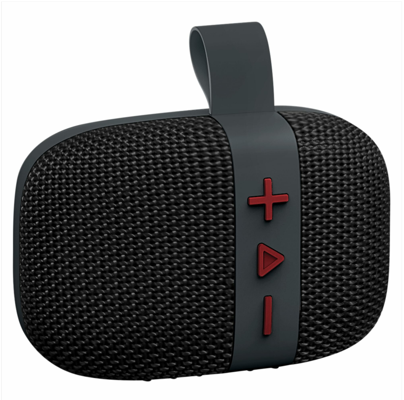
Image: Front view of the Fisher SBT294 speaker.