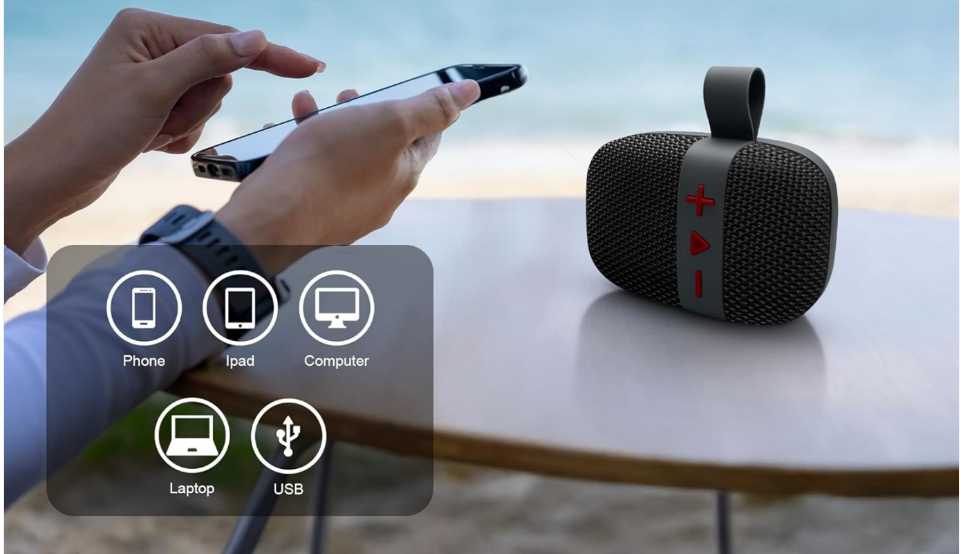
Image: Detailed view of the speaker's control buttons.

Quick pairing, stable transmission up to 33ft