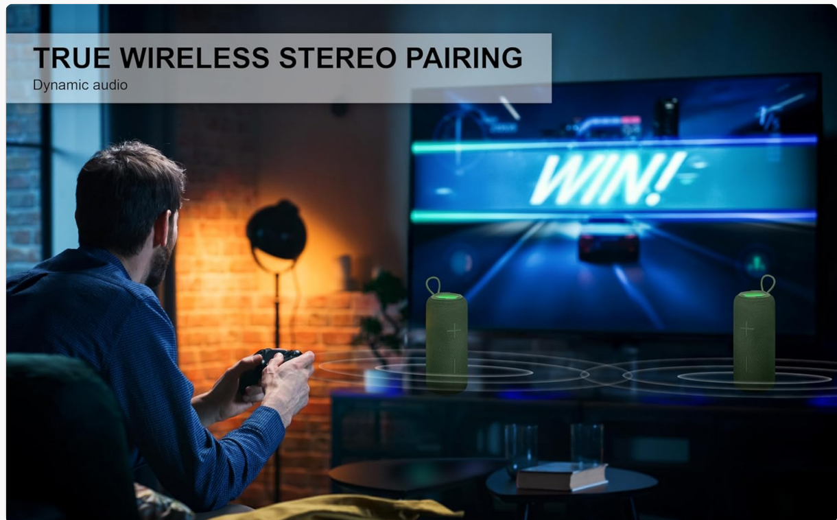
Image 6.1: True Wireless Stereo Pairing. This image demonstrates two speakers paired together for an immersive stereo audio experience, suitable for gaming or movies.