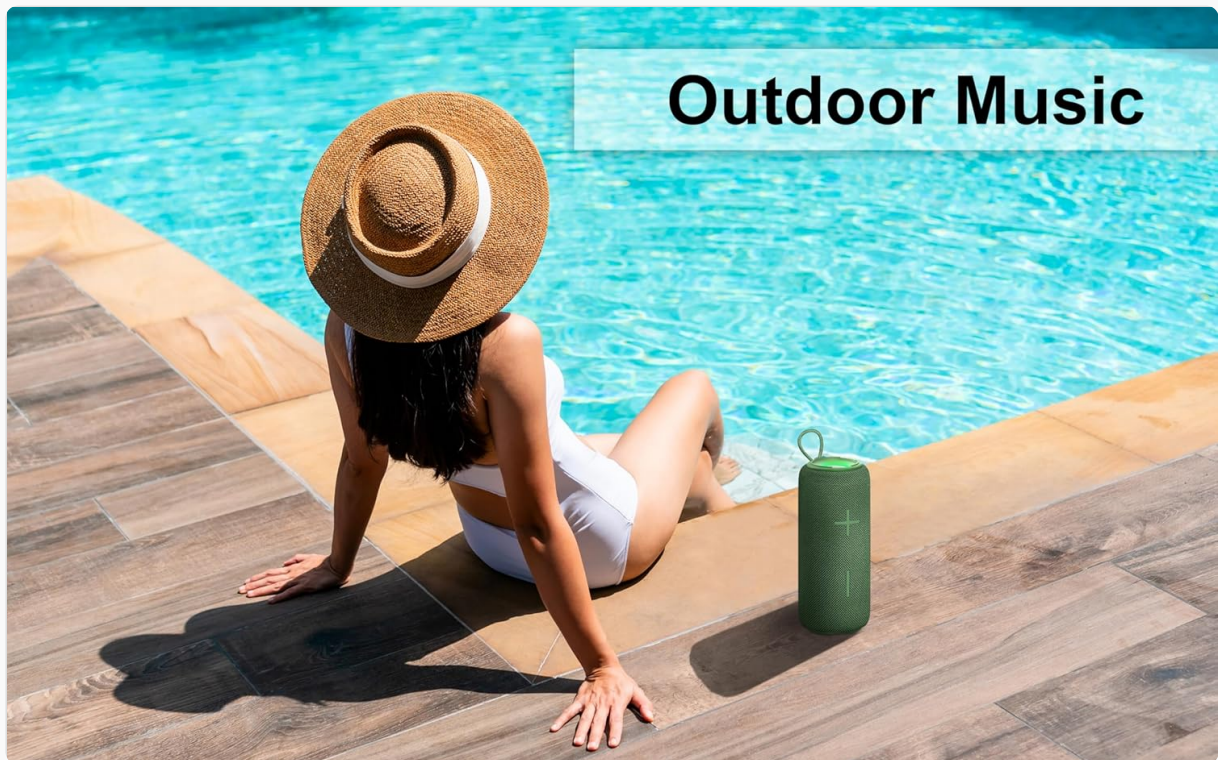
Image 1.2: Speaker in an outdoor setting. This image depicts the speaker being used outdoors next to a swimming pool, demonstrating its portability and suitability for various environments.

around its base, illustrating its IPX5 water resistance.