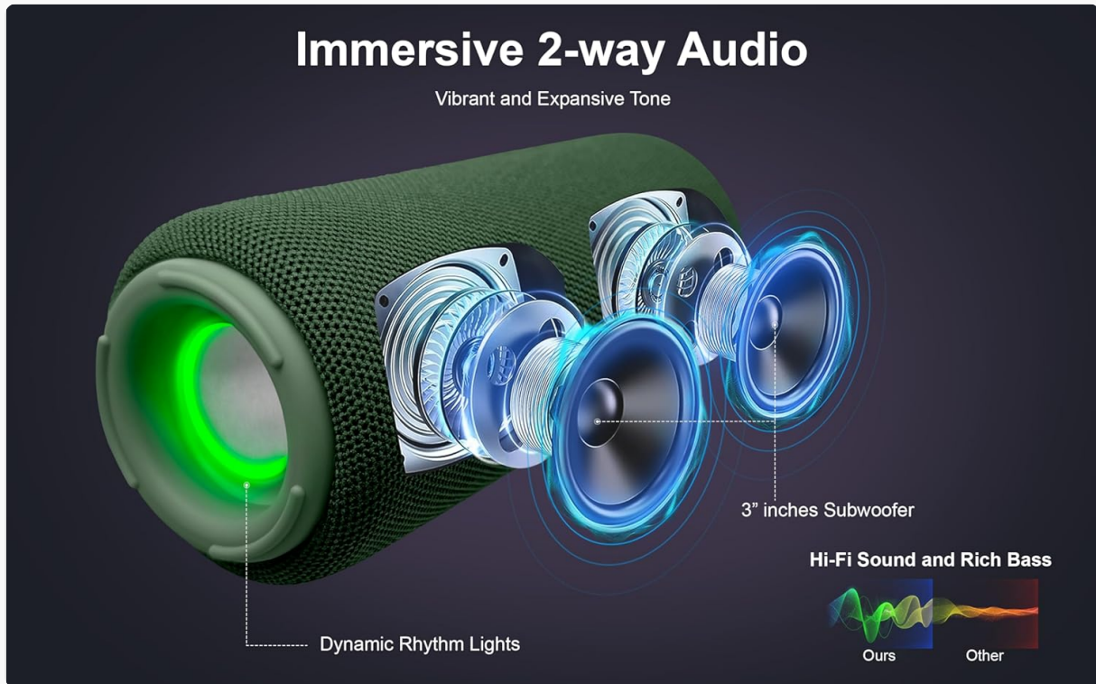
Image 6.3: Immersive 2-way Audio. This diagram illustrates the internal speaker components, including a 3-inch subwoofer, contributing to the speaker's sound quality and dynamic rhythm lights.

The FBT310 speaker is designed to deliver clear audio with deep bass, featuring a 2-way audio system for a balanced sound profile.