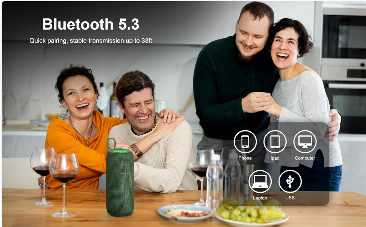
Image 5.1: Bluetooth 5.3 Connectivity. This image shows the speaker connected to various devices, illustrating its broad compatibility via Bluetooth 5.3.