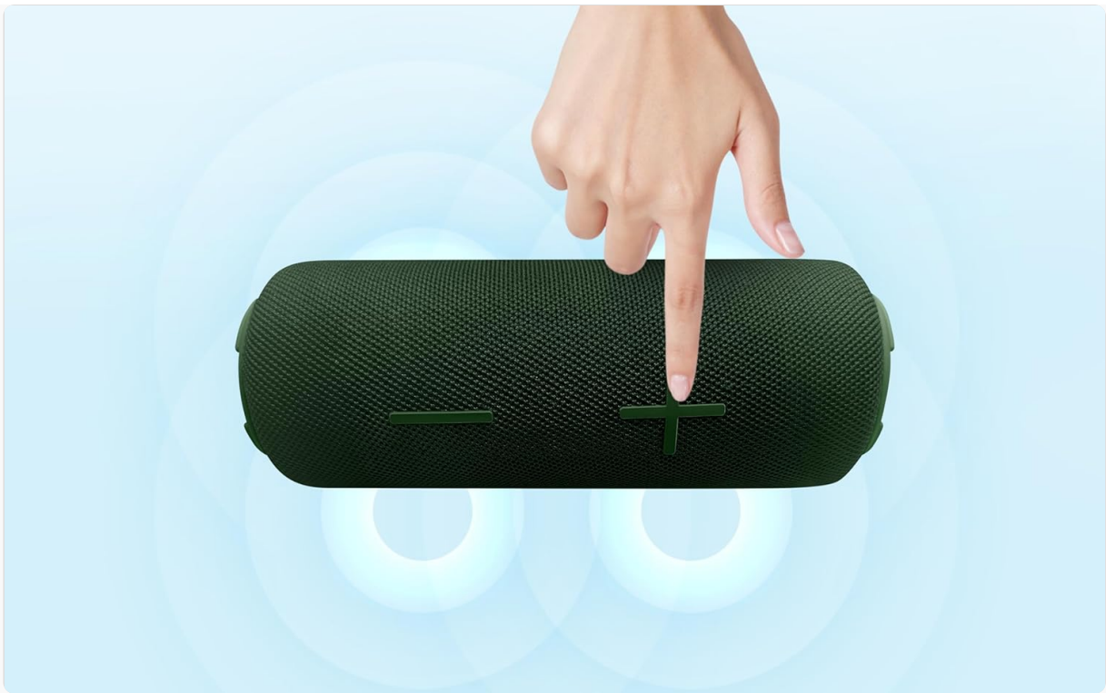
Image 4.1: Speaker Controls. This image illustrates the location of the control buttons on the speaker's top surface, with a hand pressing the volume up button.

The speaker features intuitive controls for easy operation: