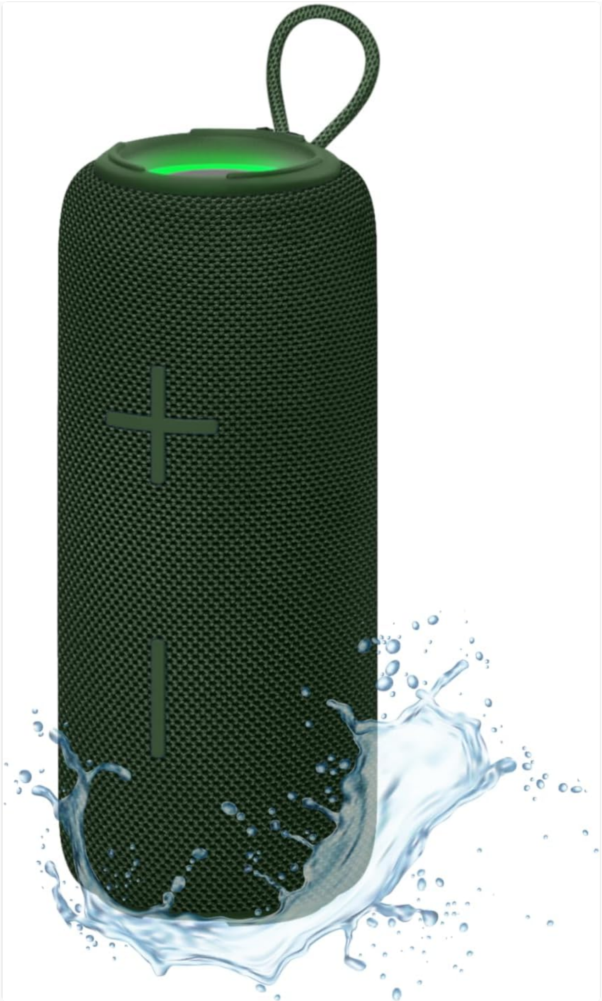
Image 1.1: Fisher Portable Bluetooth Speaker FBT310. This image shows the speaker in green, with water splashing