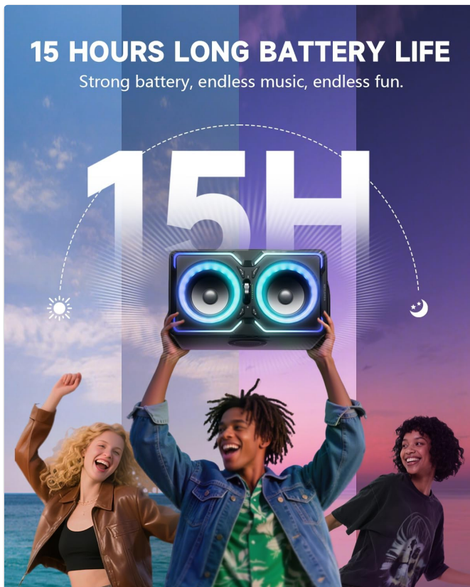
Figure 5: Up to 15 hours of continuous playtime.