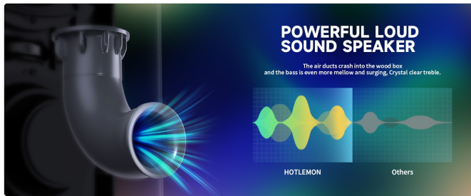
Figure 4: Wooden enclosure and bass duct for superior sound.