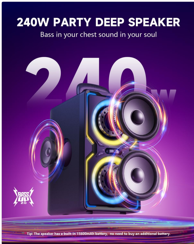
Figure 3: 240W Peak Powerful Sound with Deep Bass.