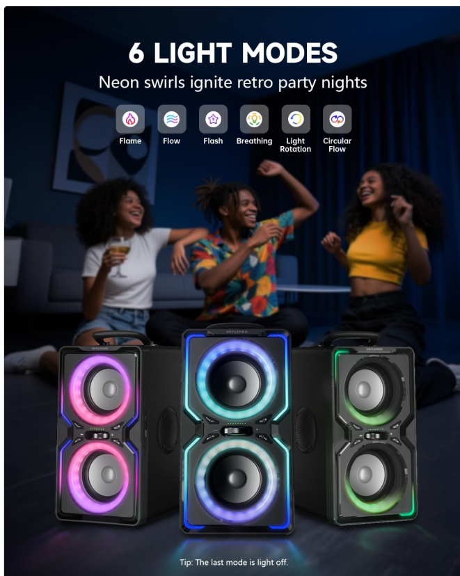
Figure 7: Six dynamic light modes that sync with music.