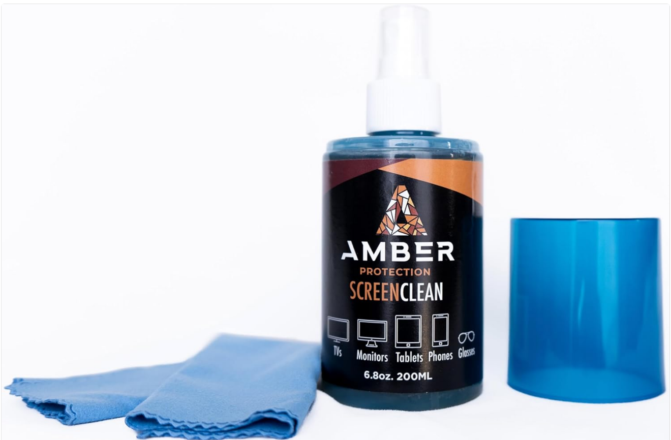
Figure 6.1: Example of a screen cleaning kit, recommended for maintaining display clarity.

To clean the screen, gently wipe it with a soft, dry microfiber cloth. For stubborn smudges, lightly dampen the cloth with water or a specialized screen cleaner (avoid harsh chemicals or abrasive materials). Do not spray liquid directly onto the screen.