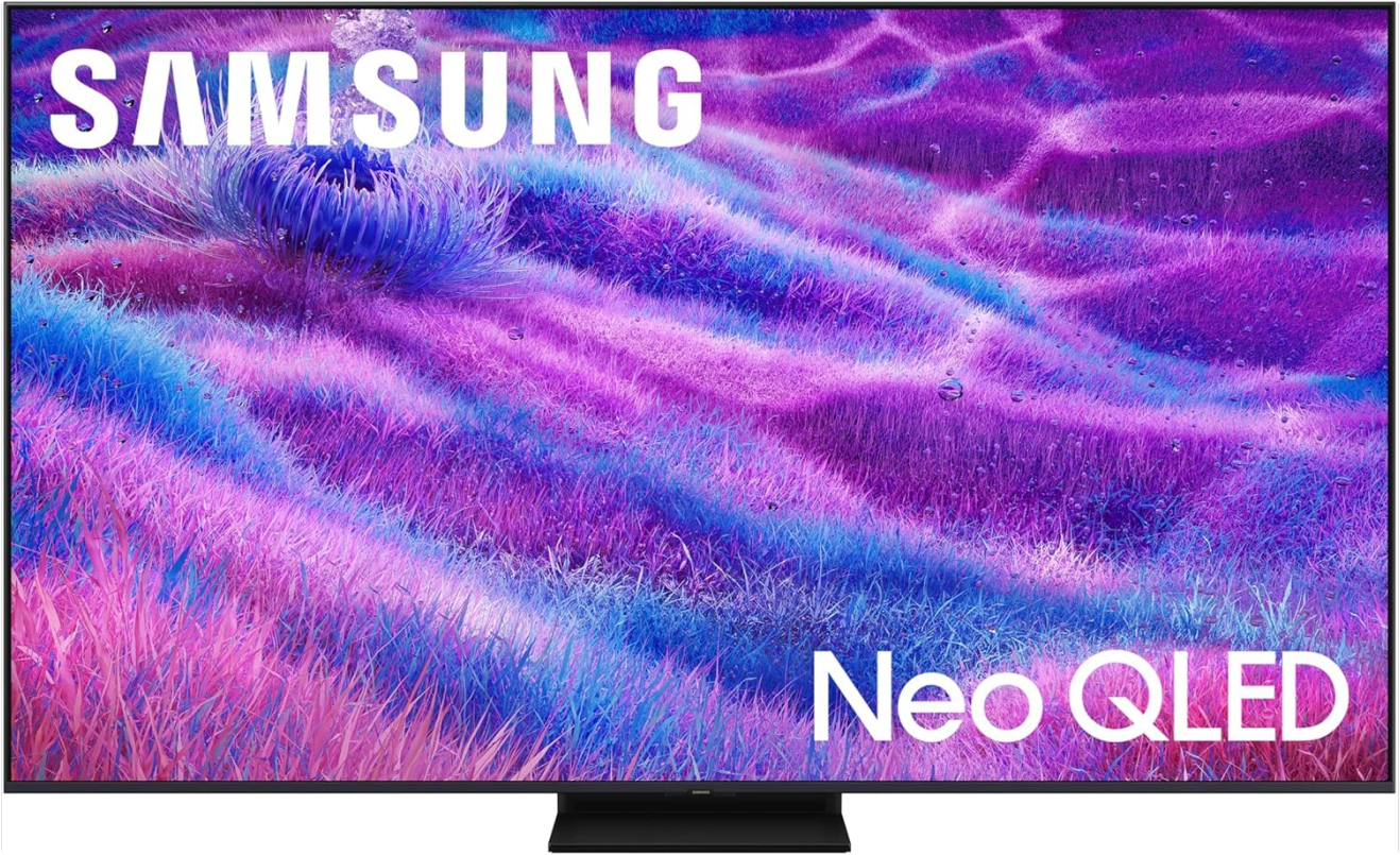
Figure 3.1: Front view of the Samsung 65-inch Neo QLED 4K TV.

Carefully unpack the TV and place it on a stable surface or mount it securely to a wall. Ensure adequate ventilation around the TV. Connect the power cable to the TV and a power outlet. Connect your external devices (e.g., cable box, gaming console) to the TV's HDMI ports.