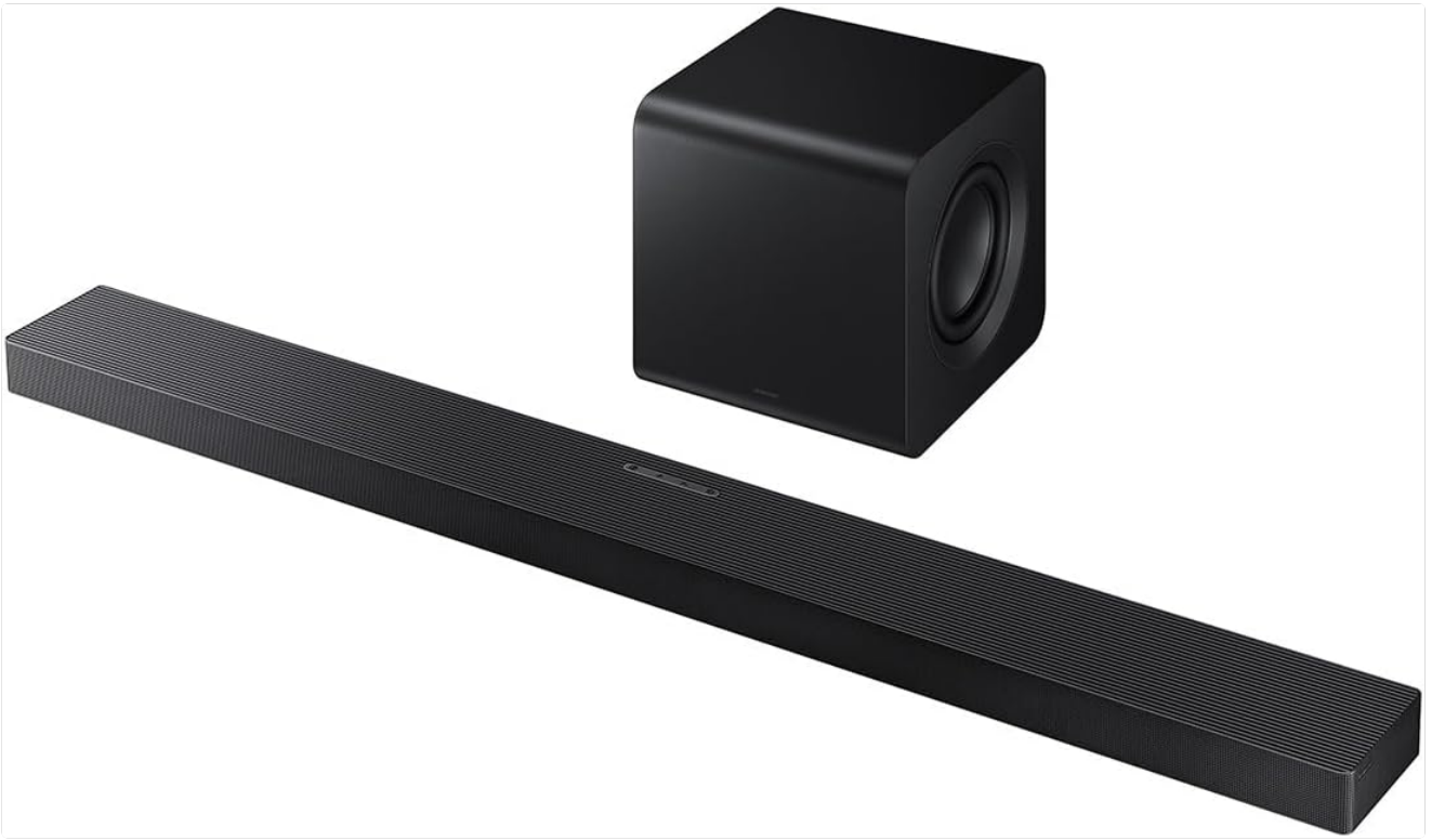
Figure 3.3: The Samsung HW-QS700F Soundbar and its wireless Subwoofer.