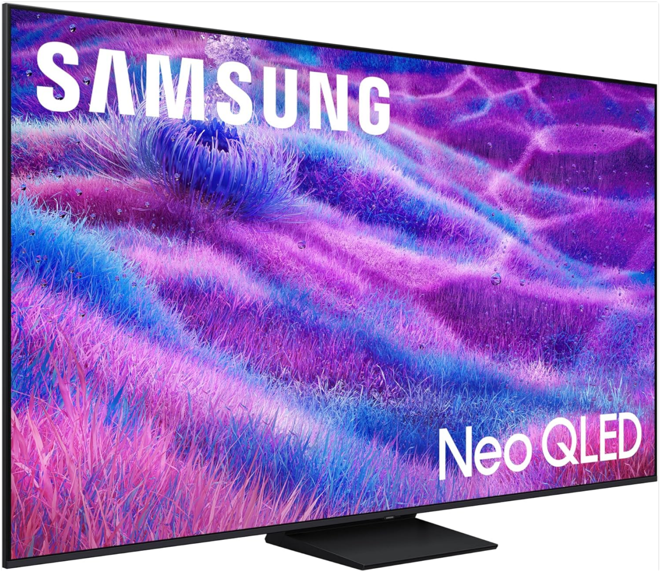
Figure 3.2: Angled view of the Samsung 65-inch Neo QLED 4K TV, showcasing its slim design.