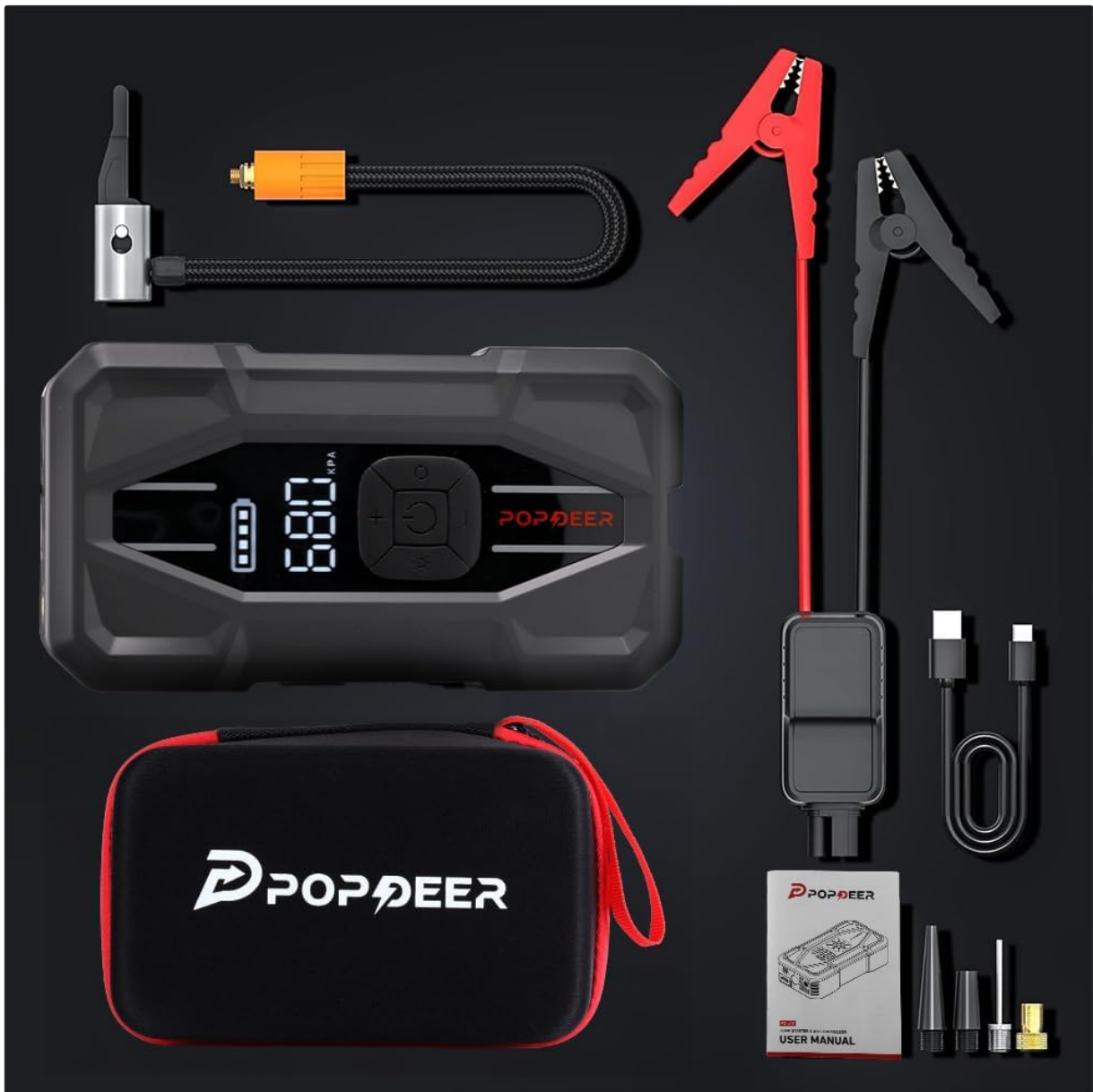
Figure 2: Package Contents