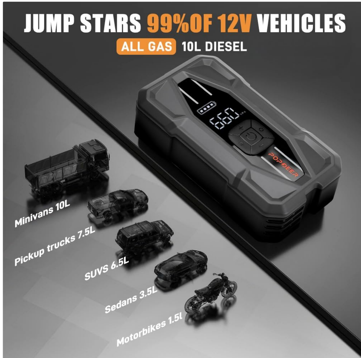
Figure 5: Vehicle Compatibility

Your browser does not support the video tag.