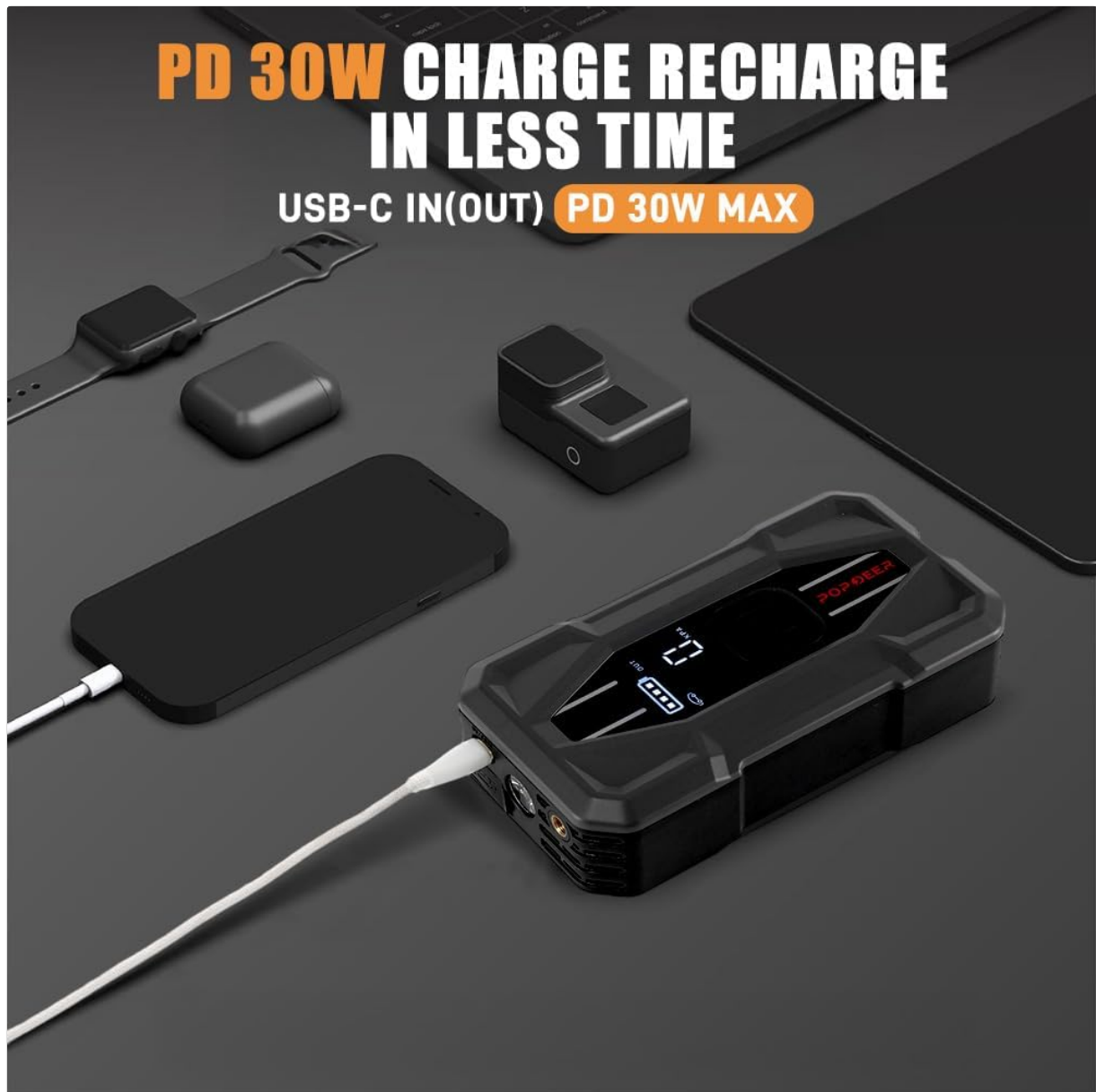
Figure 7: Charging External Devices

2. The PD-JA5 will automatically begin charging your device.