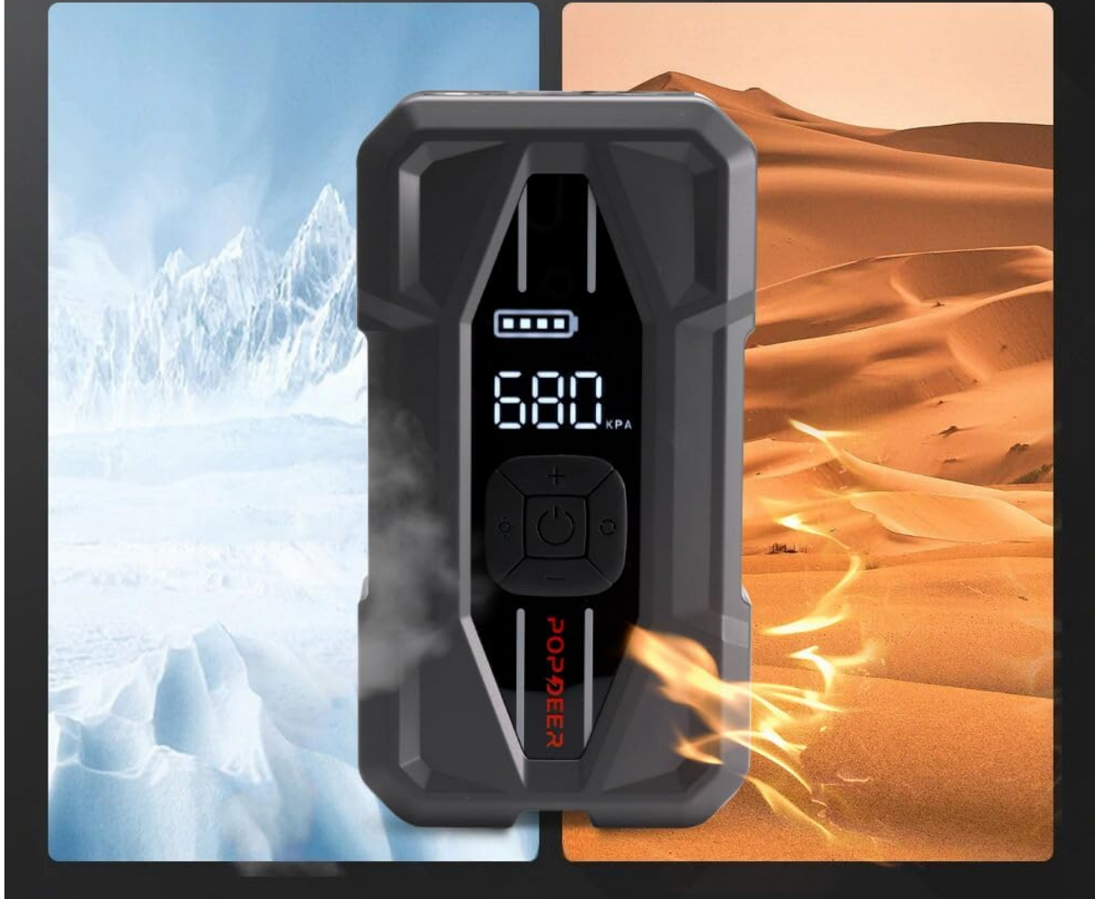
Figure 8: Working Temperature Range