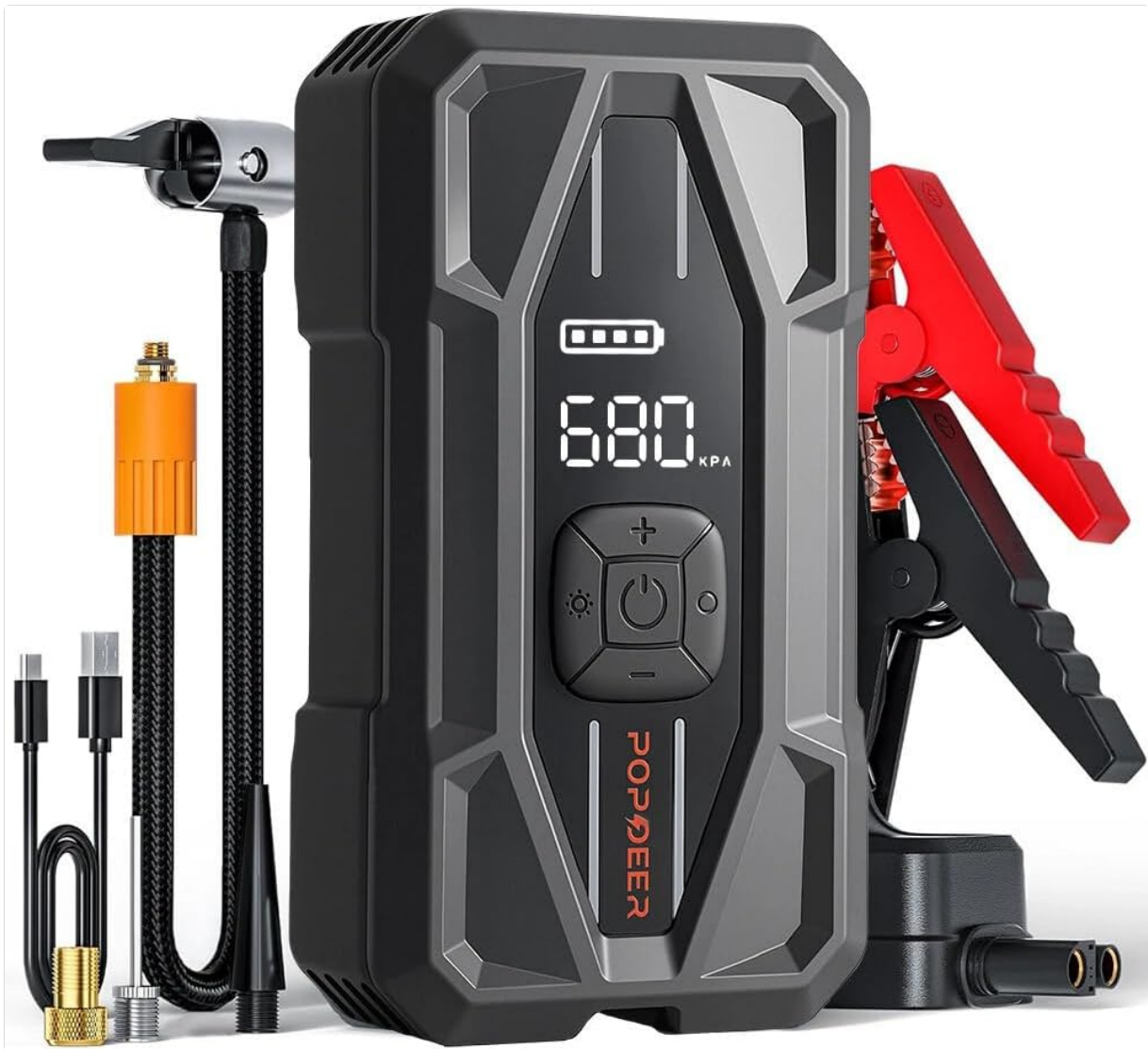
Figure 3: POPDEER PD-JA5 Main Unit