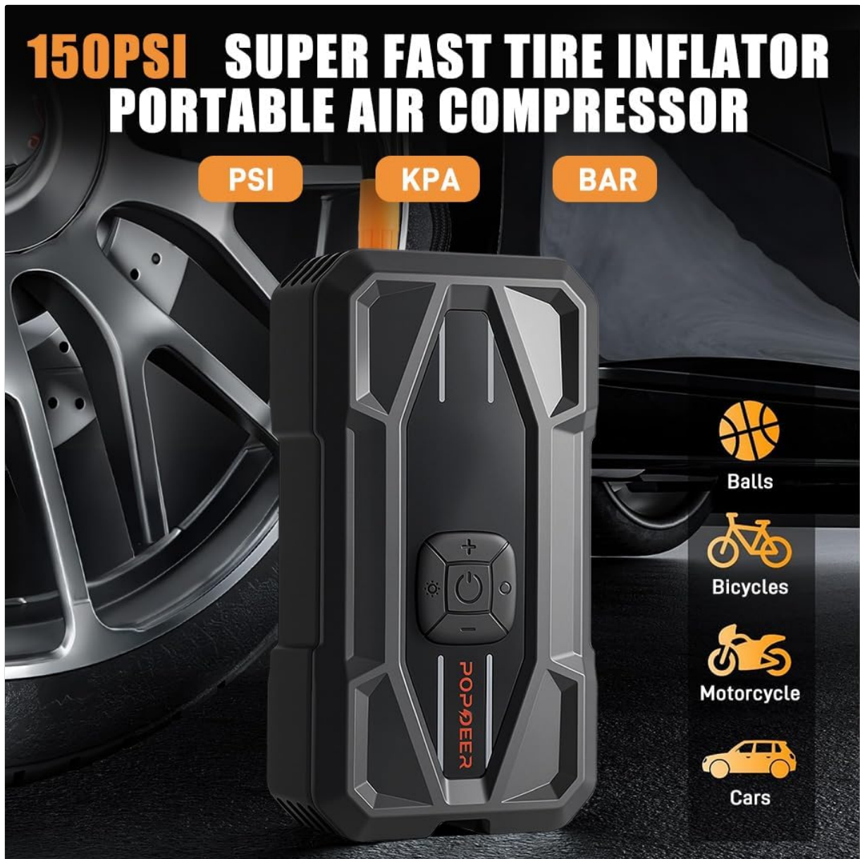
Figure 6: Air Compressor Modes and Units

6. Disconnect the hose from the tire valve and then from the PD-JA5.