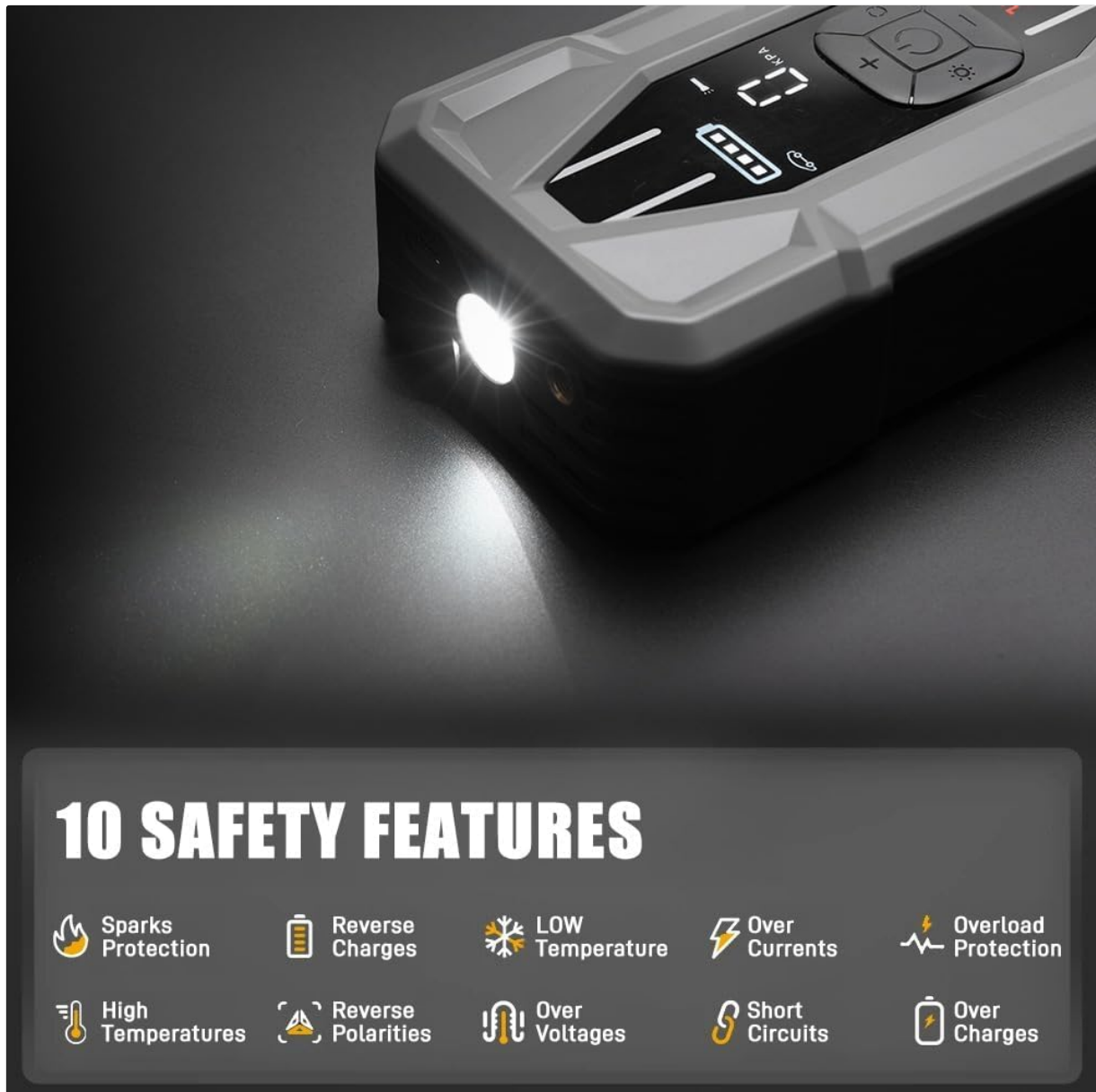
Figure 1: POPDEER PD-JA5 10 Safety Features