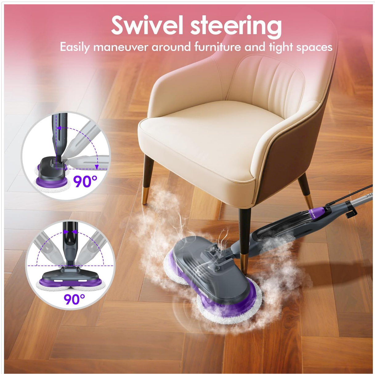
Figure 4: Swivel steering capability of the steam mop. The image illustrates the mop head pivoting to navigate around obstacles.