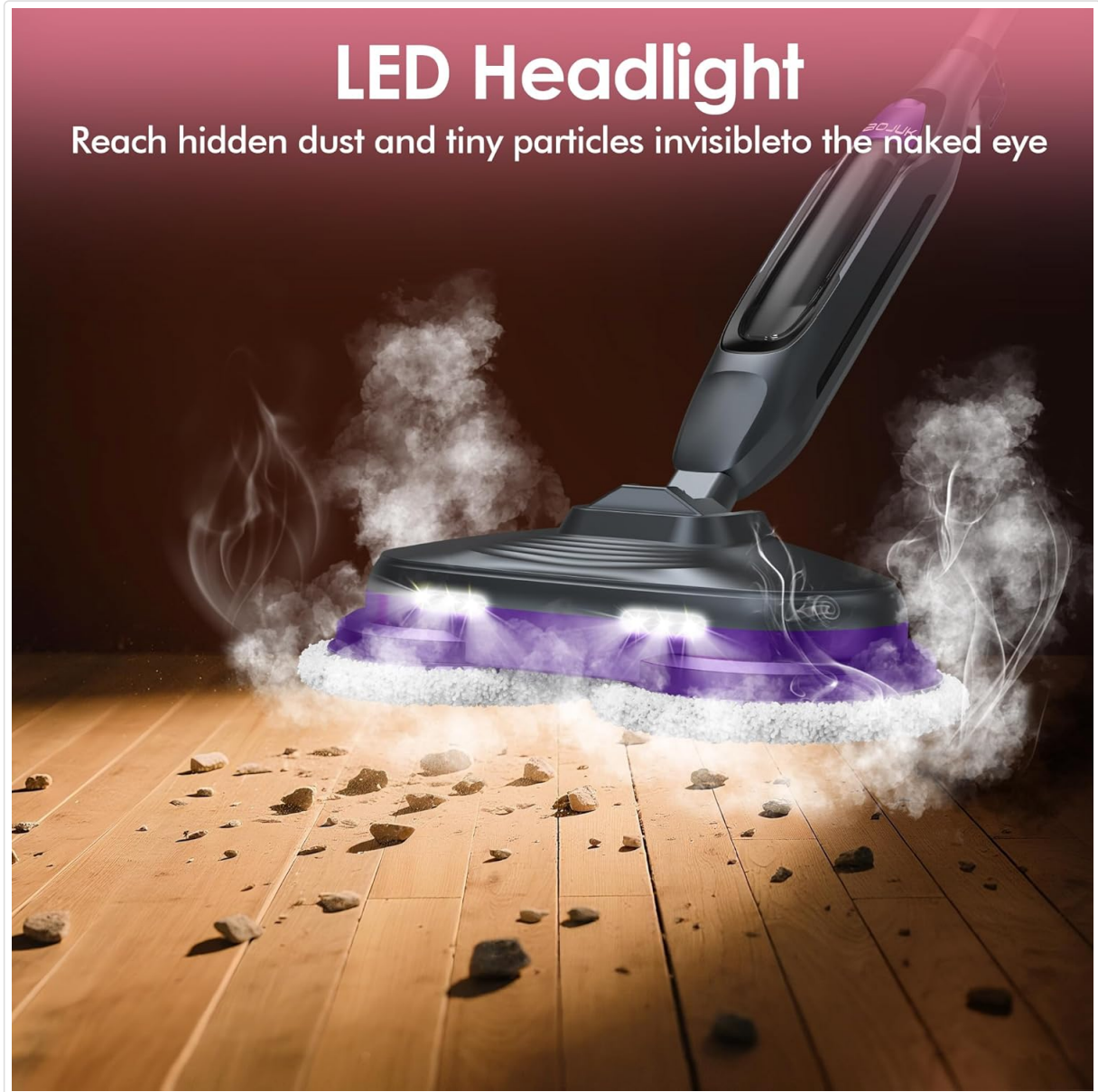
Figure 3: The steam mop in operation, highlighting the LED headlights. This image demonstrates the mop cleaning a floor, with its LED lights illuminating the path.