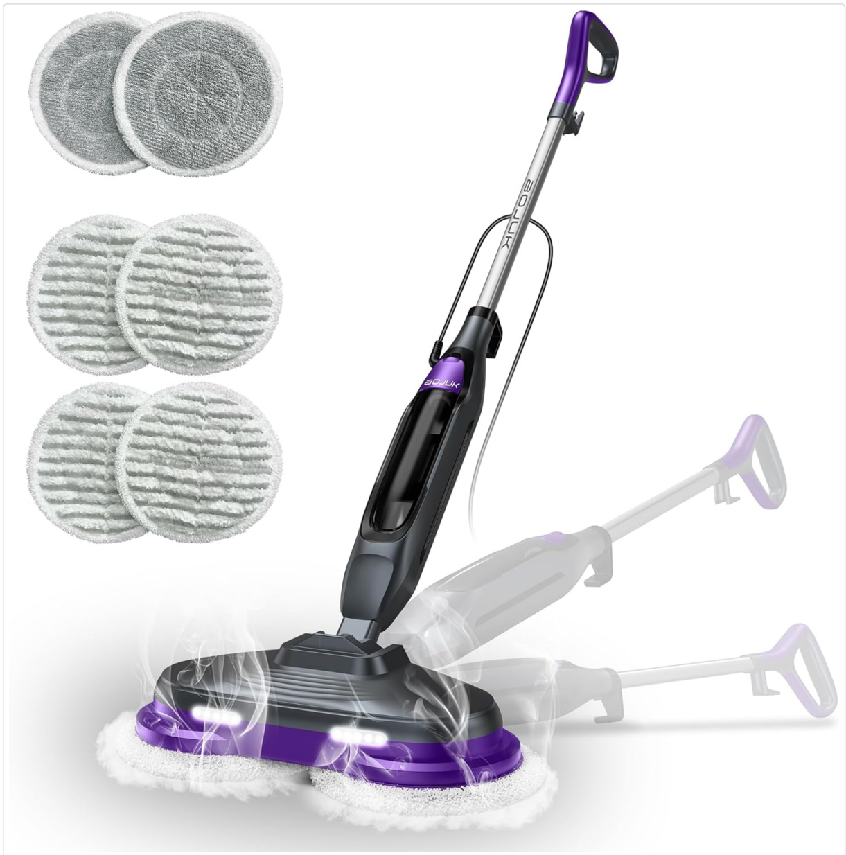
Figure 1: BOJUK Scrub & Steam Mop F2-D2 and accessories. This image displays the main unit of the steam mop along with six reusable mop pads.