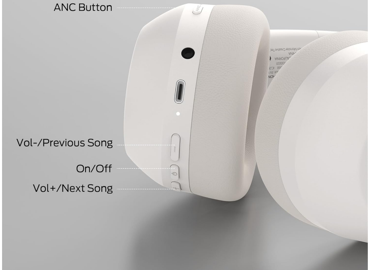
Image: Right earcup controls of the Monster Persona 6th ANC headphones.