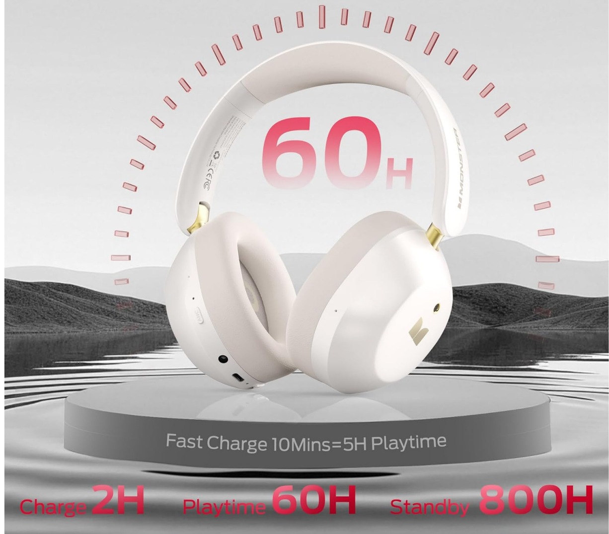
Image: Headphones indicating long battery life and rapid charging capability.