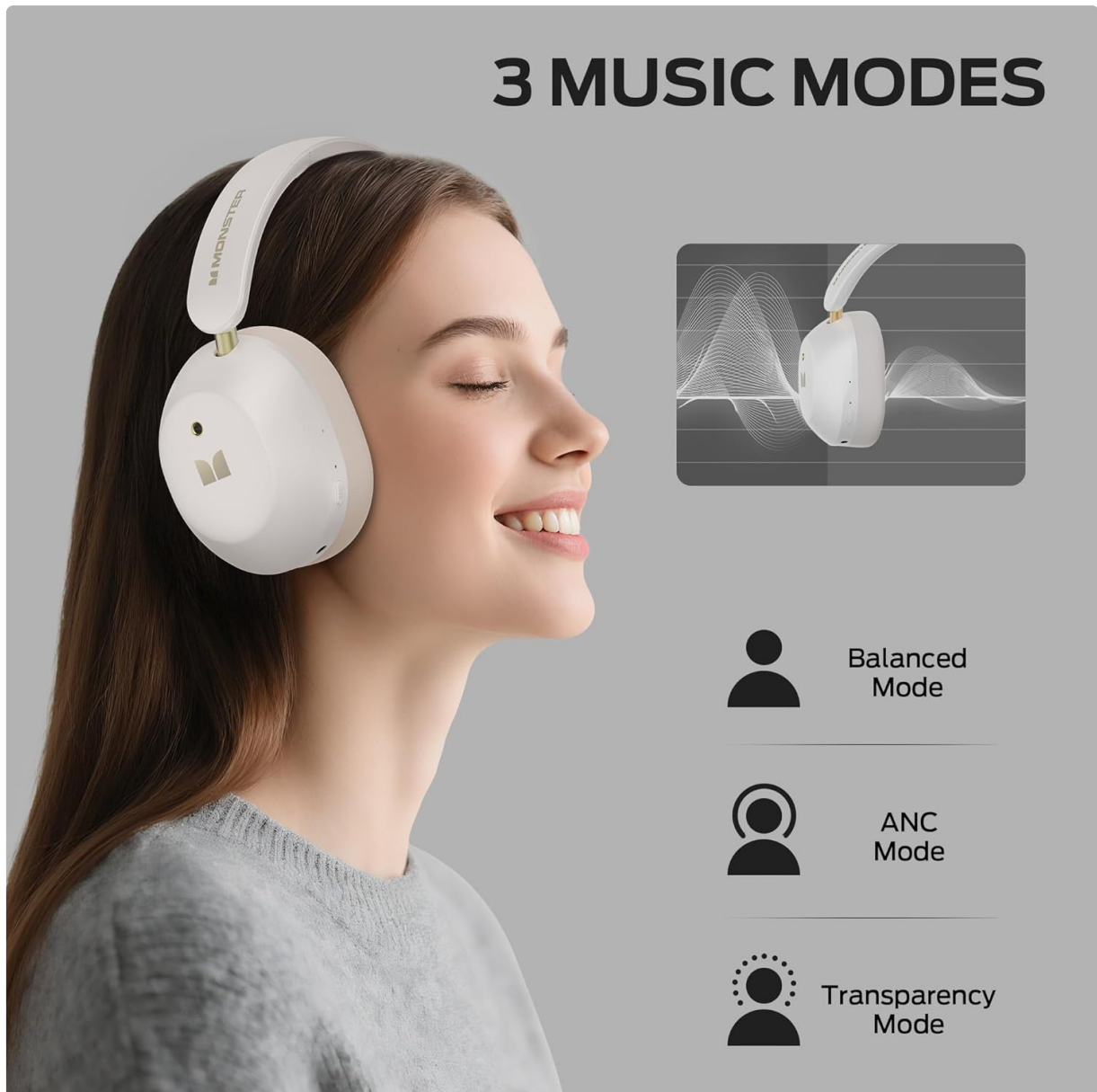
Image: Visual representation of the three available music modes.

The headphones feature three distinct music modes to adapt to your environment. Press the ANC button once to cycle through these modes: