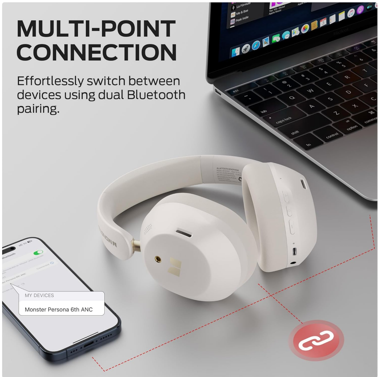
Image: Headphones demonstrating multi-point Bluetooth connection to a phone and laptop.

Effortlessly switch between devices using dual Bluetooth pairing.