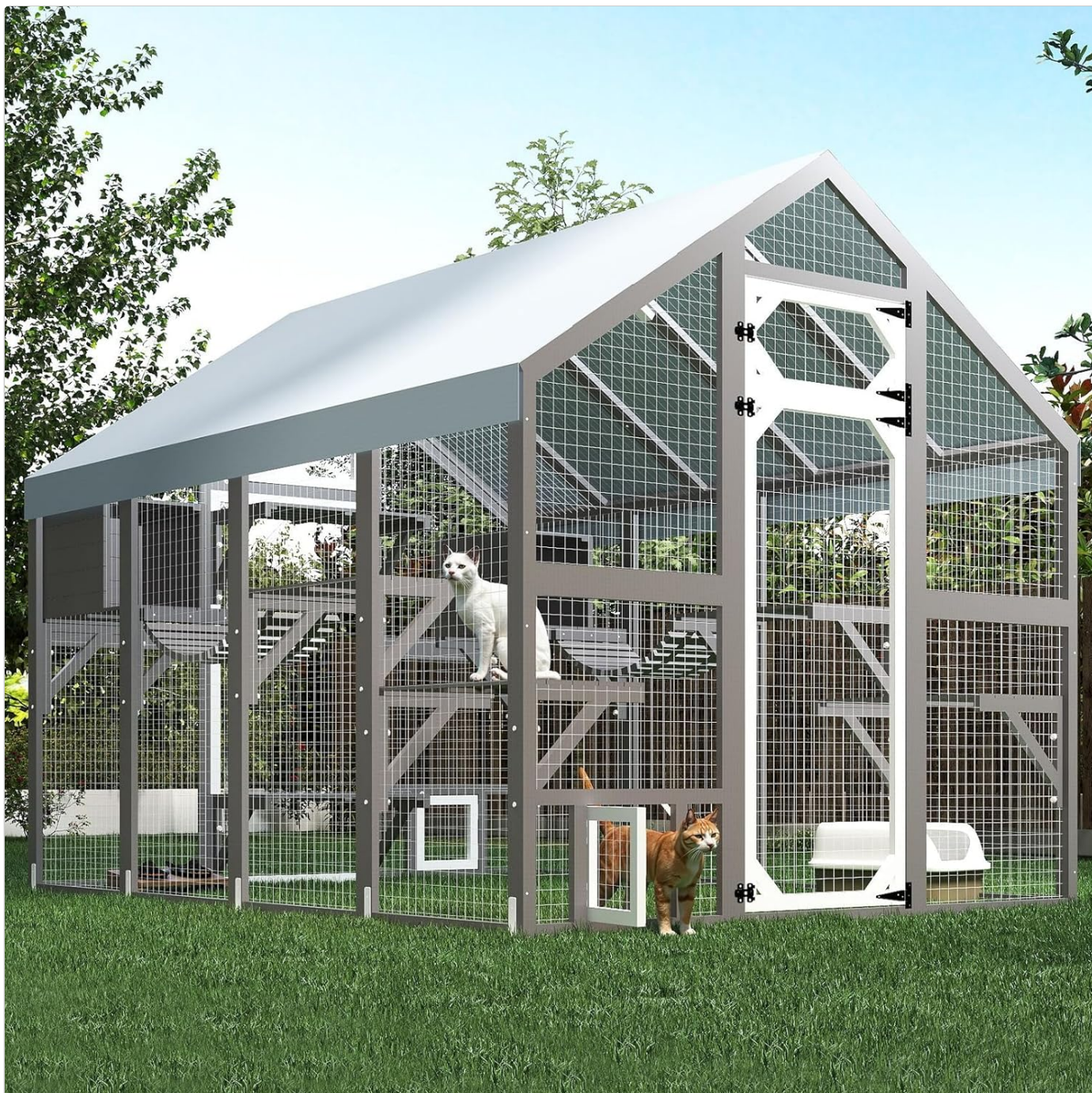
Figure 1.1: The Magazoopet Extra Large Catio, showcasing its spacious design and integrated features.