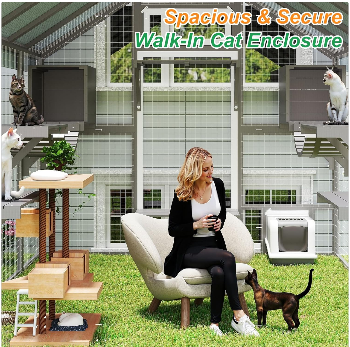
Figure 8.1: The spacious interior with multiple platforms and resting areas.