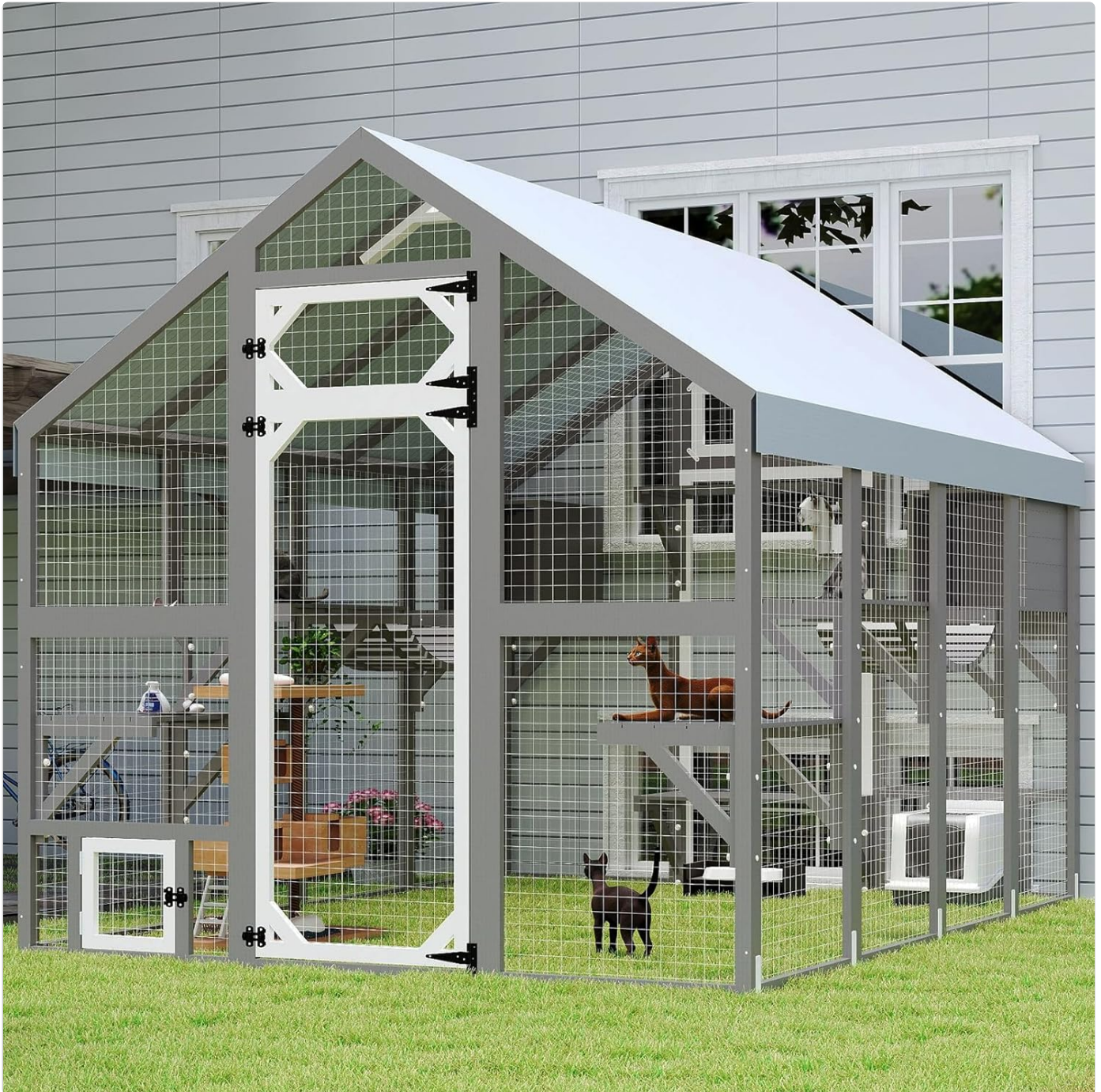
Figure 4.1: The assembled patio, highlighting its spacious interior and walk-in access.