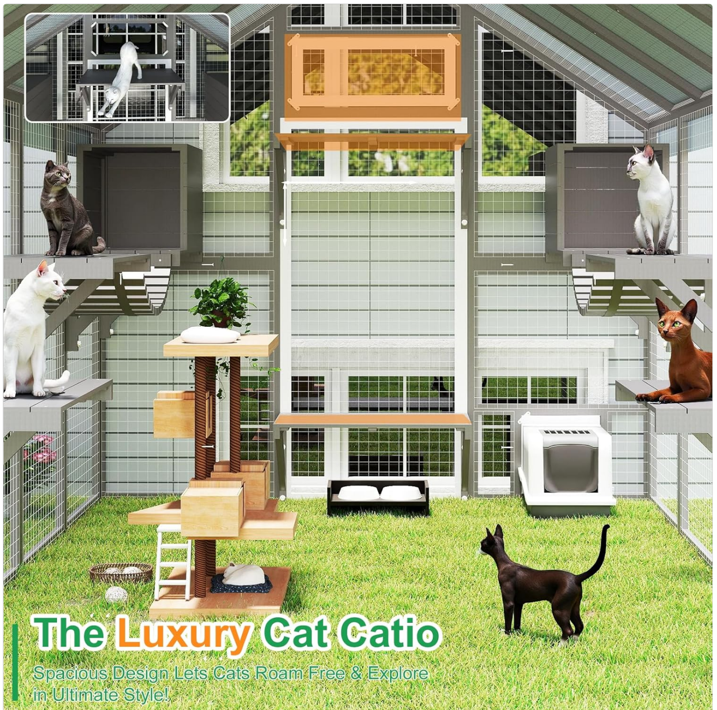
Figure 4.2: An interior perspective of the catio, illustrating the multi-level design with platforms and resting areas.