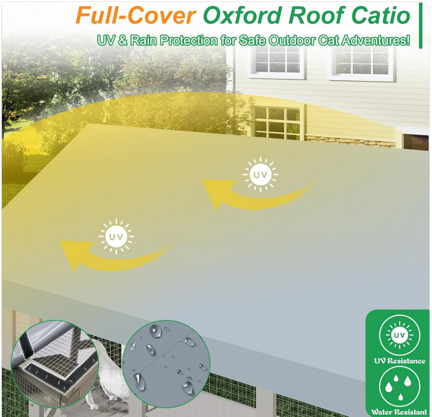
Figure 6.1: The full-cover Oxford roof provides UV and rain protection.

UV & Rain Protection for Safe Outdoor Cat Adventures!