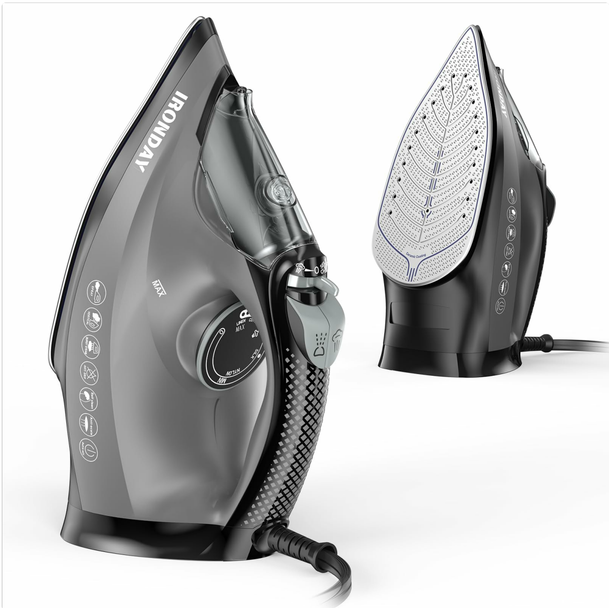
The IRONDAY 1800W Steam Iron, designed for efficient wrinkle removal.