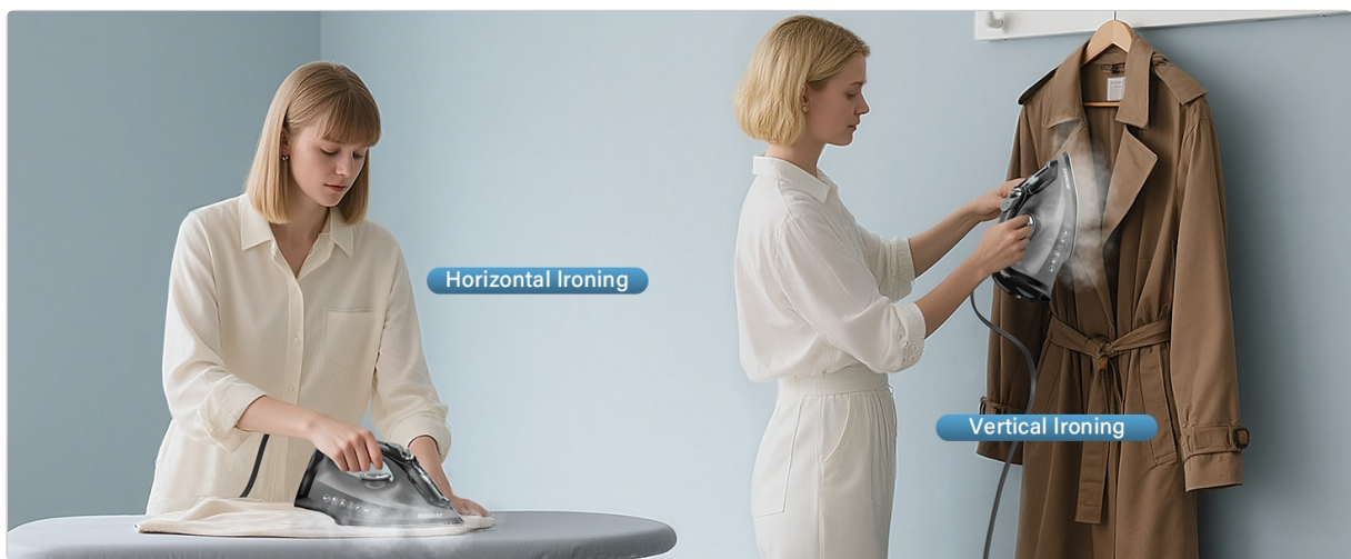
The iron supports both traditional horizontal ironing and convenient vertical steaming.