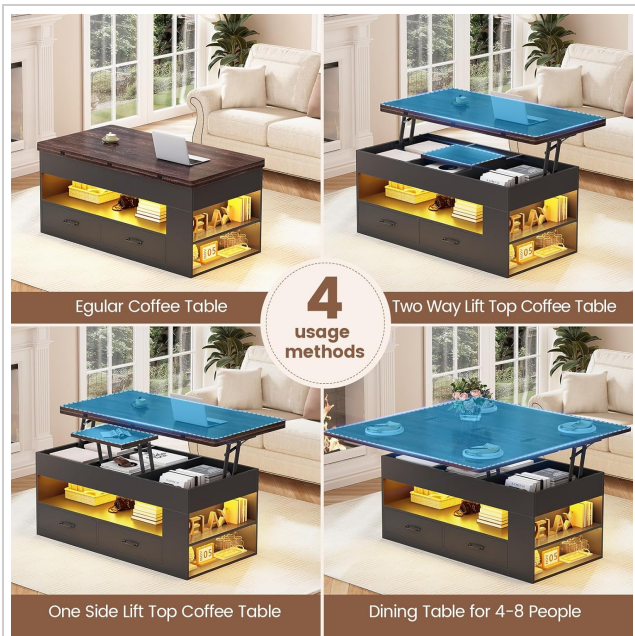
Image: 4 Usage Methods

This image illustrates the four primary configurations of the coffee table: Regular Coffee Table, Two-Way Lift Top Coffee Table, One-Side Lift Top Coffee Table, and Dining Table for 4-8 People. The lift-top mechanism allows for versatile use.