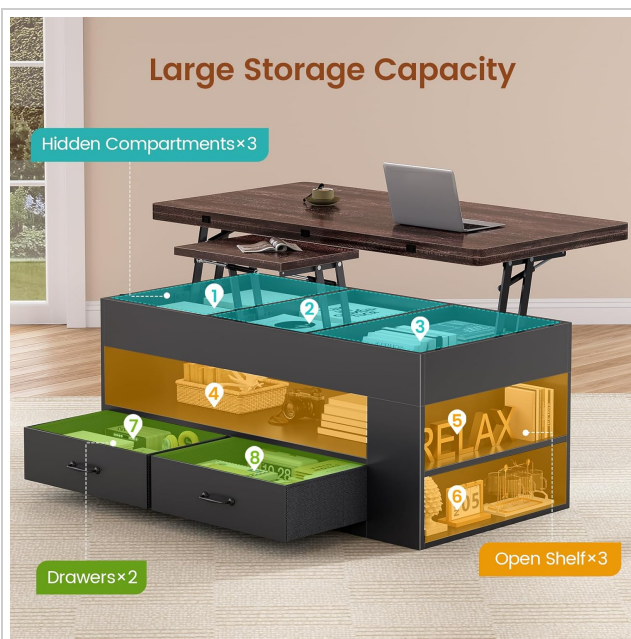
Image: Large Storage Capacity Diagram

This diagram illustrates the various storage options: three hidden compartments beneath the lift-top, two fabric drawers, and three open shelves. Utilize these areas to organize blankets, snacks, electronics, books, and other household items.