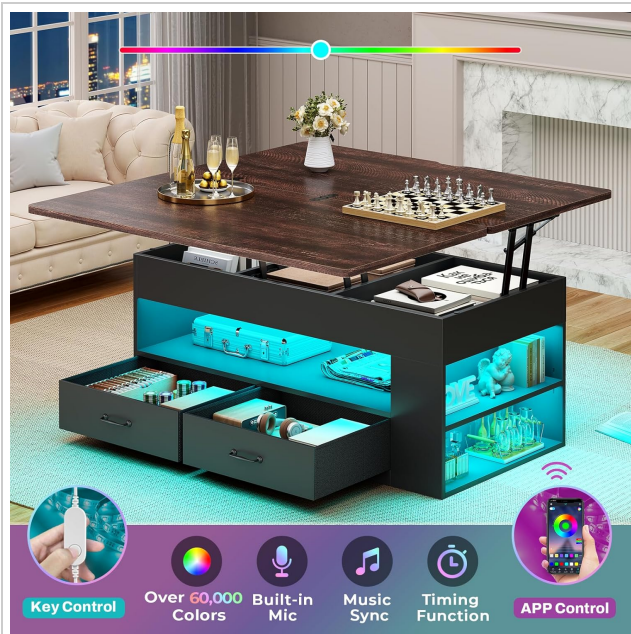
Image: LED Light Features

This image highlights the key features of the integrated LED lighting system, including key control, over 60,000 colors, built-in microphone for music sync, and timing functions, all controllable via a mobile application.