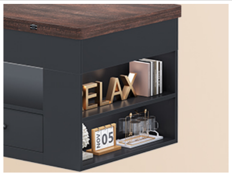
Image: Open Shelf Storage

This image displays one of the fabric drawers, shown filled with various small items like notebooks and cosmetics. Insert the two fabric drawers into their respective compartments in the table base. The open shelves can be used for decorative items or additional storage.