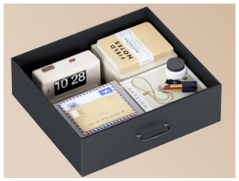
Image: Fabric Drawer

This image displays one of the fabric drawers, shown filled with various small items like notebooks and cosmetics. Insert the two fabric drawers into their respective compartments in the table base. The open shelves can be used for decorative items or additional storage.