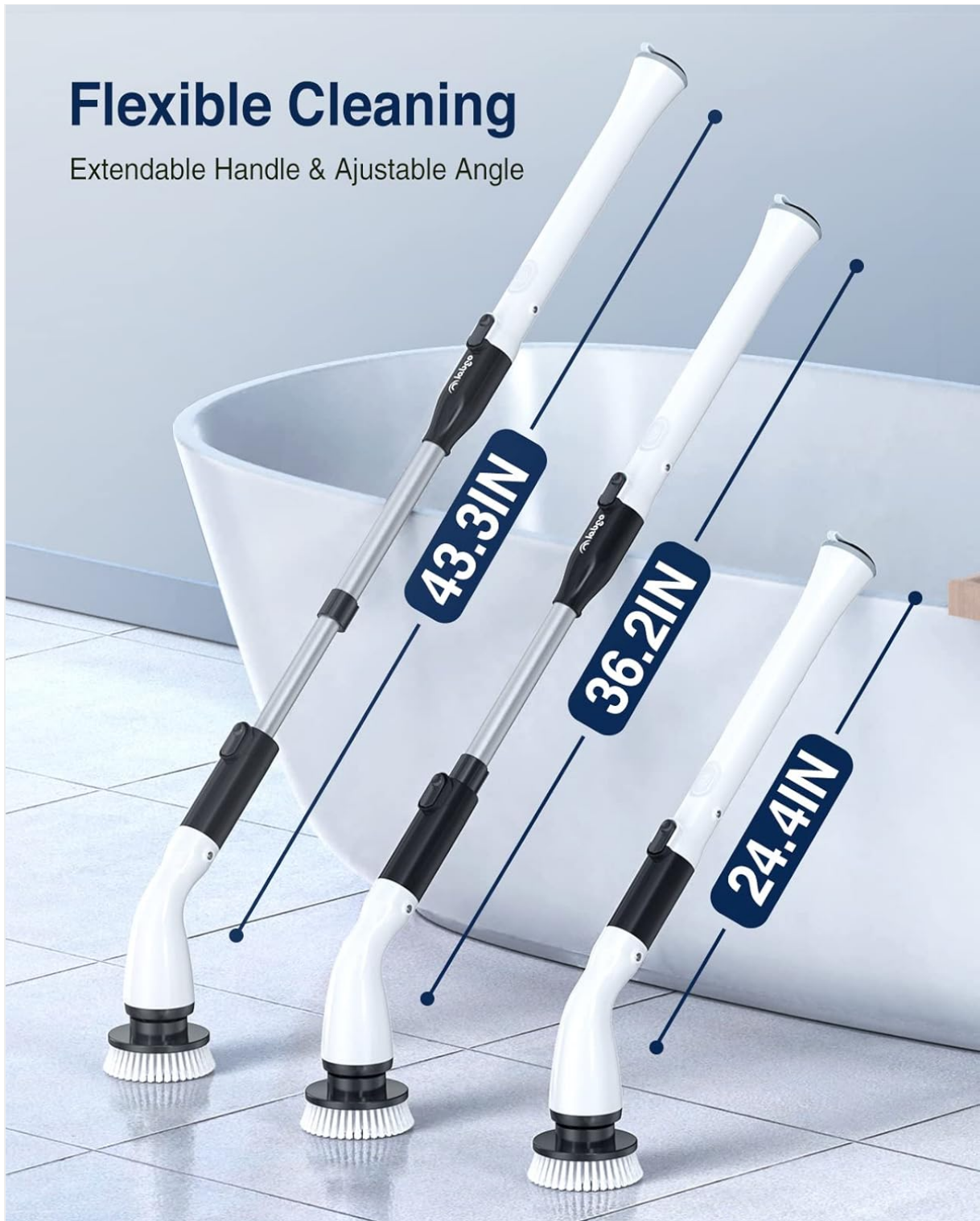
Image 3.1: The electric spin scrubber illustrating its flexible, extendable handle with three distinct length options for reaching various areas.