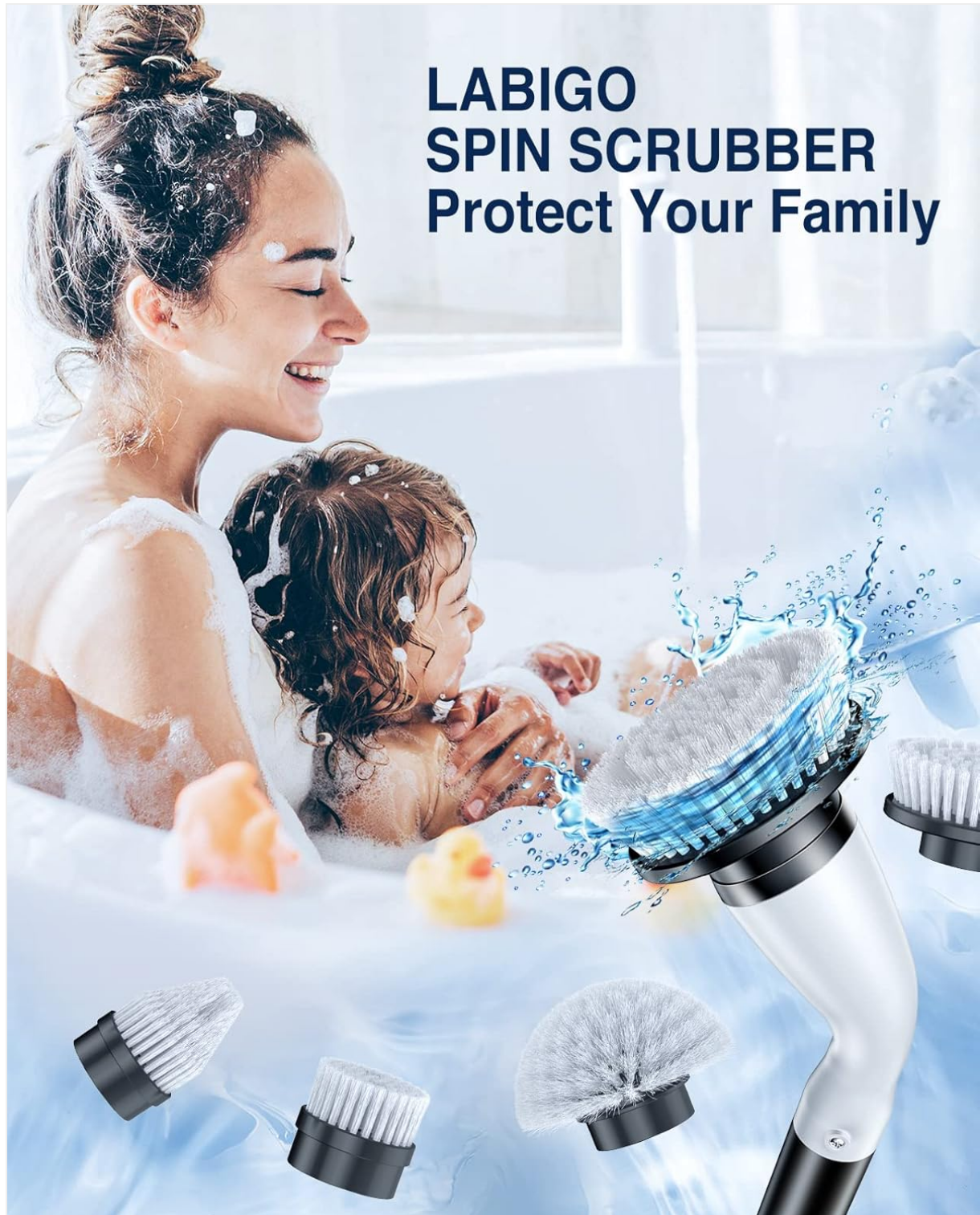
Image 5.1: The electric spin scrubber showcasing its interchangeable brush heads, highlighting its adaptability for various cleaning needs around the home.