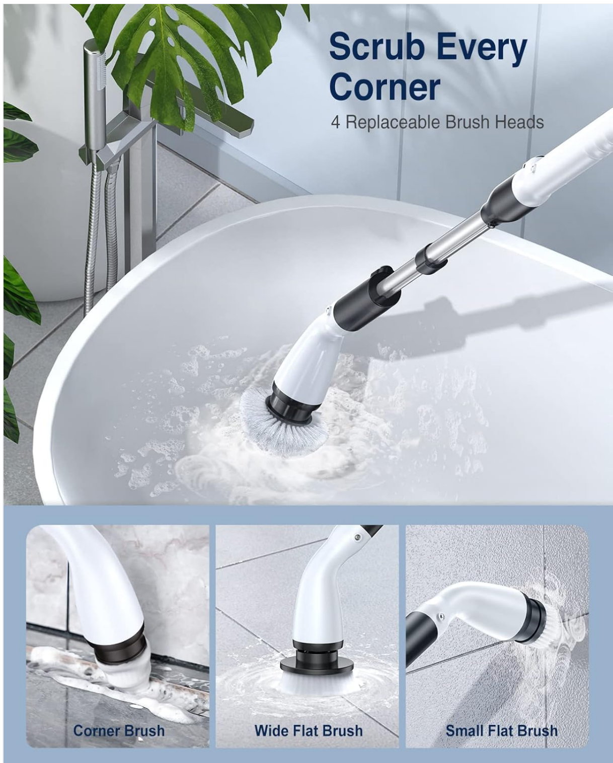
Image 2.1: The electric spin scrubber positioned in a bathtub, with an inset displaying the three distinct brush heads included for various cleaning tasks.