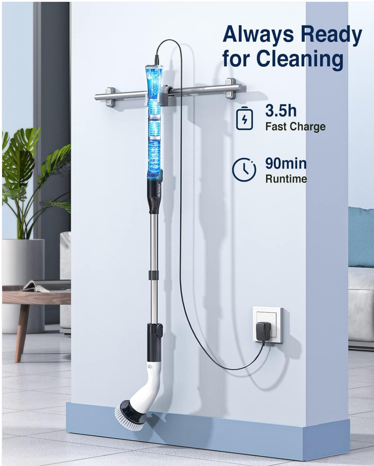
Image 4.1: The electric spin scrubber shown plugged into a wall outlet for charging, ready for use after its fast charge cycle.