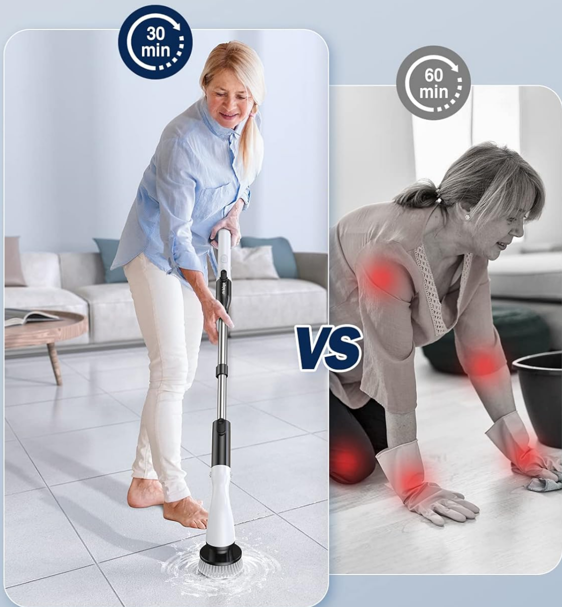
Image 1.2: A visual comparison showing the ease of cleaning with the LABIGO Electric Spin Scrubber versus traditional manual scrubbing, emphasizing reduced effort.