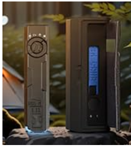
Figure 3: The lock/unlock button on the side of the flashlight.