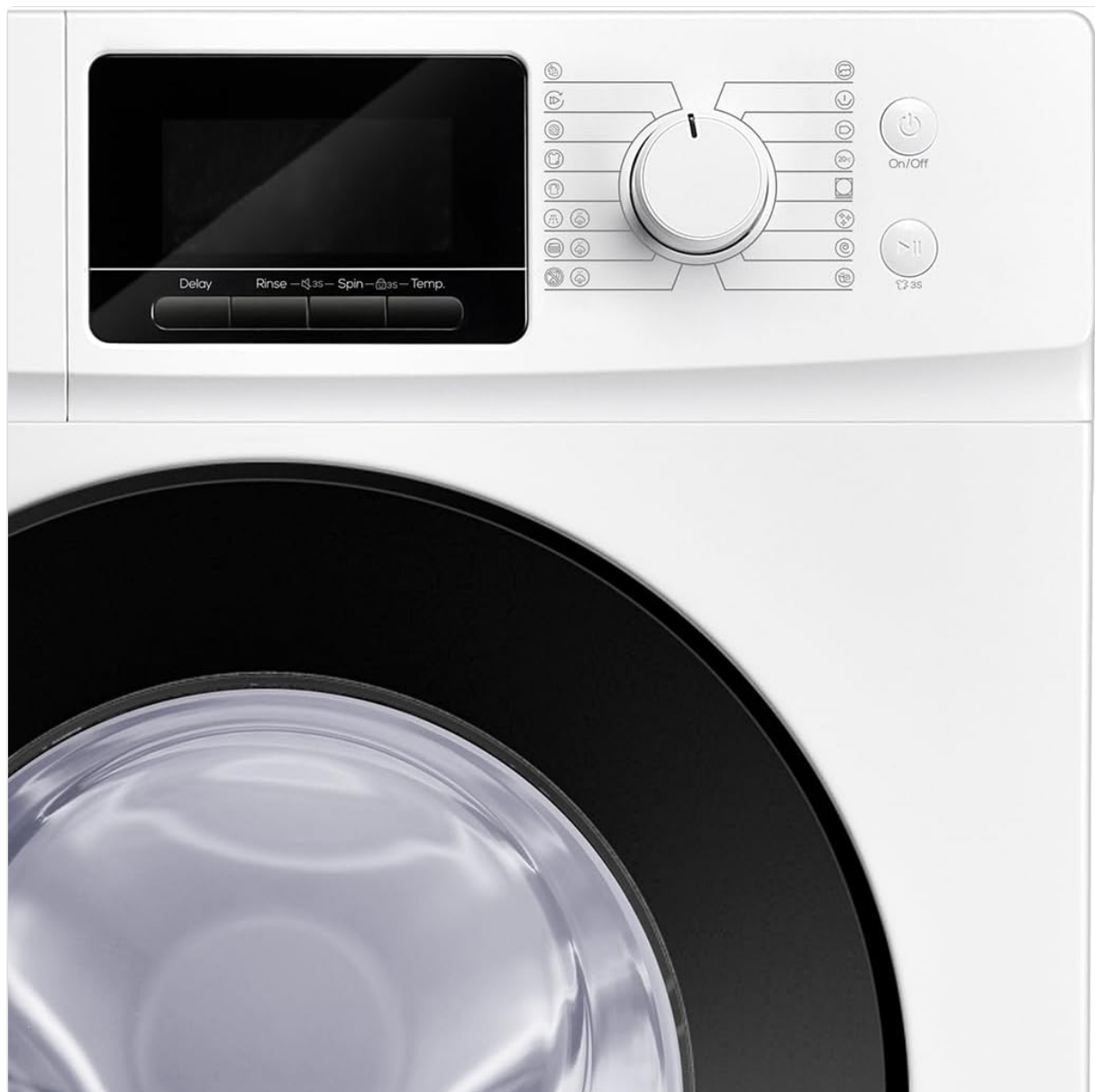
Image: Close-up of the Aspes AL9403AIDV washing machine control panel, showing the program selector knob, digital display, and various function buttons for delay, rinse, spin, and temperature settings.