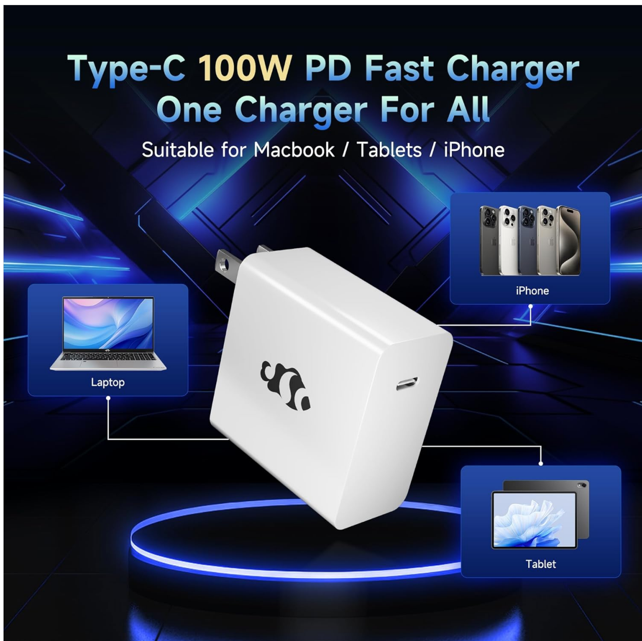
Image: The 100W Type-C PD Fast Charger, compatible with various devices.