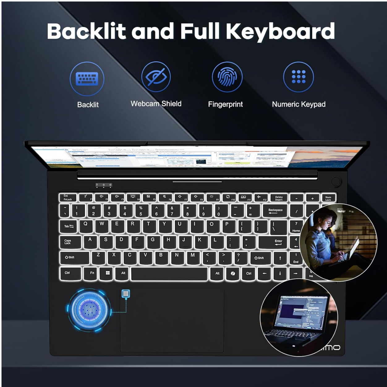
Image: Close-up of the backlit keyboard and numeric keypad.

The NIMO laptop features a full-size backlit keyboard with a numeric keypad for enhanced productivity.