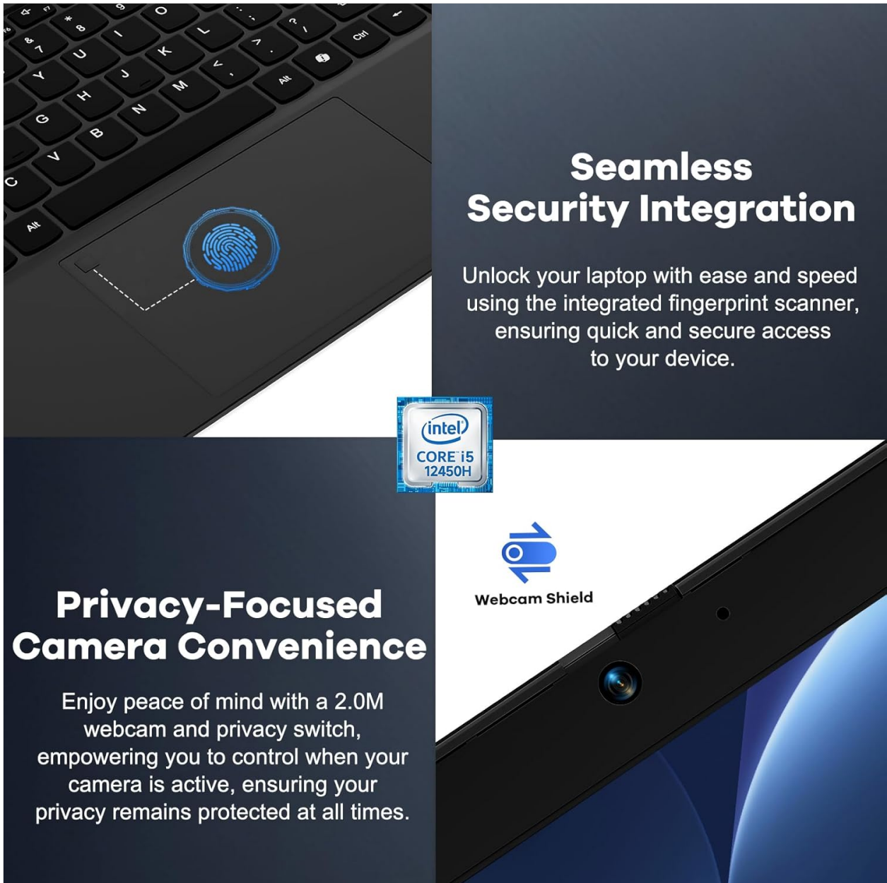
Image: Details of the integrated fingerprint reader and the webcam with its privacy cover.