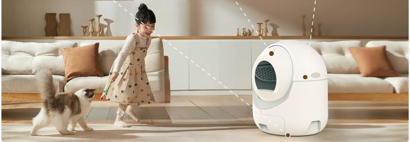
Image: A diagram showcasing three key safety features: "Safe induction motor device protection," "Physical separation anti-clip device," and "Gravity sensing device tap and stop," with an illustration of a child and cat near the unit, emphasizing safety.