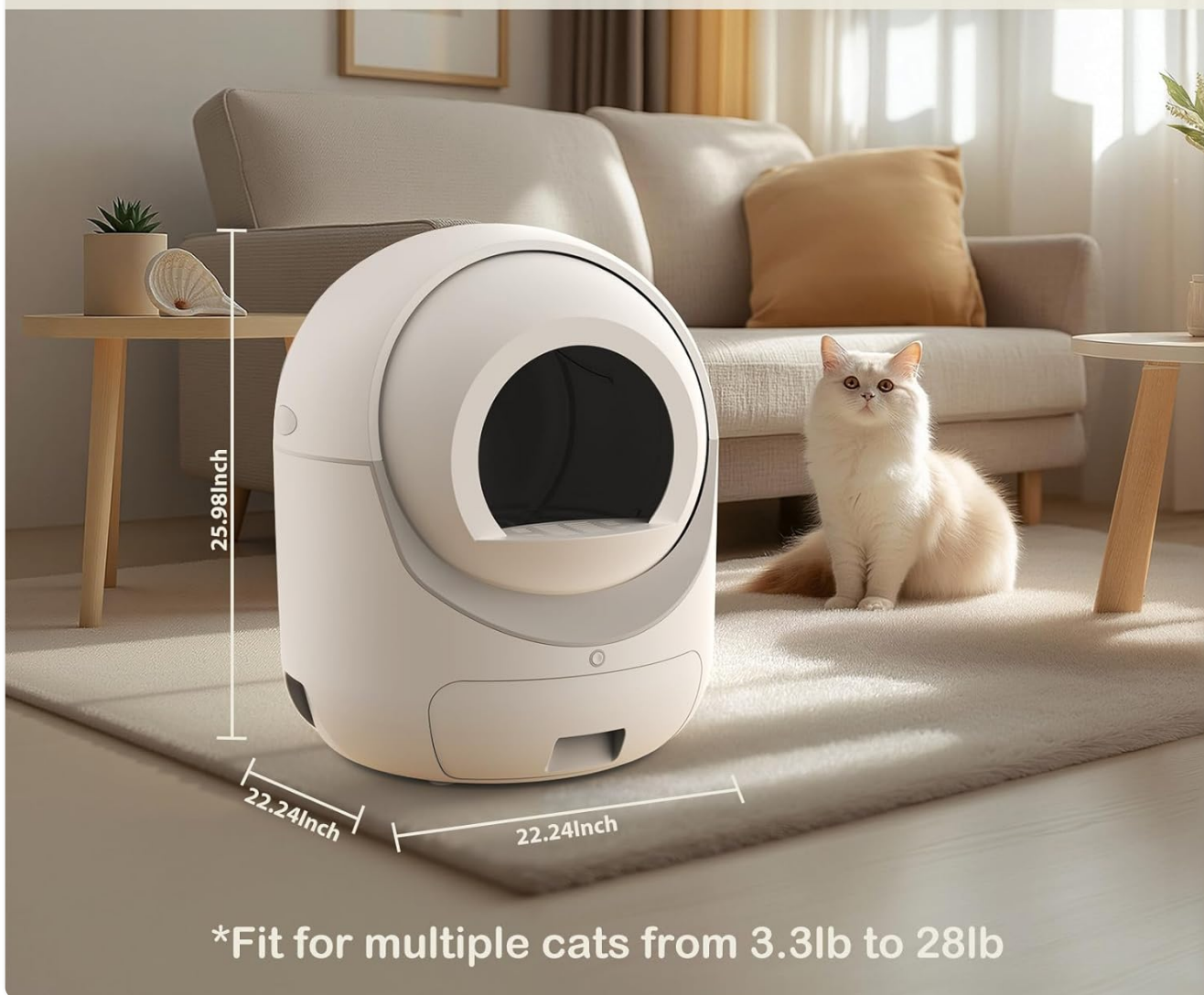
Image: The BCHARYA Self-Cleaning Litter Box displayed in a living room setting with dimensions (22.24 inches width/depth, 25.98 inches height) highlighted, emphasizing its extra-large capacity suitable for multiple cats.