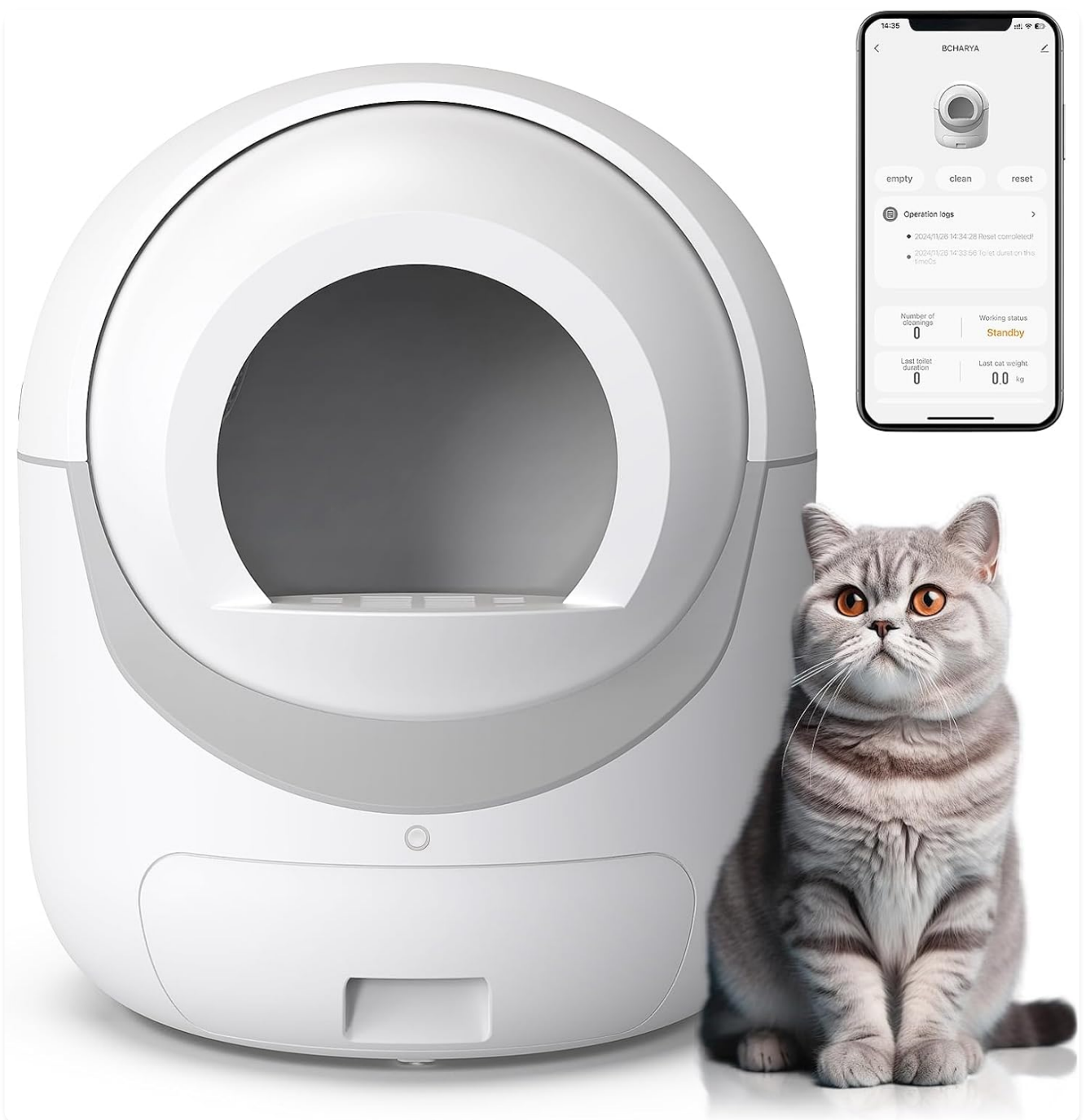
Image: The BCHARYA Self-Cleaning Litter Box in white, shown next to a cat, with a smartphone displaying the companion app's interface. This illustrates the product's design and smart features.