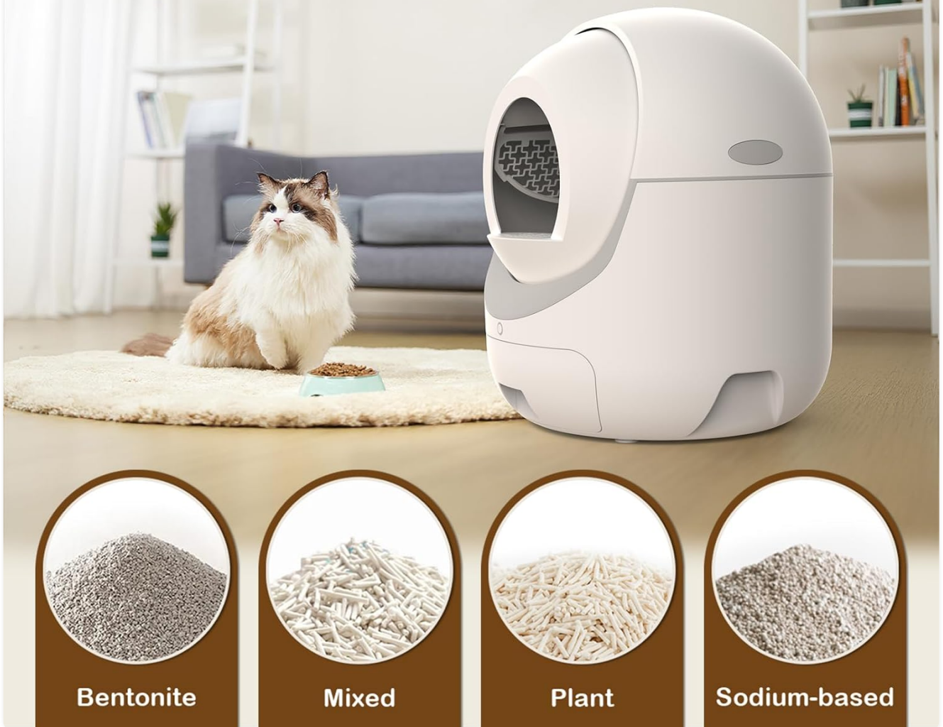
Image: The BCHARYA Self-Cleaning Litter Box shown with four types of cat litter: Bentonite, Mixed, Plant, and Sodium-based, illustrating its compatibility with various litter materials.