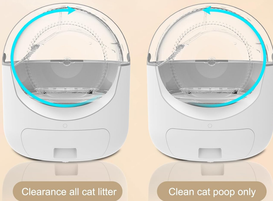
Image: Two diagrams illustrating the drum's rotation for different cleaning functions. The left diagram shows a full left rotation for "Clearance all cat litter" (long press 7 seconds), and the right diagram shows a right rotation for "Clean cat poop only" (long press 3 seconds).

Long press for 7 seconds to turn left to clear the drum, making it easy to replace all cat litter. Long press for 3 seconds to turn right to clear the litter.