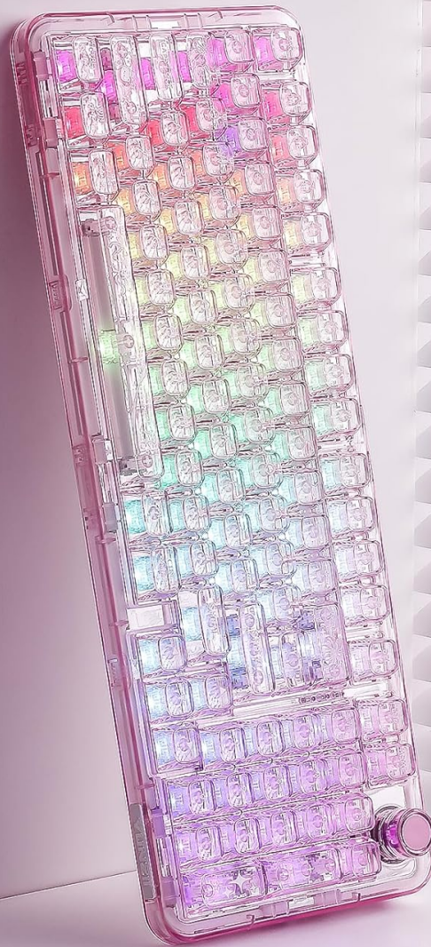
Image: Overview of the YUNZII X98 keyboard highlighting its main features such as 96% layout, tri-mode connectivity, 8000 mAh battery, hot-swappable switches, QMK/VIA programmability, multi-function knob, full RGB, and gasket structure.