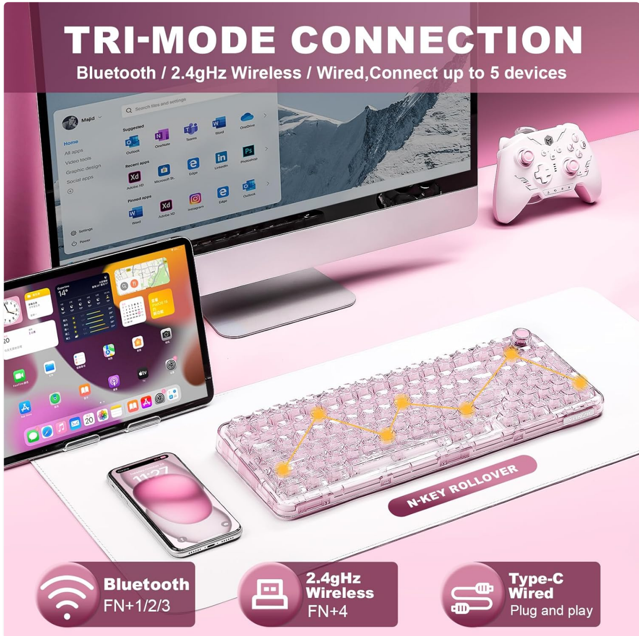
Image: The YUNZII X98 keyboard connected to multiple devices via Bluetooth, 2.4GHz wireless, and USB-C wired modes, illustrating its tri-mode connectivity.

The YUNZII X98 supports three connection modes: Wired, 2.4GHz Wireless, and Bluetooth. Use the mode switch located on the side of the keyboard to select your desired connection type.