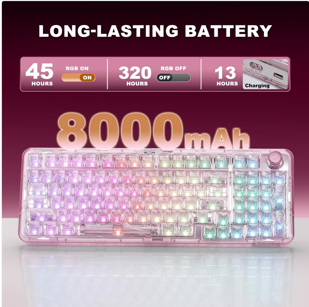
Image: Illustrates the battery life of the YUNZII X98 keyboard, showing 45 hours with RGB on, 320 hours with RGB off, and 13 hours for charging, powered by an 8000 mAh battery.

The keyboard comes with a built-in 8000 mAh battery. For optimal performance, fully charge the keyboard before first use. Connect the provided USB-C cable to the keyboard's USB-C port and the other end to a power source (e.g., computer USB port, wall adapter).