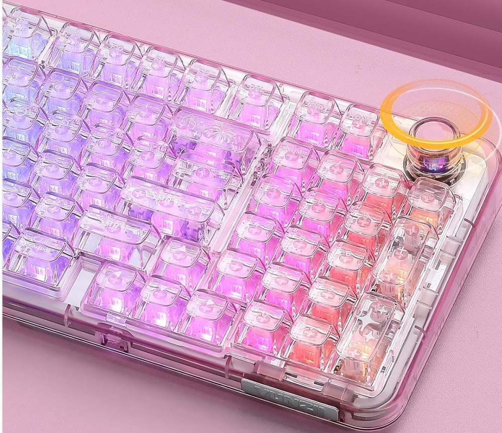
Image: A close-up of the YUNZII X98 keyboard's multi-function knob, detailing its controls for volume, mute, and RGB effect changes, along with QMK/VIA customization.