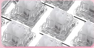
Mechanical Linear Switches