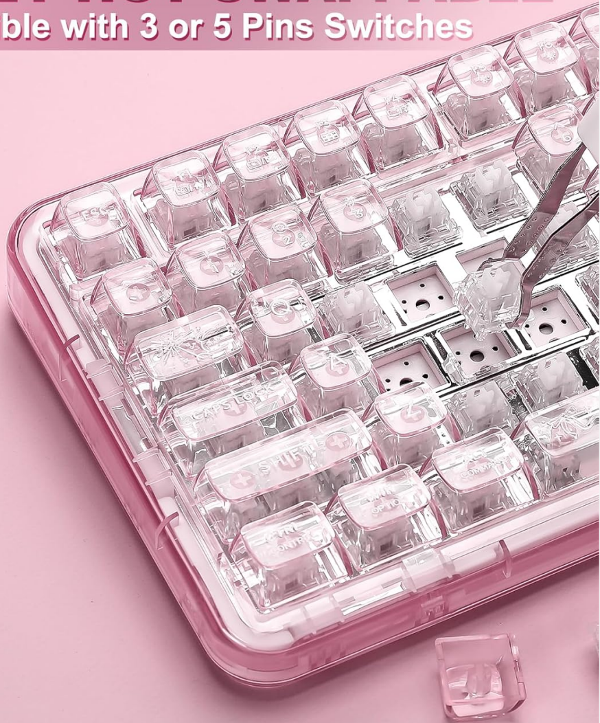
Image: A close-up view of the YUNZII X98 keyboard's hot-swappable sockets, demonstrating how switches can be easily removed and replaced, compatible with both 3-pin and 5-pin mechanical switches.