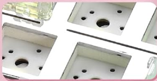
Hot Swappable Socket