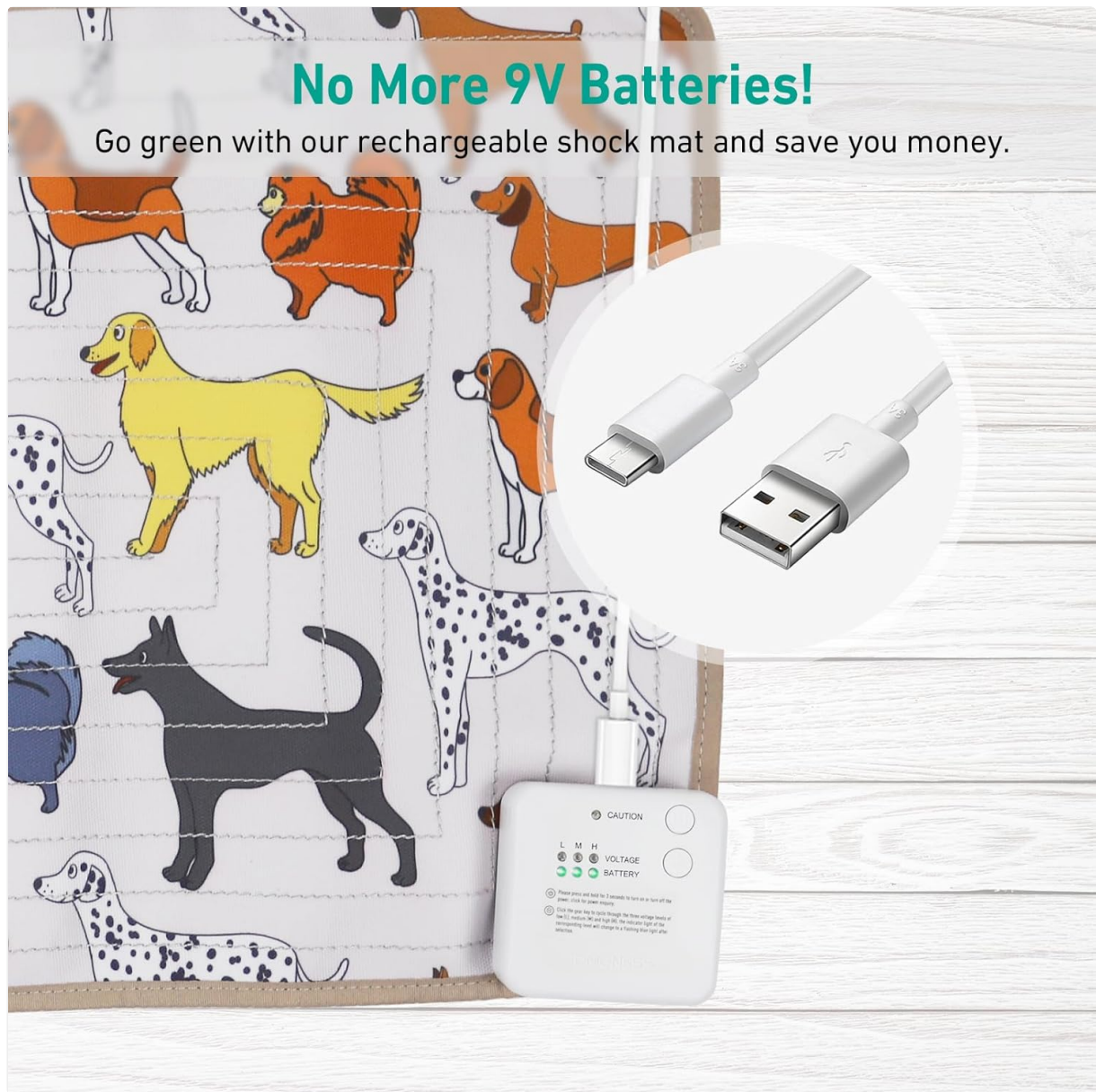
Image 5.1: The control unit features a rechargeable battery and USB charging port.