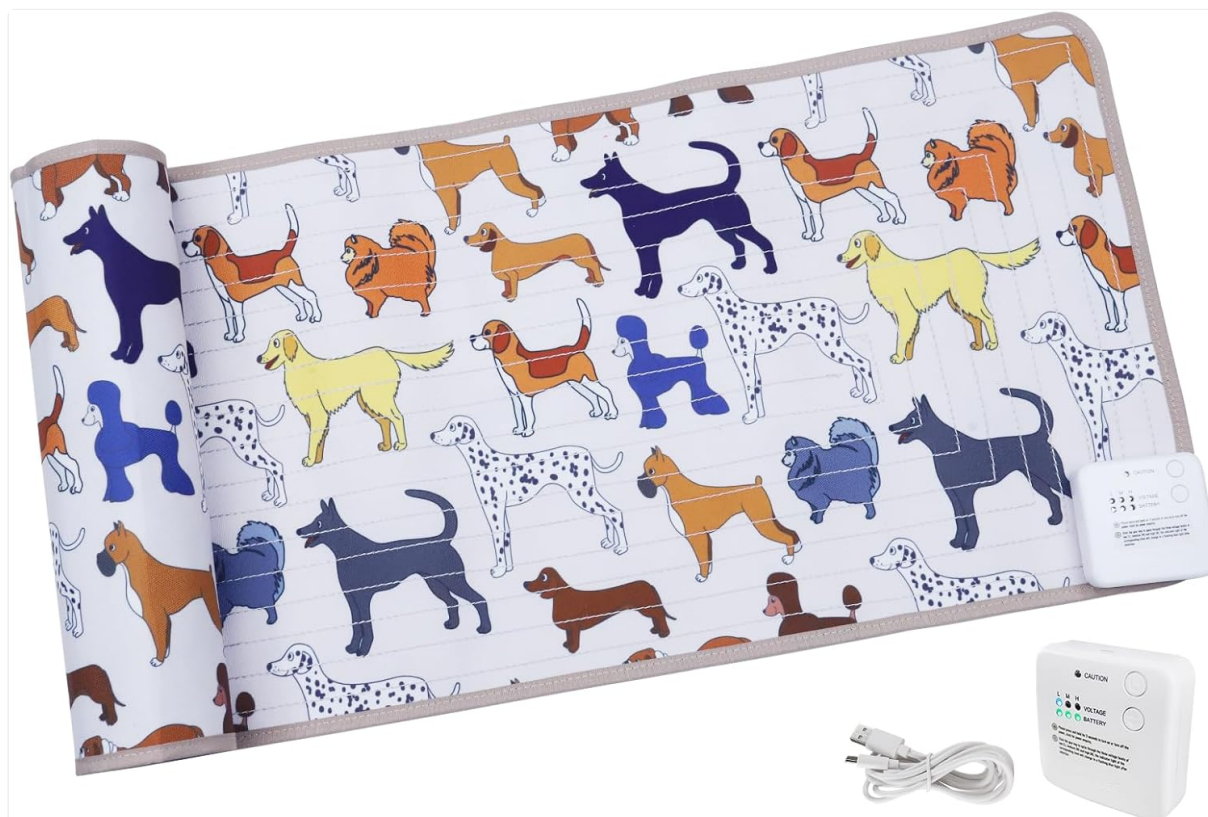
Image 1.1: The DOGNESS Rechargeable Pet Shock Mat with its control unit and USB charging cable.

The DOGNESS Rechargeable Pet Shock Mat is an electronic training aid designed to help keep pets away from restricted areas such as furniture, countertops, and doorways. It emits a harmless static pulse and a warning sound when a pet steps on it, effectively deterring them from unwanted locations. This manual provides essential information for the safe and effective use of your pet shock mat.