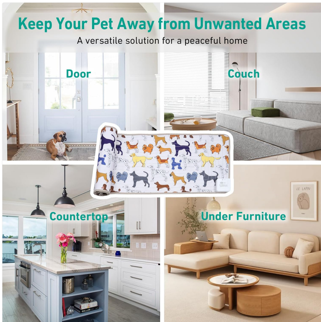
Image 5.2: Examples of effective mat placement to keep pets away from unwanted areas.