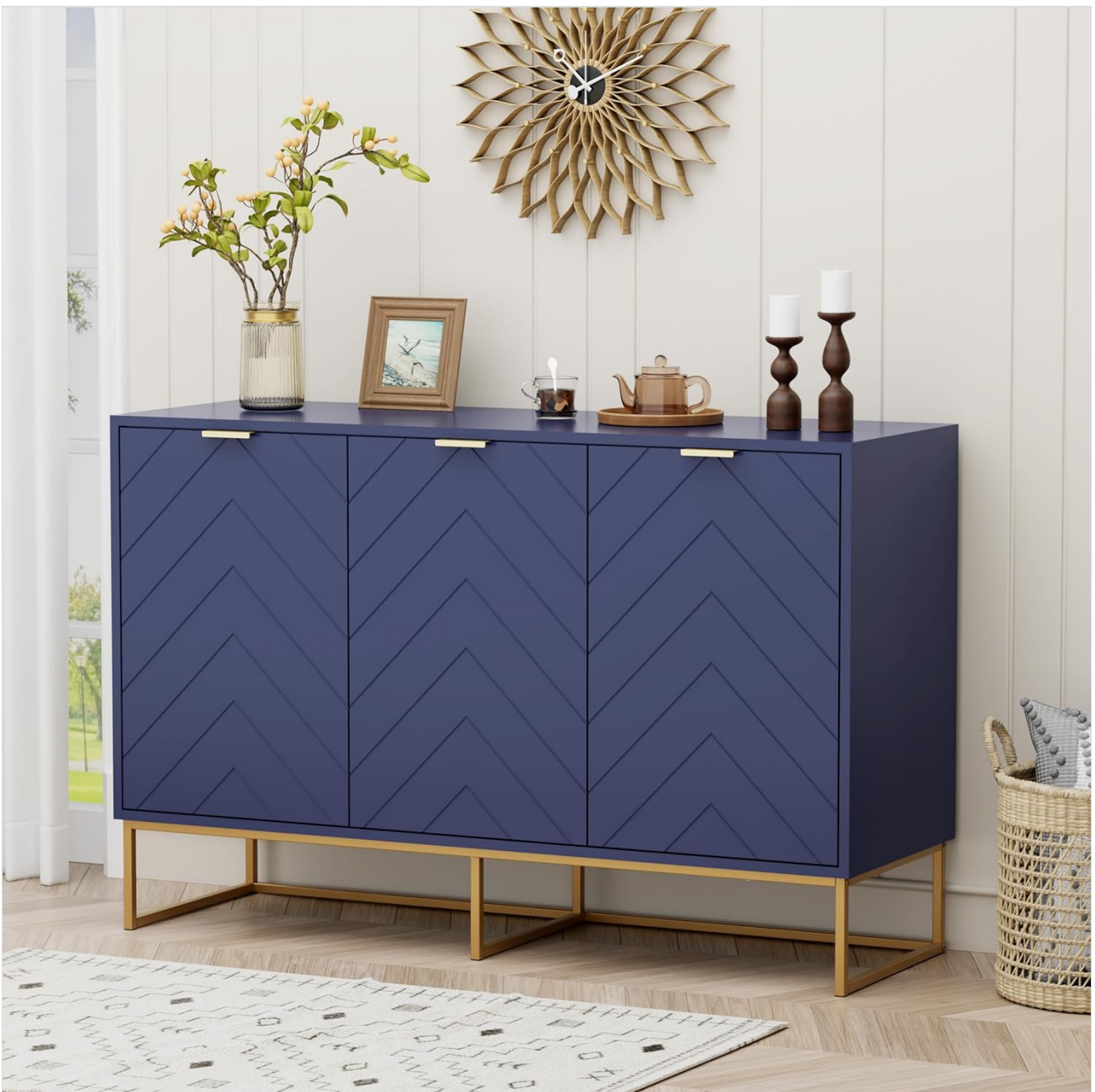
Image 2: Assembled Cabinet. This image shows the fully assembled Scurry sideboard cabinet with its herringbone door design and golden handles, placed in a room.