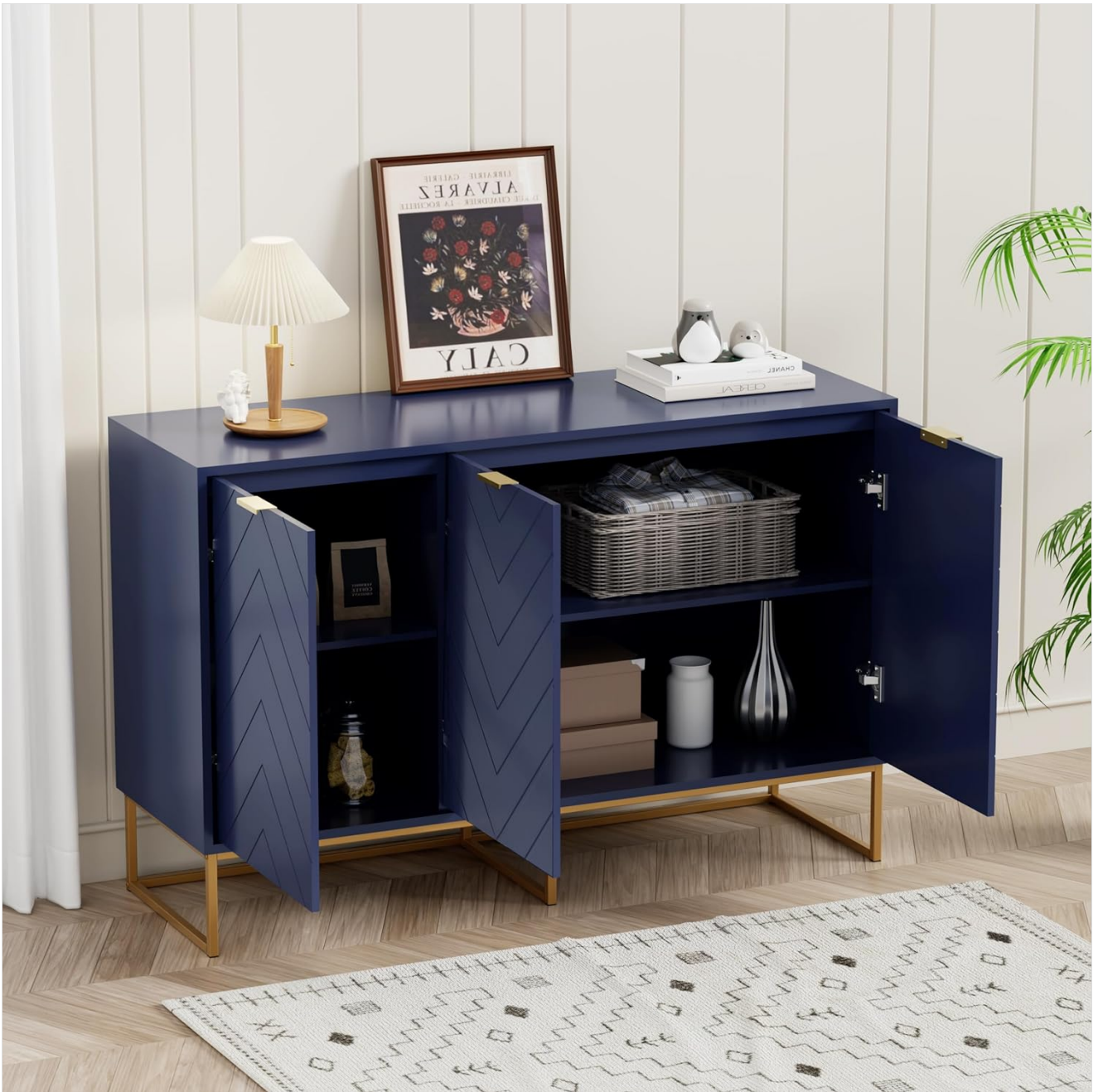
Image 4: Interior Storage. This image displays the cabinet with its doors open, revealing the spacious interior with adjustable shelves, suitable for various items like baskets, books, and decorative objects.