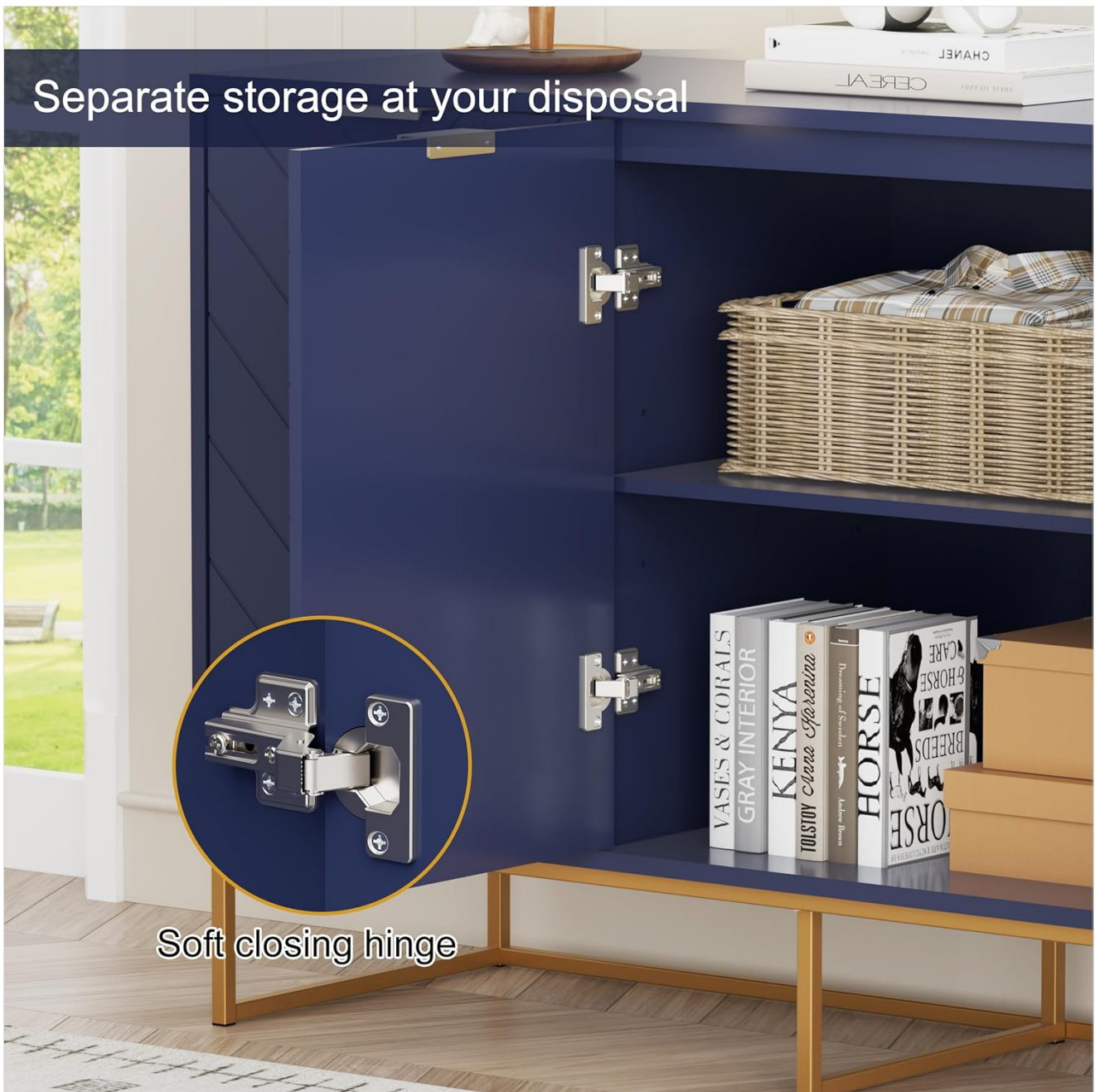
Soft closing hinge

Image 5: Soft-Closing Hinge. A detailed view of the soft-closing hinge, which ensures quiet and gentle door closure, enhancing the cabinet's functionality.