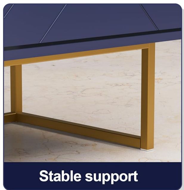
Image 3: Product Details. This image highlights key features such as the golden handles, the simple lines of the herringbone door fronts, and the stable metal base providing support.