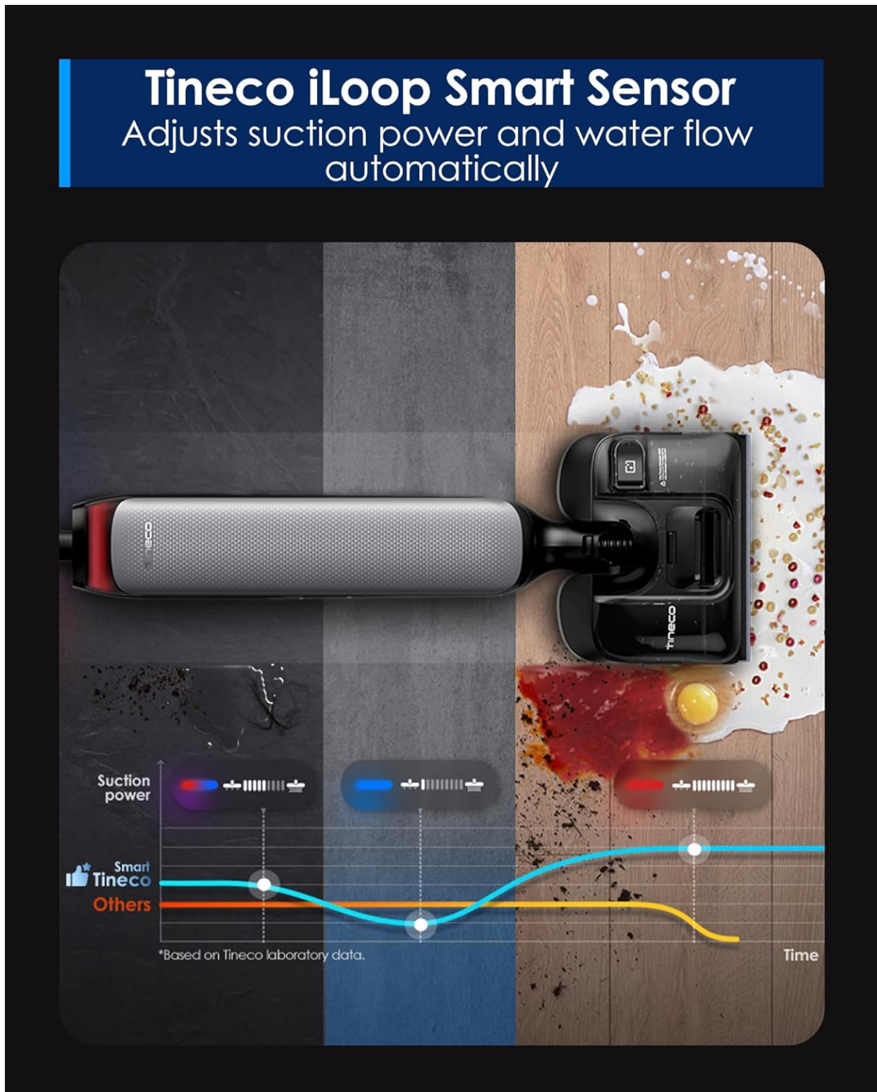
Image: A graphic representation of the iLoop Smart Sensor technology, illustrating how the device automatically adjusts cleaning power based on detected dirt levels.

The iLoop Smart Sensor automatically detects dirt and debris on your floor and adjusts suction power and water flow accordingly, ensuring efficient cleaning without manual adjustments.