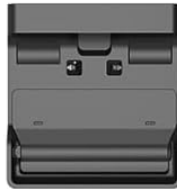
Drying & Charging Dock