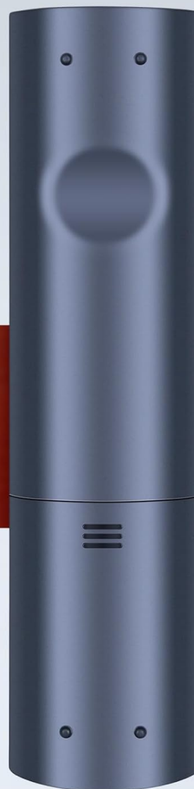
Figure 2.1: Battery compartment and AAA battery insertion. Ensure correct polarity when inserting batteries.