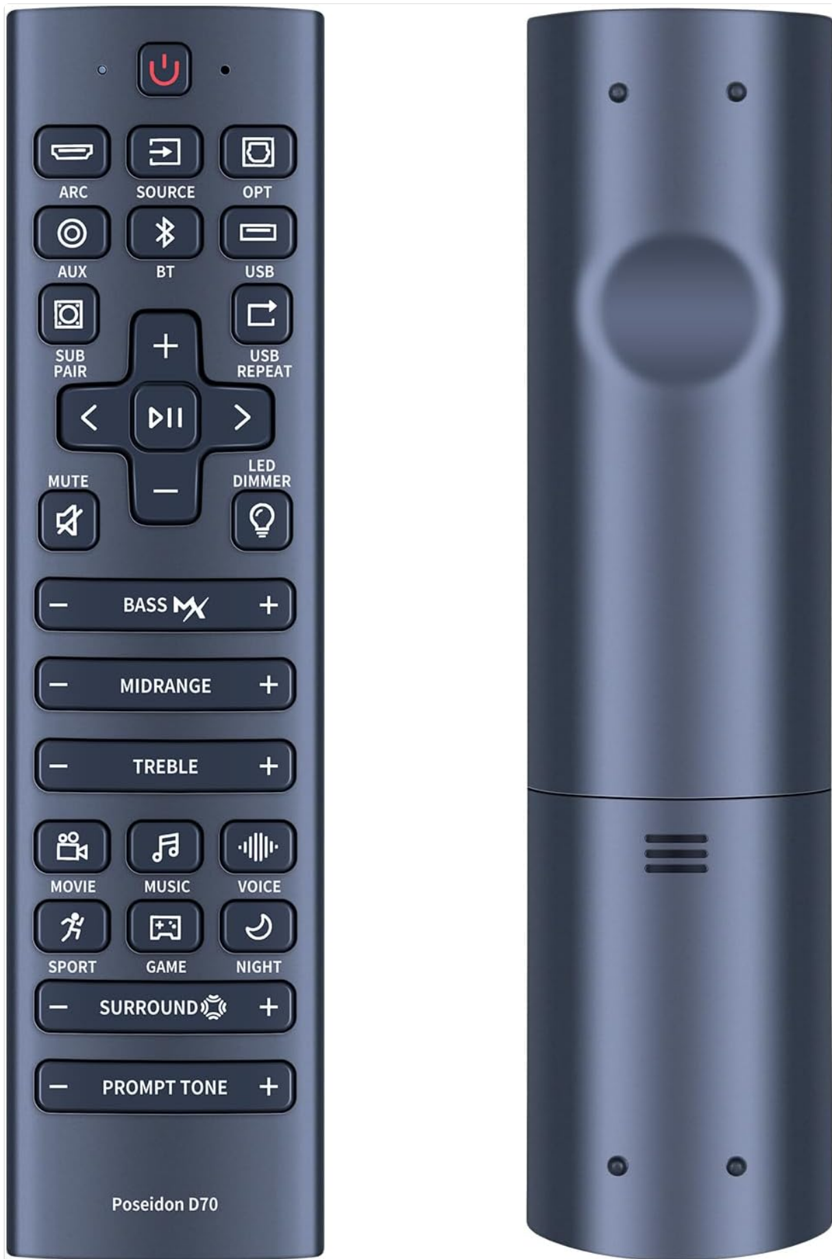
Figure 3.1: Layout of the GWVEE Replacement Remote Control.