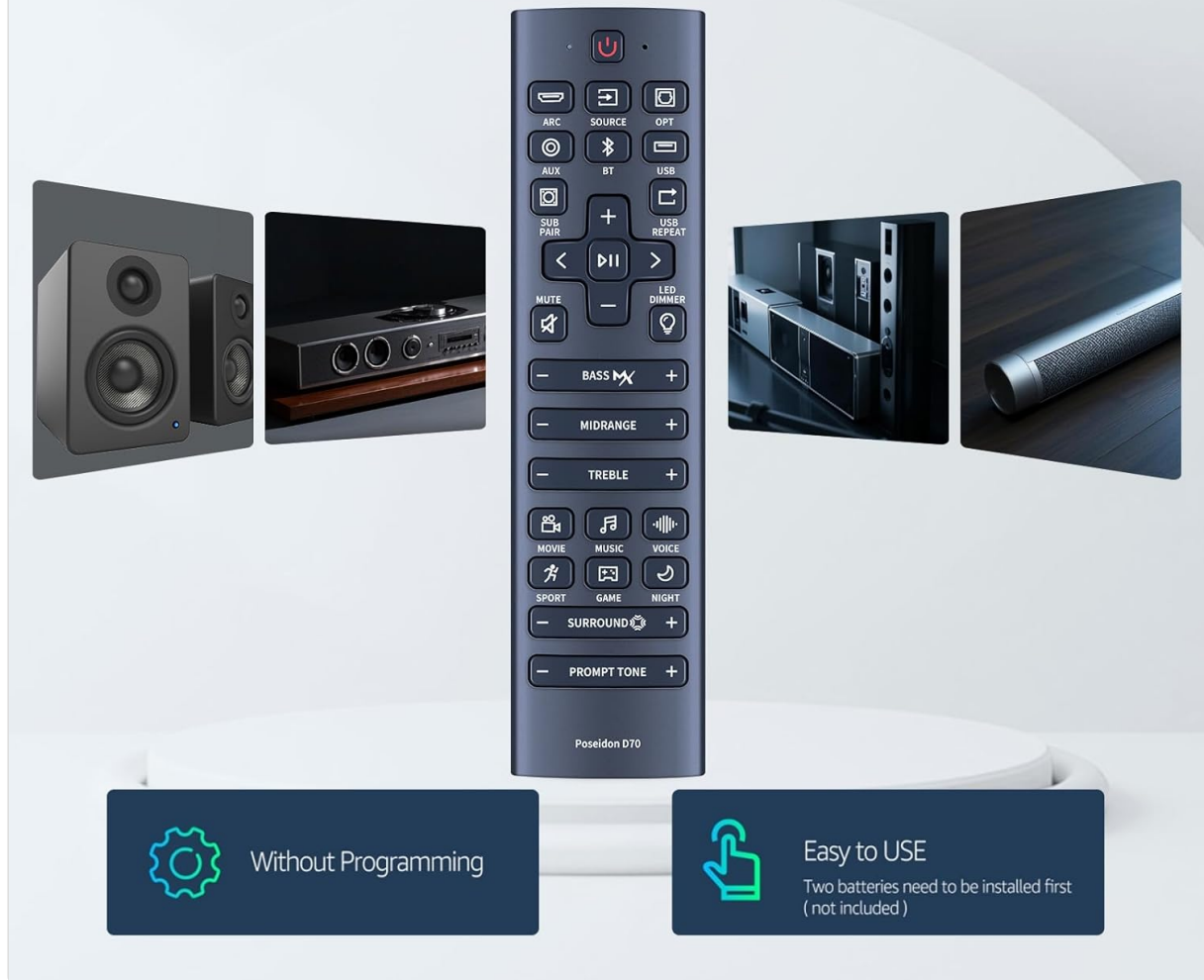
Figure 2.2: The remote control is ready for use directly after battery installation, requiring no programming.

Control Your Soundbar without Programming