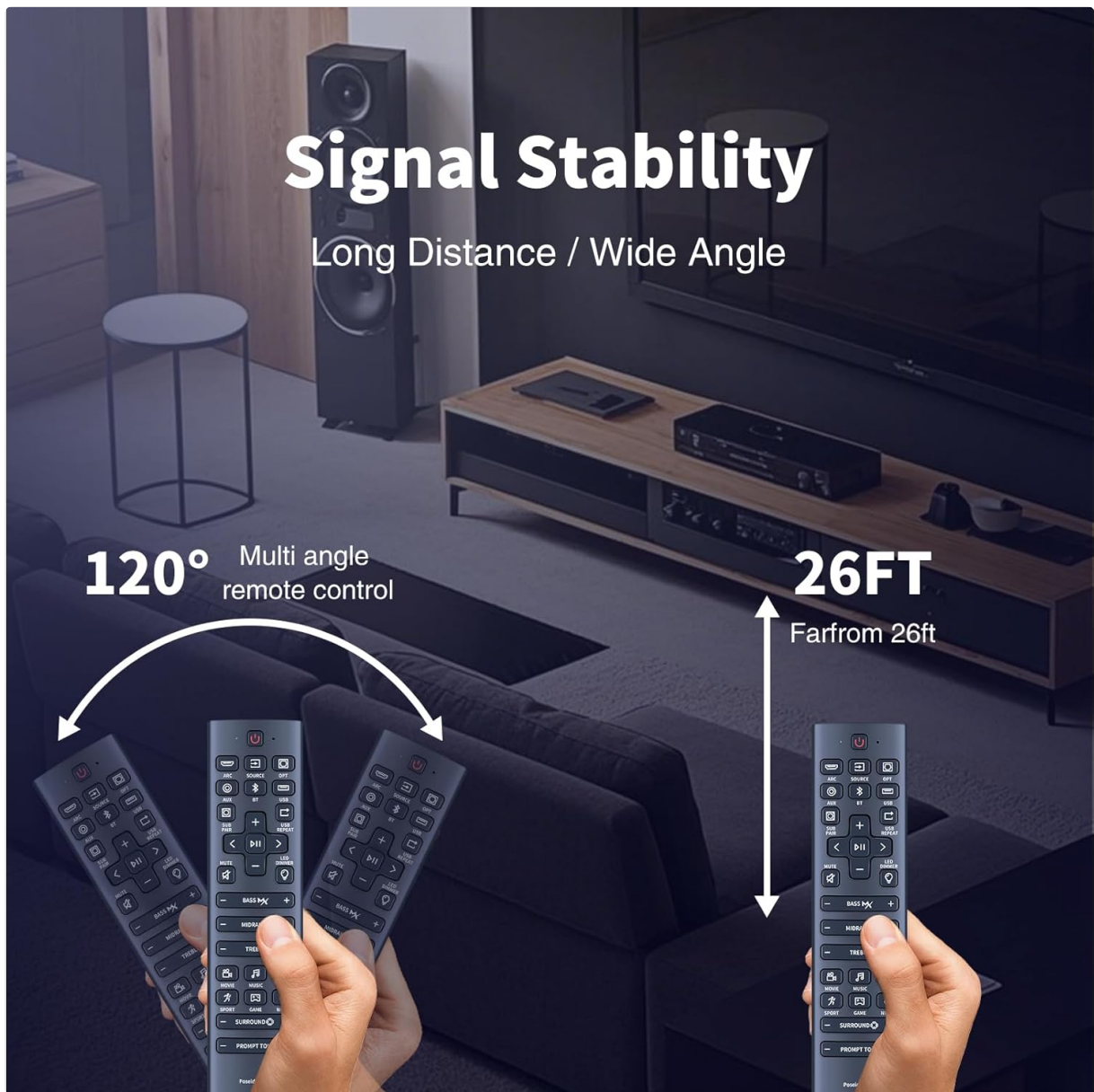
Figure 3.3: The remote control maintains signal stability over long distances and wide angles.