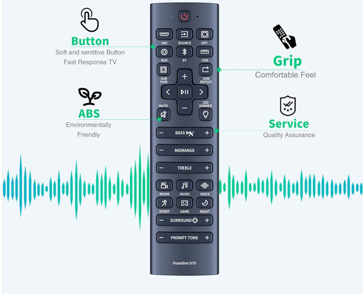
Figure 3.2: The remote features responsive buttons and an ergonomic design for comfortable handling.