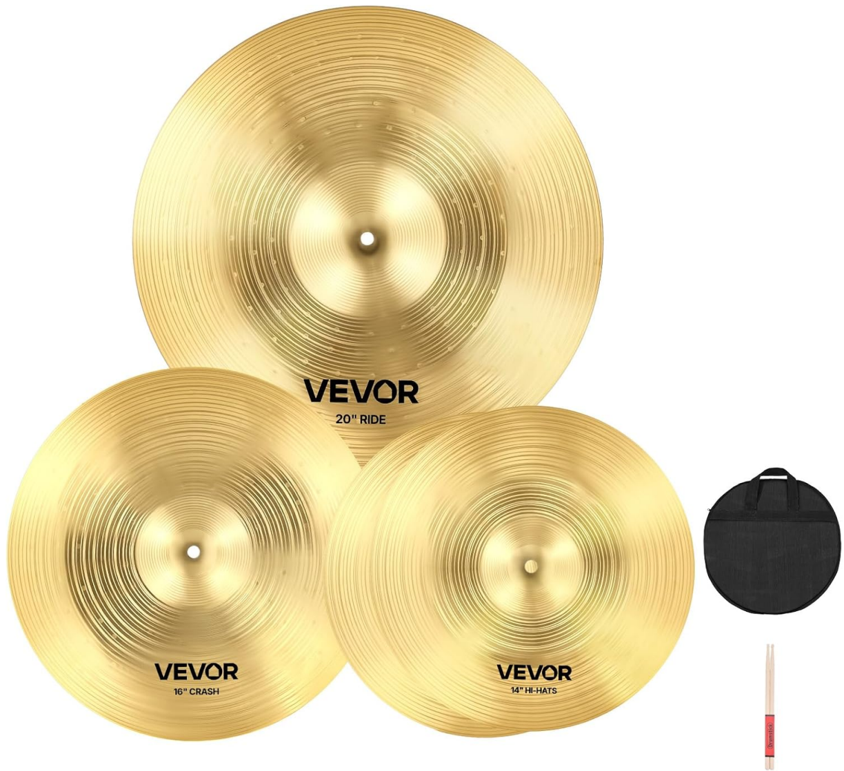
Image: The VEVOR 3-Piece Alloy Cymbal Pack, including 14-inch Hi-Hats, 16-inch Crash, and 20-inch Ride cymbals, set up on a drum kit.