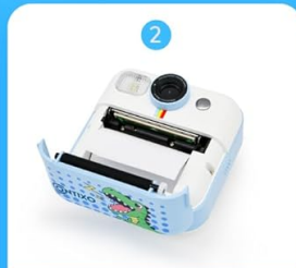
2 Insert the roll of thermal printer paper into the compartment