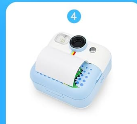
4 Tear the photo paper downward when removing the photo

Image: Contents of the Contixo KC4 package, including the camera, paper rolls, lanyard, charging cable, markers, manual, and SD card.