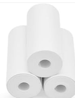
3 × Printing Paper