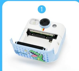
1 Open the paper compartment in the direction of the arrow