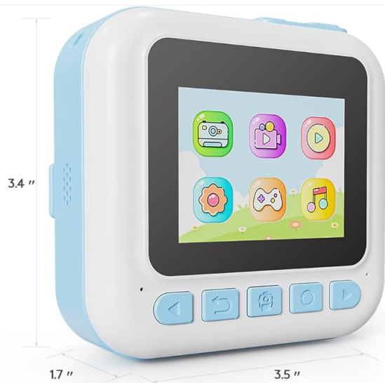
1 × Kids Instant Print Camera