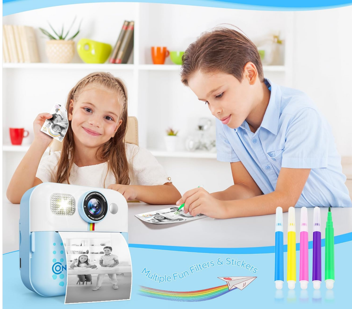
Image: Two children engaged in coloring a black and white instant print from the Contixo KC4 camera using colorful markers.