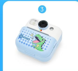
3 Close the paper compartment