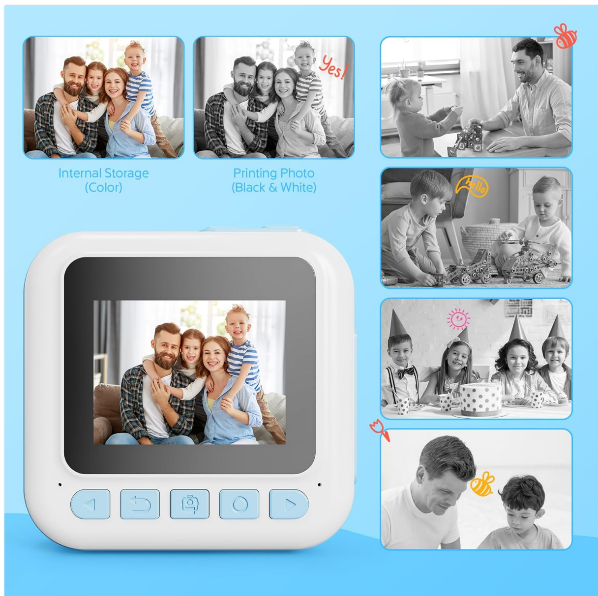
Image: Comparison of a color image stored internally and its corresponding black and white instant print from the camera.