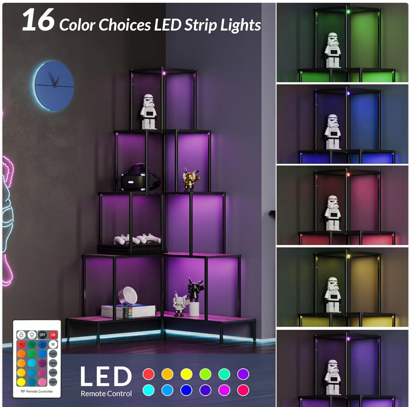
Image: The plant stand with its RGB lights displaying multiple color options, accompanied by an image of the remote control used to manage the lighting modes and brightness.