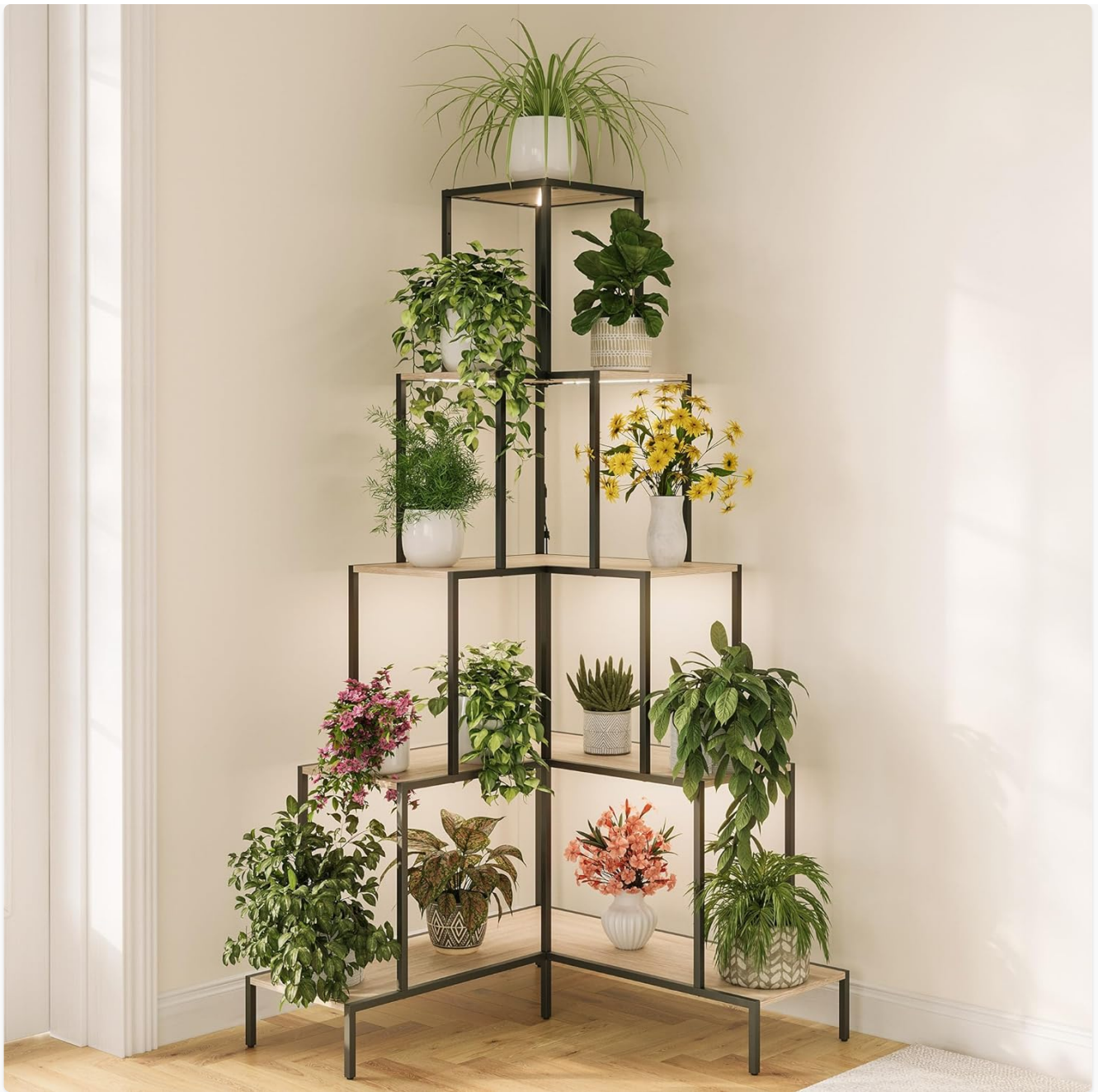
Image: The BELLEZE 5-Tier Corner Plant Stand with RGB Light, fully assembled and adorned with various potted plants, positioned in a room corner.