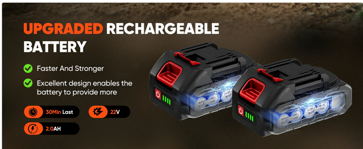
Image: Saker 22V 2.0Ah Lithium-Ion Batteries.

Before first use, fully charge both 22V 2.0Ah batteries. Connect the charger to a power outlet and insert the battery. The indicator lights on the battery will show the charging status. A full charge typically provides up to 30 minutes of runtime per battery.