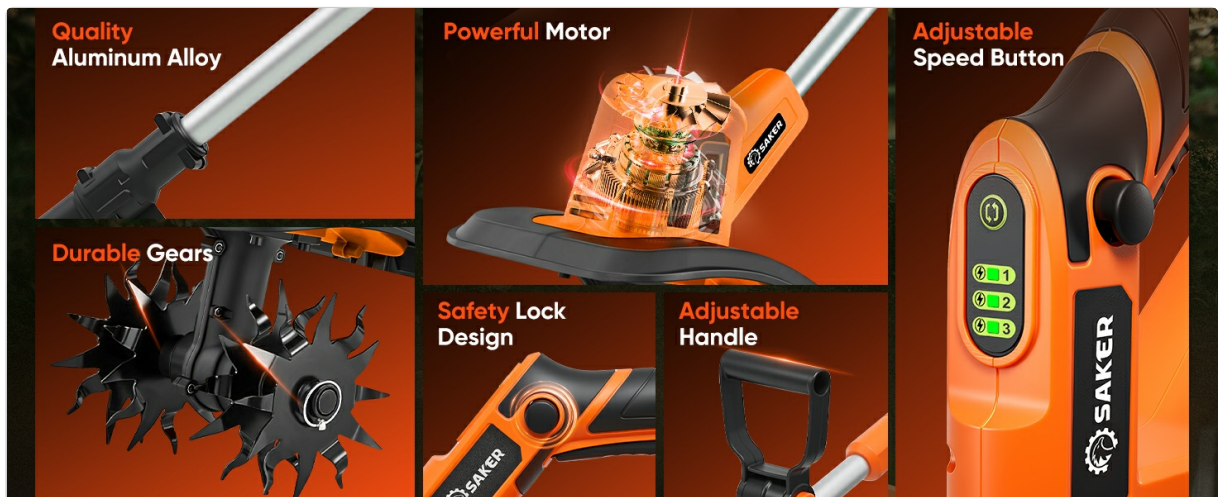
Image: Speed adjustment button and indicators.

The tiller cultivator features 3 adjustable speeds (200/270/360 RPM) for versatile gardening tasks. Use the speed adjustment button on the handle to cycle through the speeds. Select a lower speed for delicate tasks or light weeding, and a higher speed for tougher soil or deeper tilling.