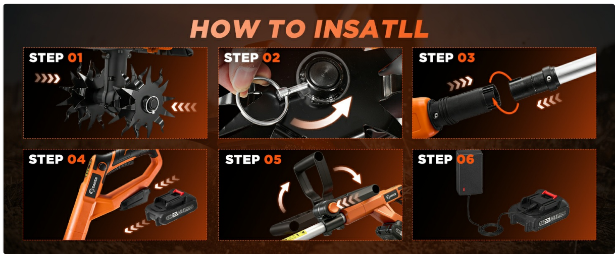
Visual guide for assembling the tiller cultivator.